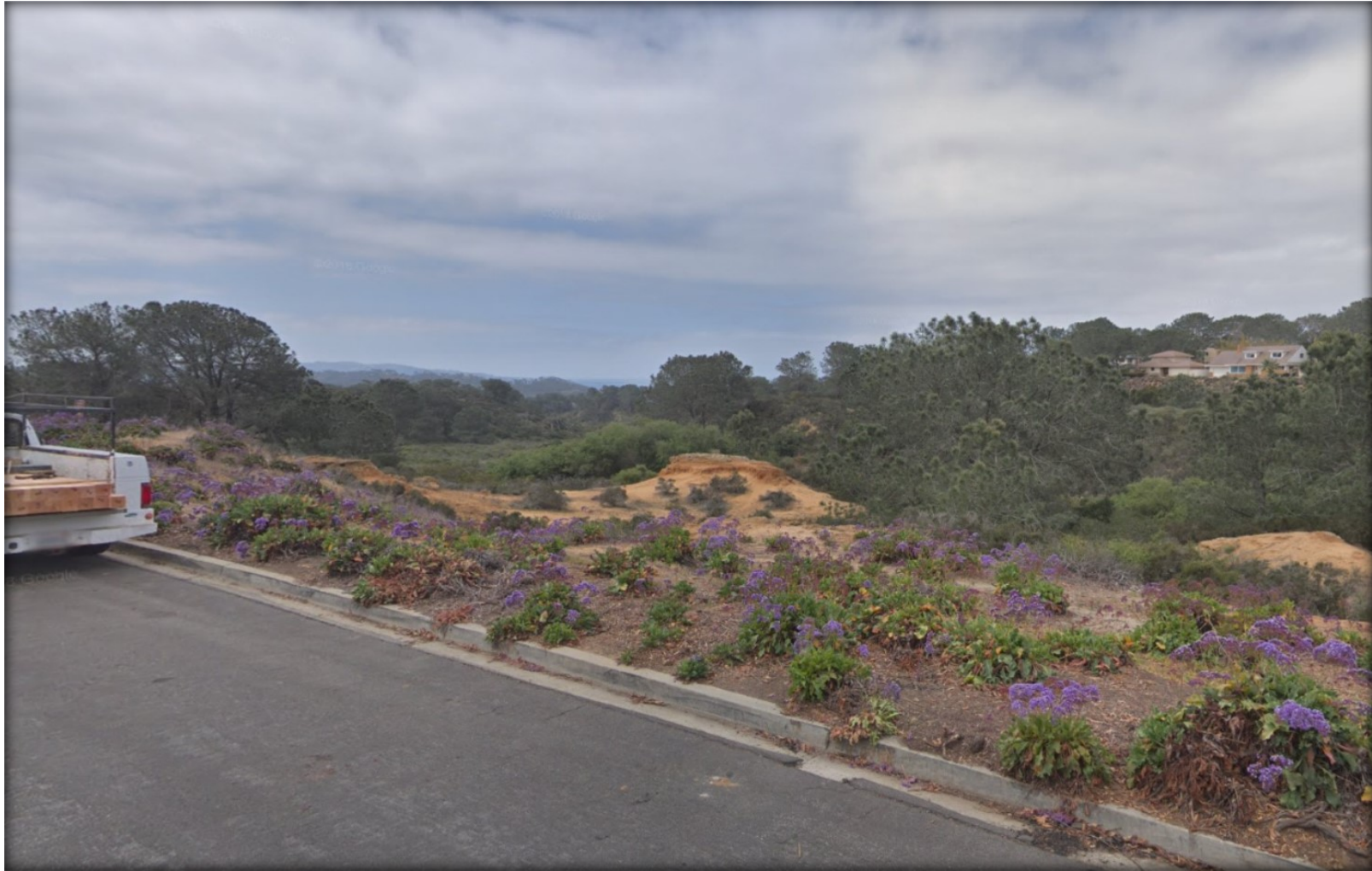
View from the Front Façade