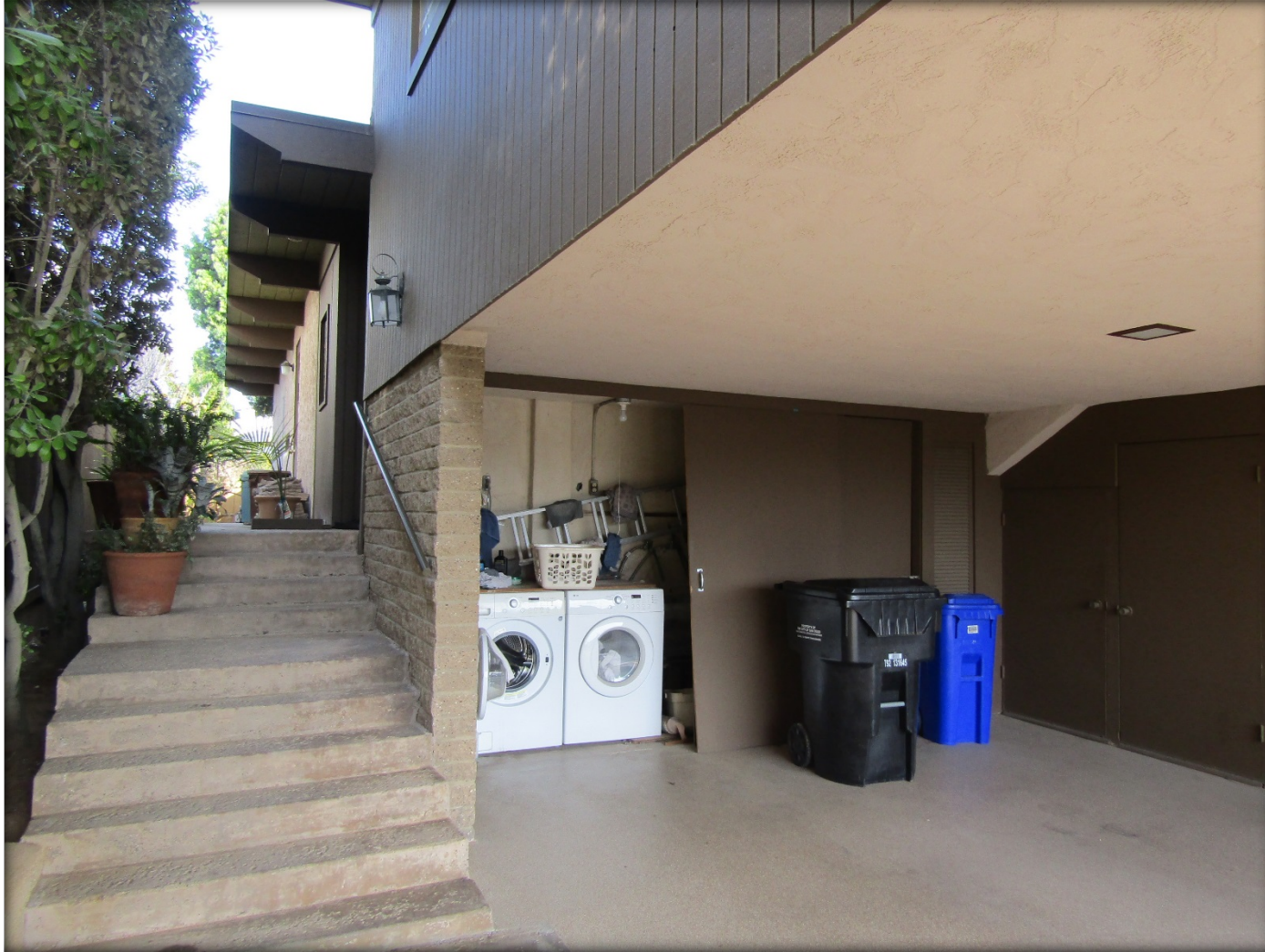
Carport/Front Entry Stairs