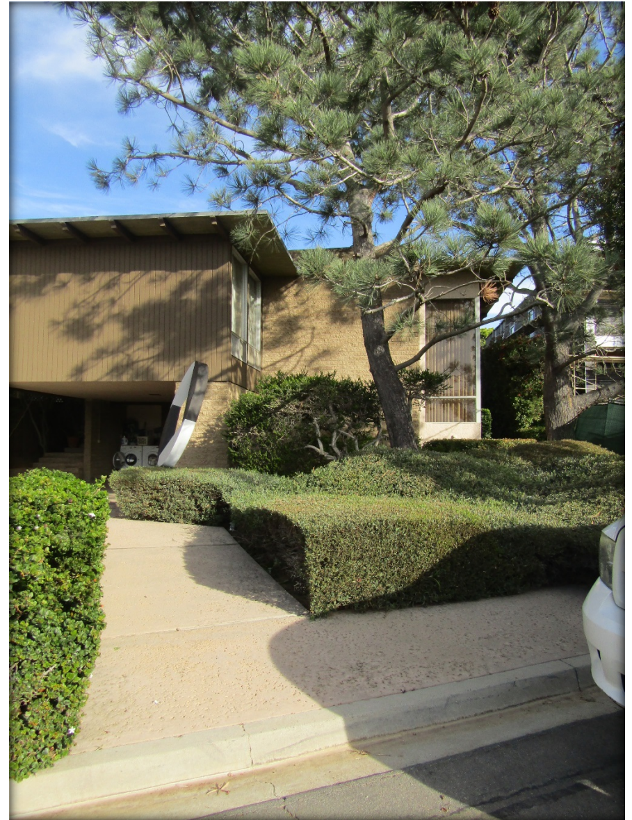
Torrey Pine Tree