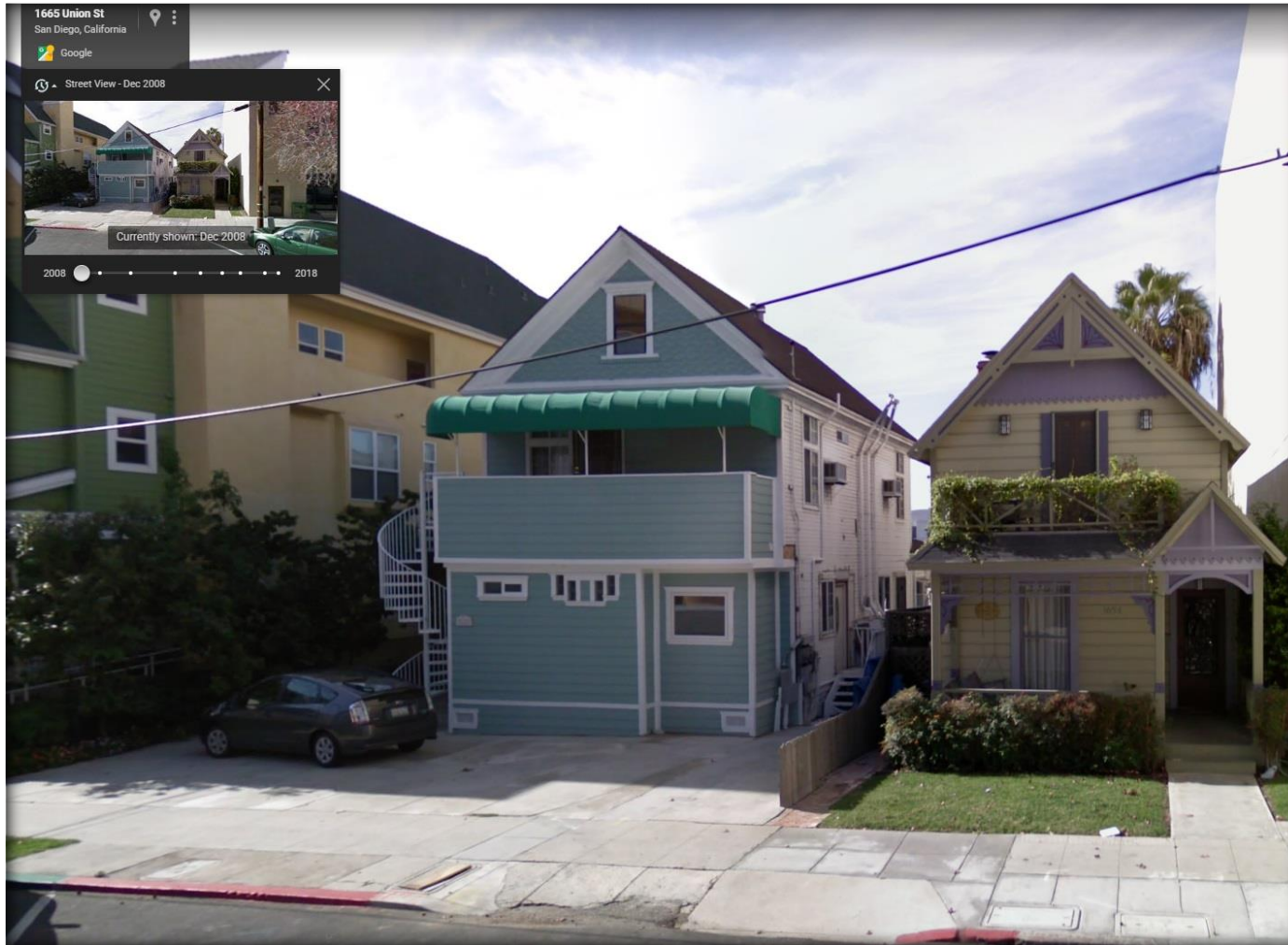
Google Streetview, 2008