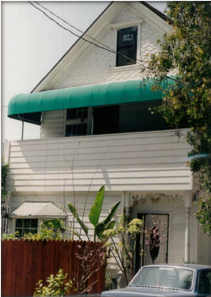
Front Façade, 2002