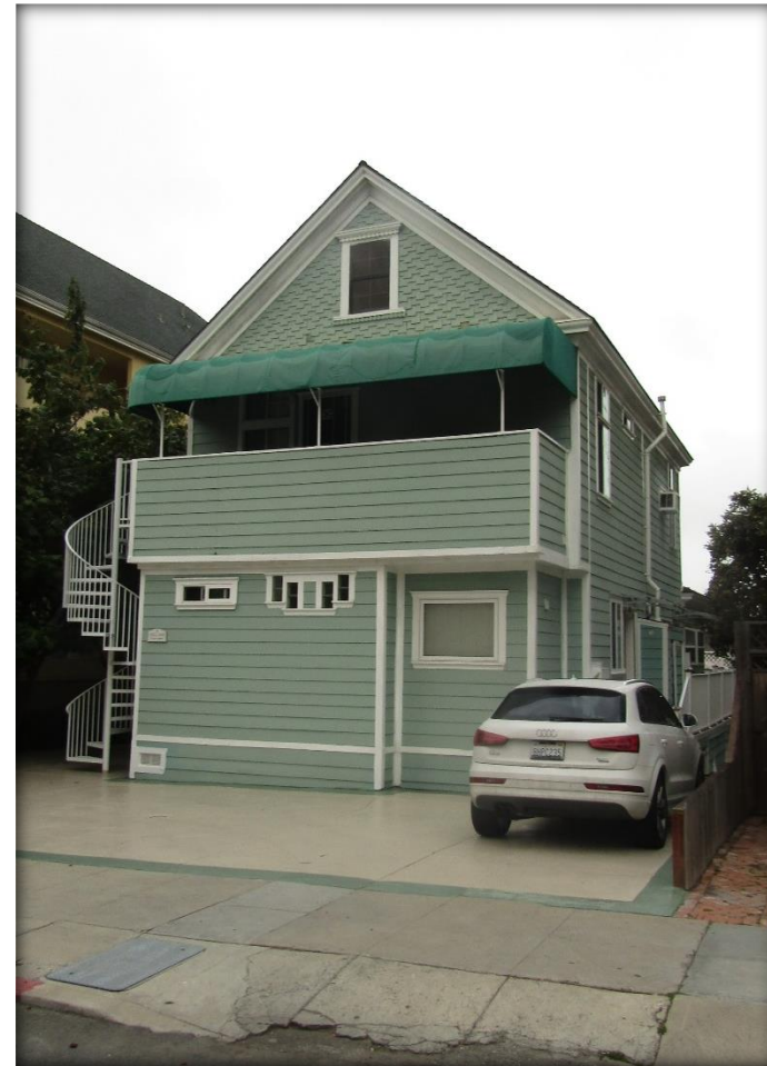
Front Façade, 2019