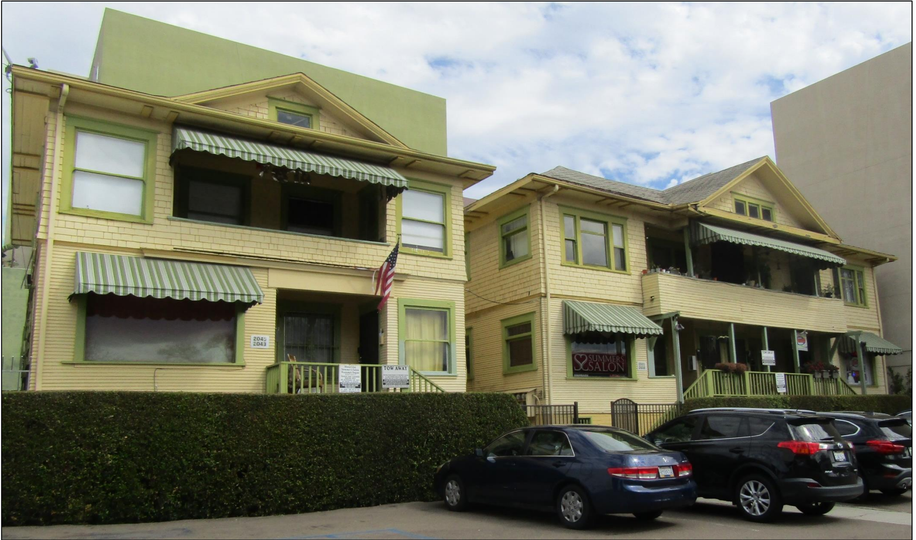
2043-2045 India Street and 2027-2033 India Street