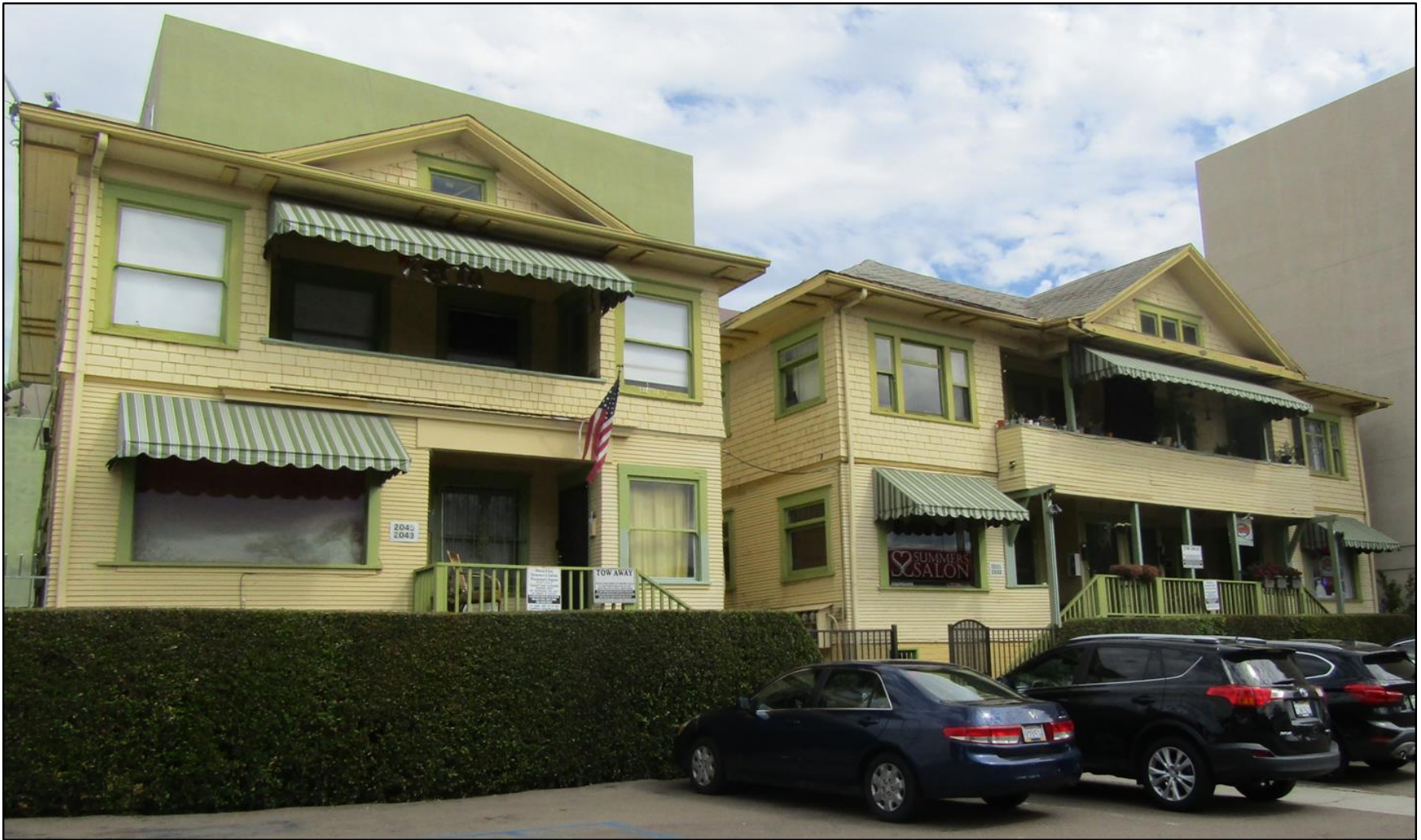
2043-2045 India Street and 2027-2033 India Street