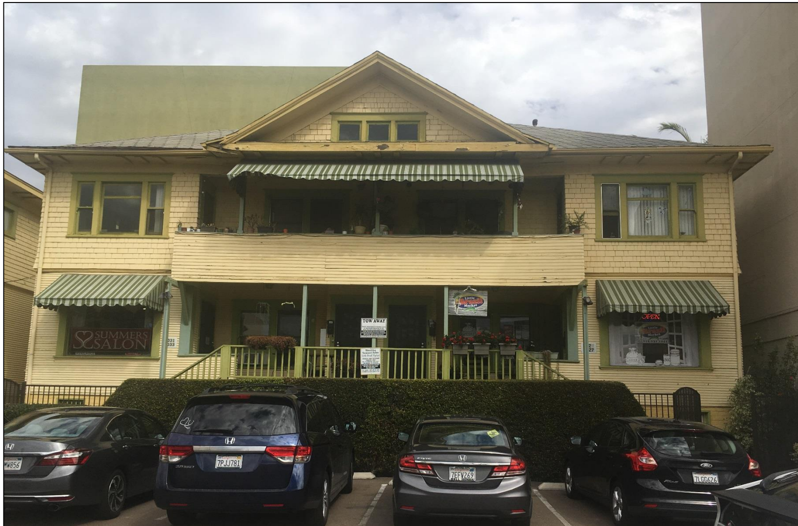
2027-2033 India Street