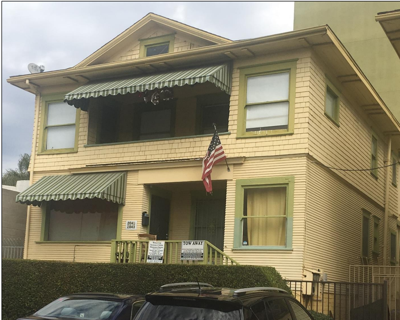
2043-2045 India Street