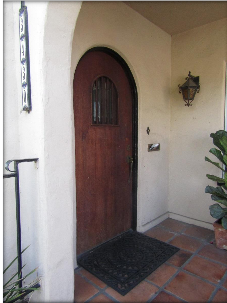
Front Door Detail