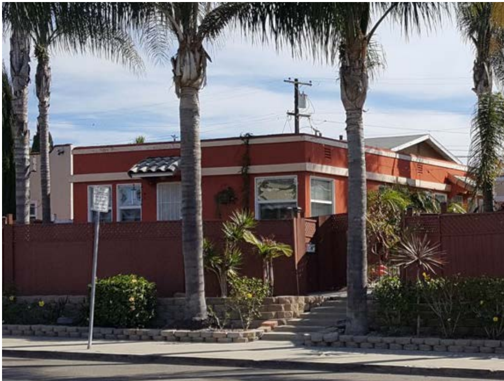
2018-Condition at Time of Submittal