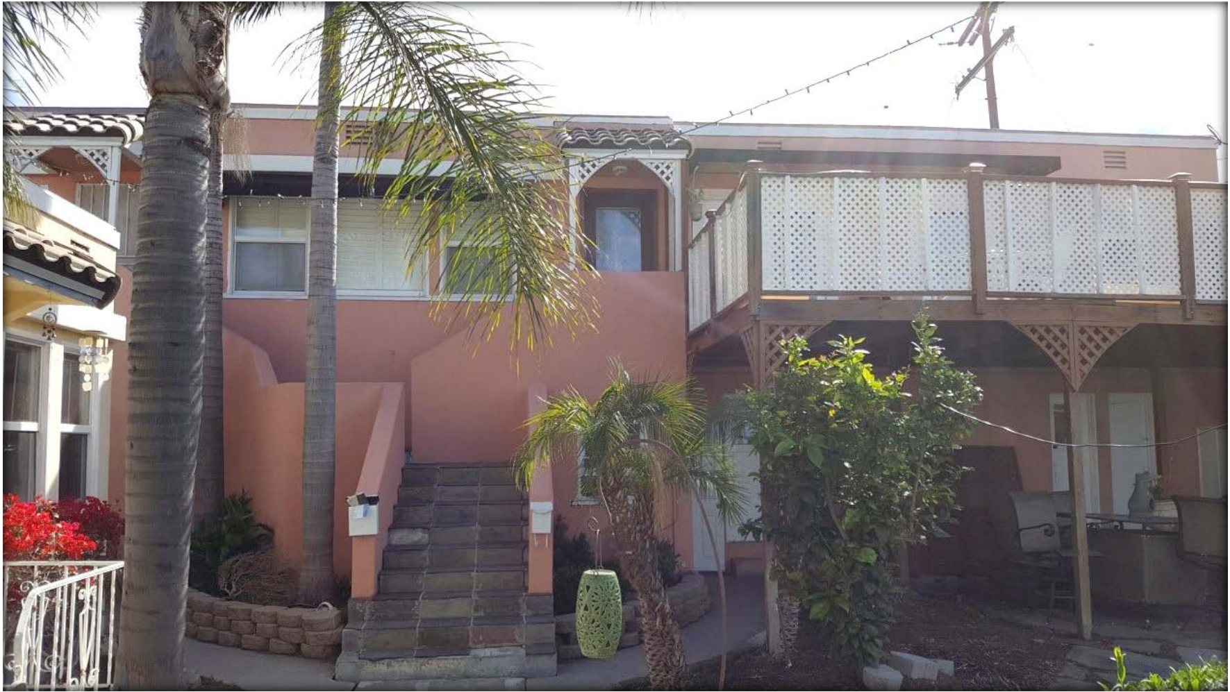
2018-Rear Structure Balcony and Tile Walkway/Steps Detail