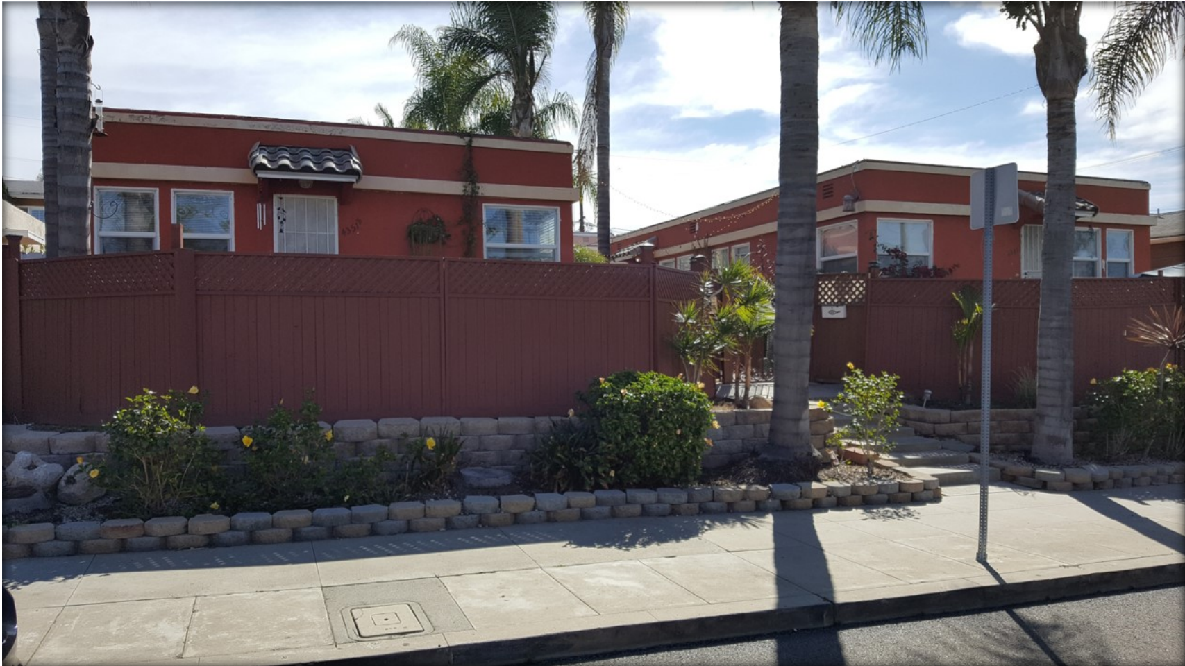
2018 Front Façade