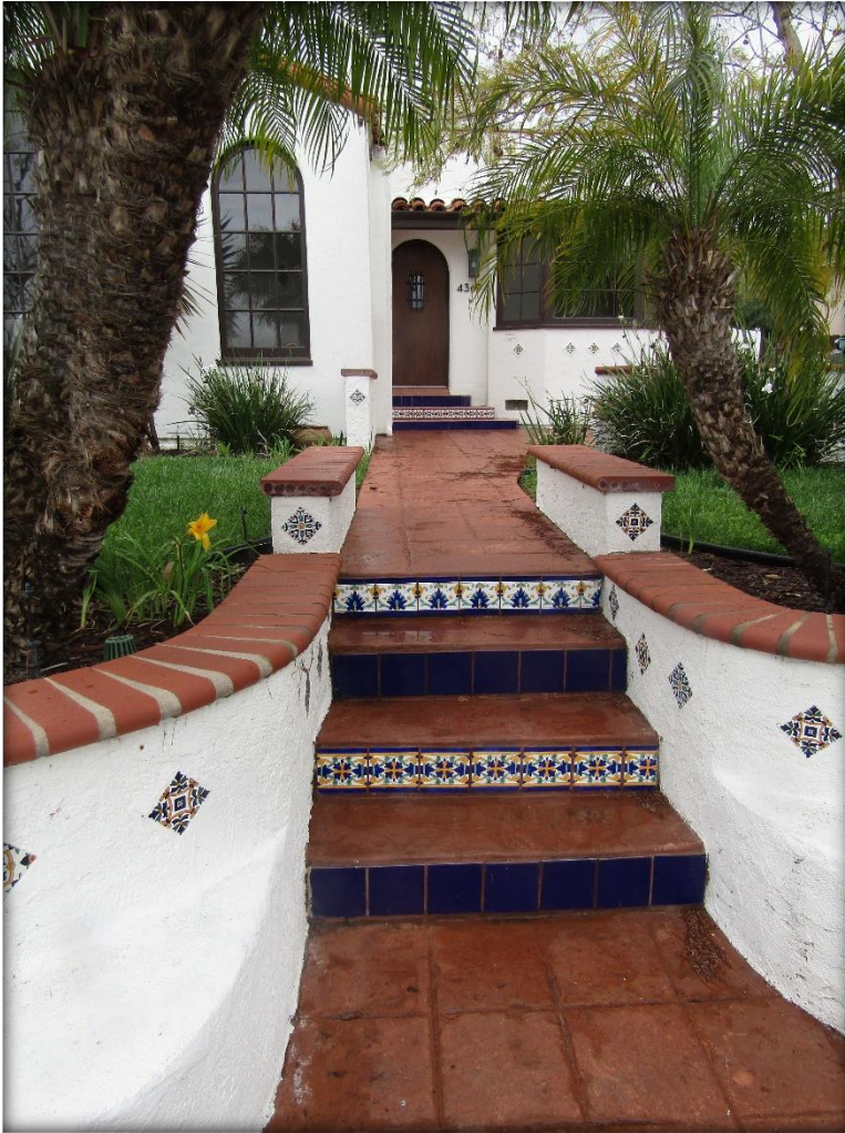
Front Entry and Chimney