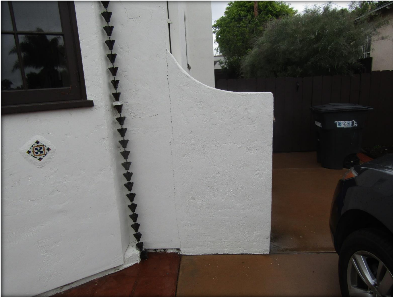
Front Façade - northwest wing wall and the tile additions