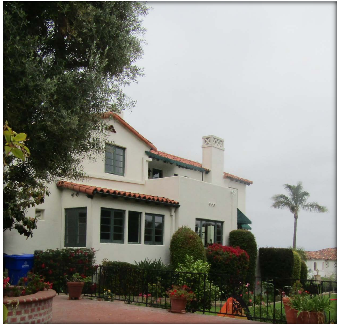
Chimney with Elaborated Top