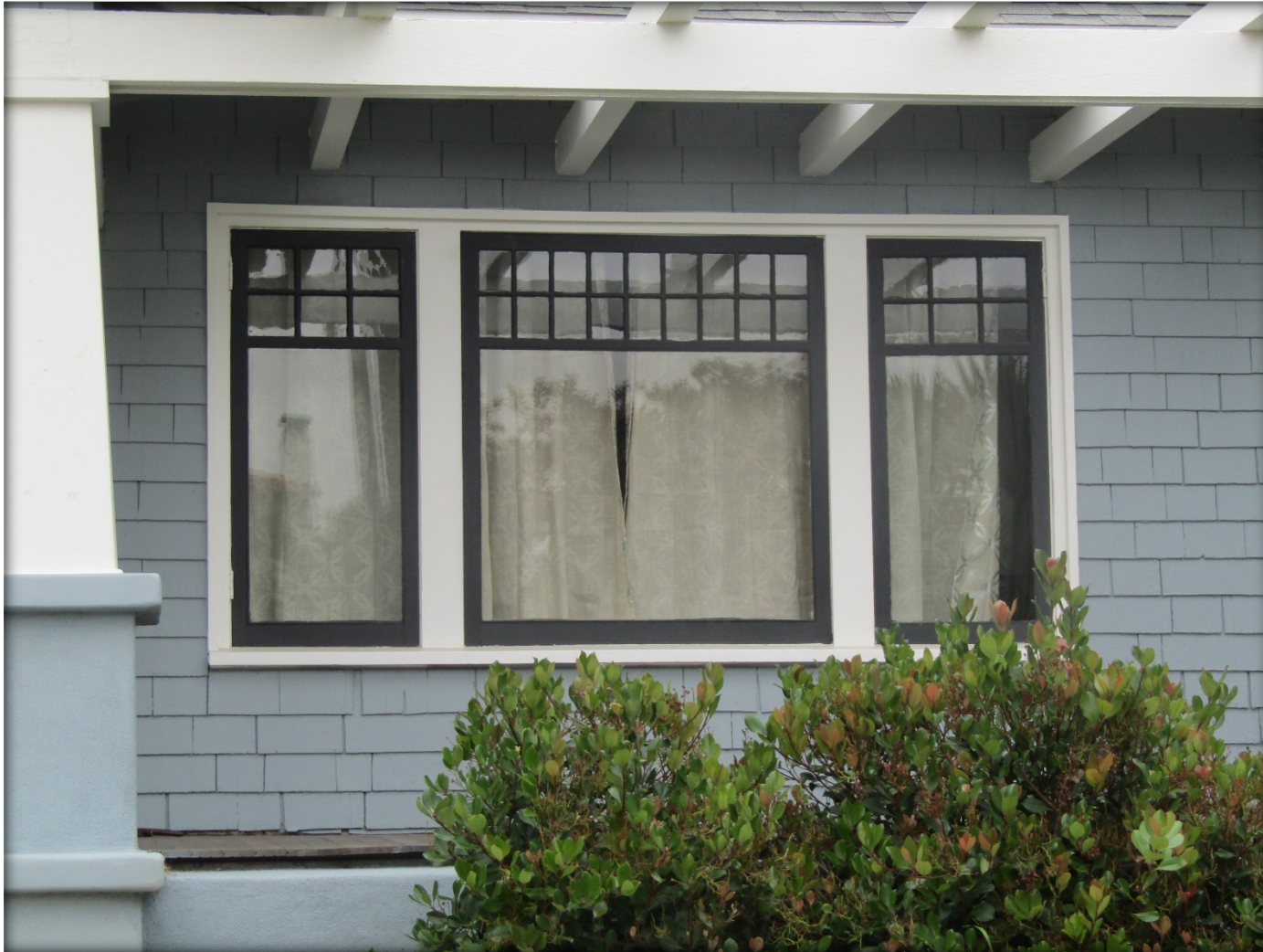
West Façade Detail