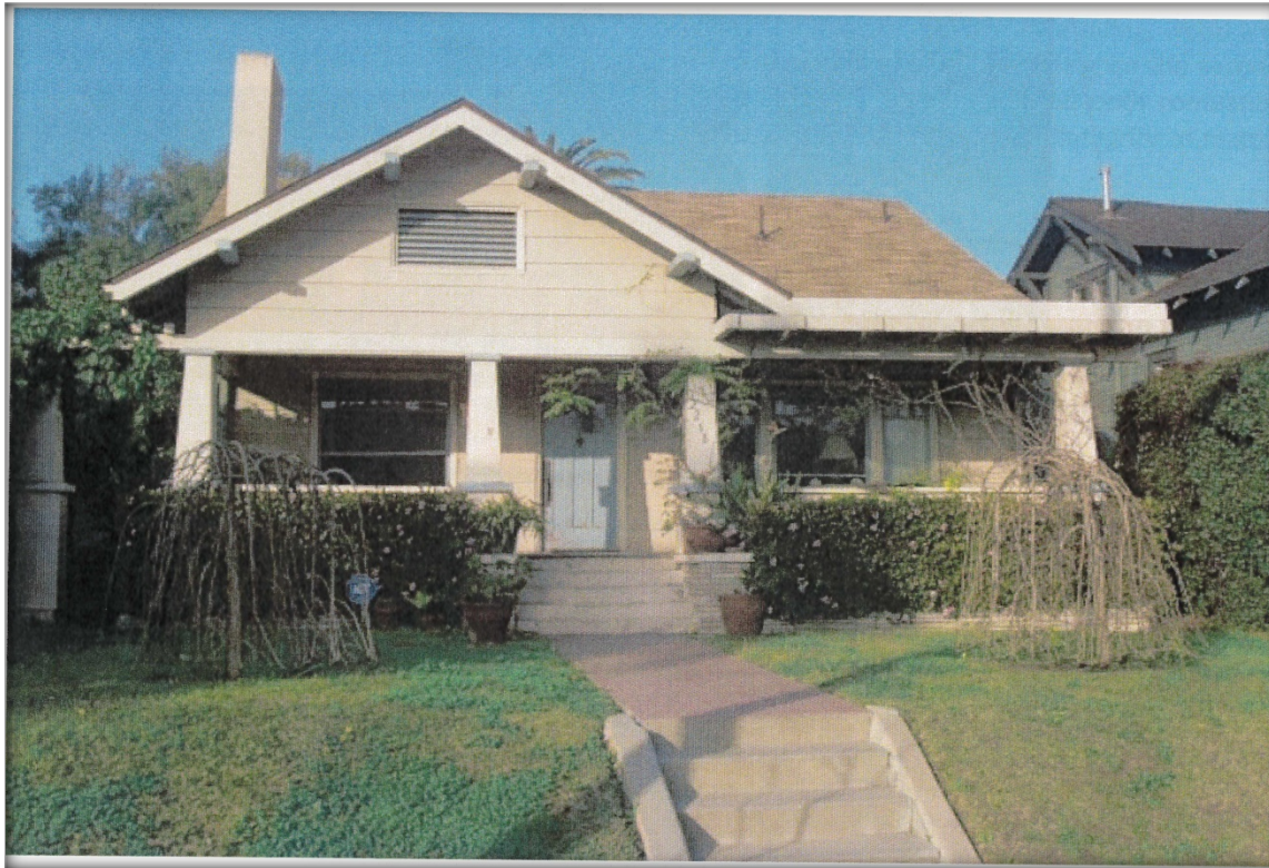
West Façade Before 2017 Rehabilitation Project