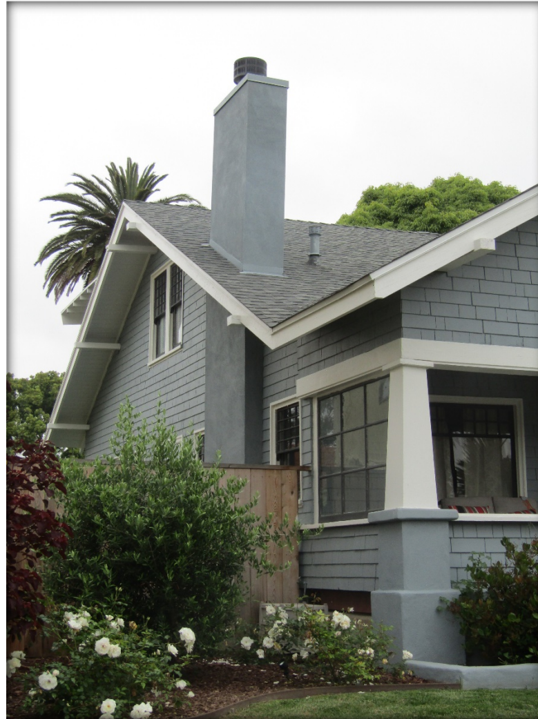
Reconstructed chimney detail