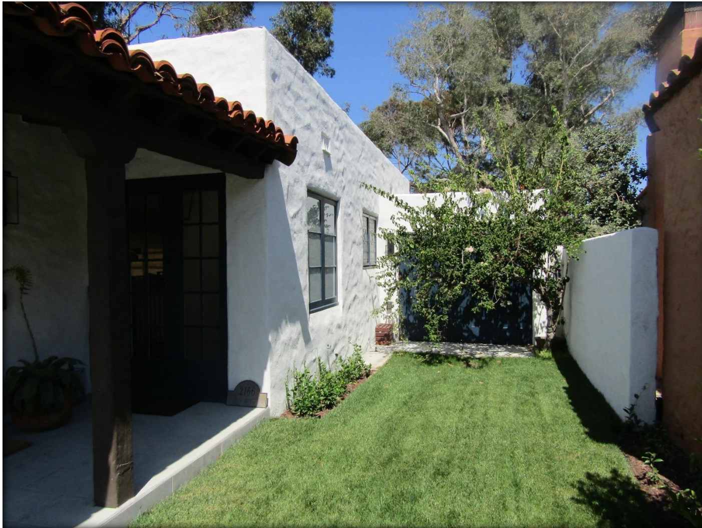
Southeast façade featuring attached garage