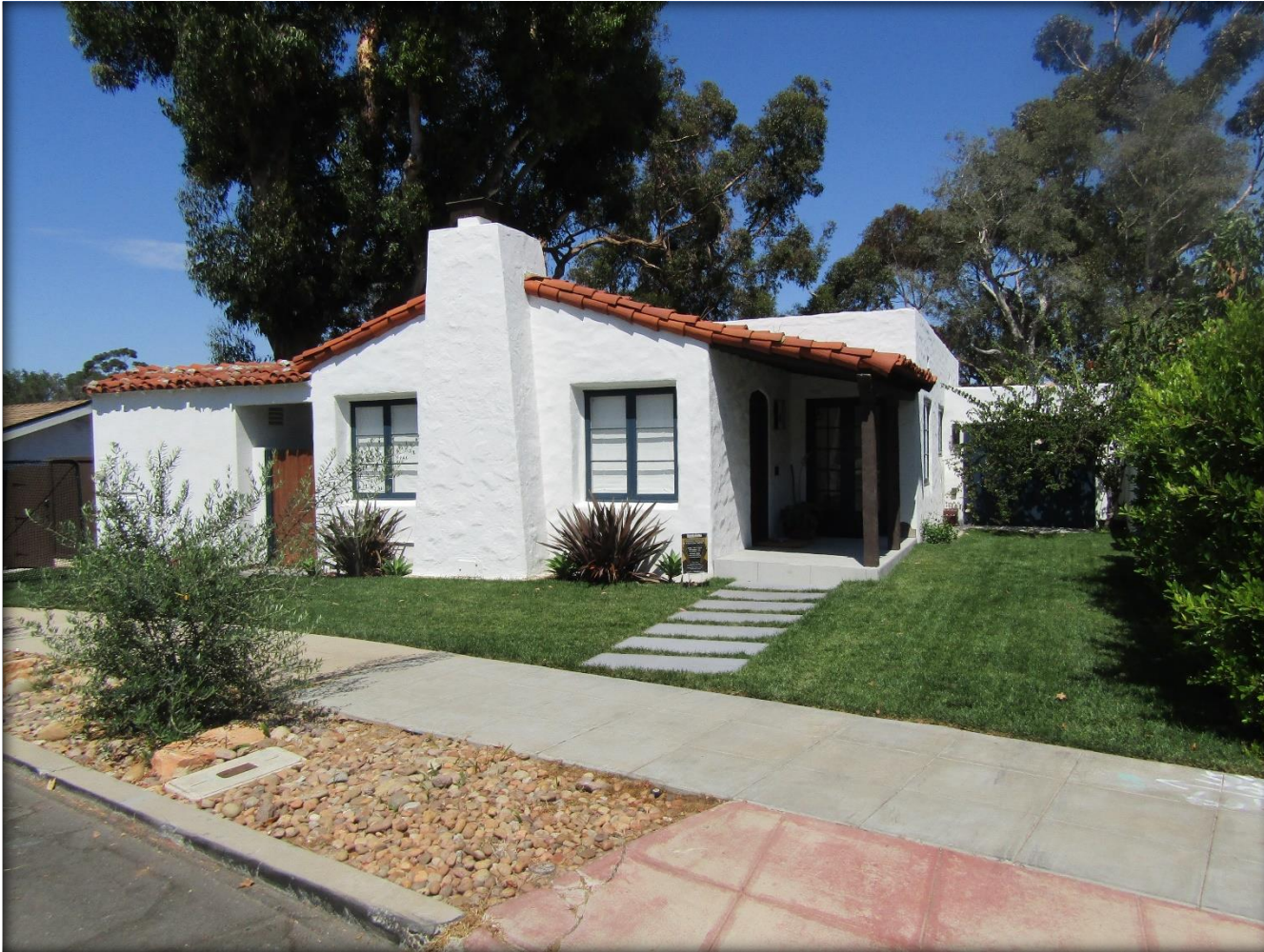
Southwest (front) façade