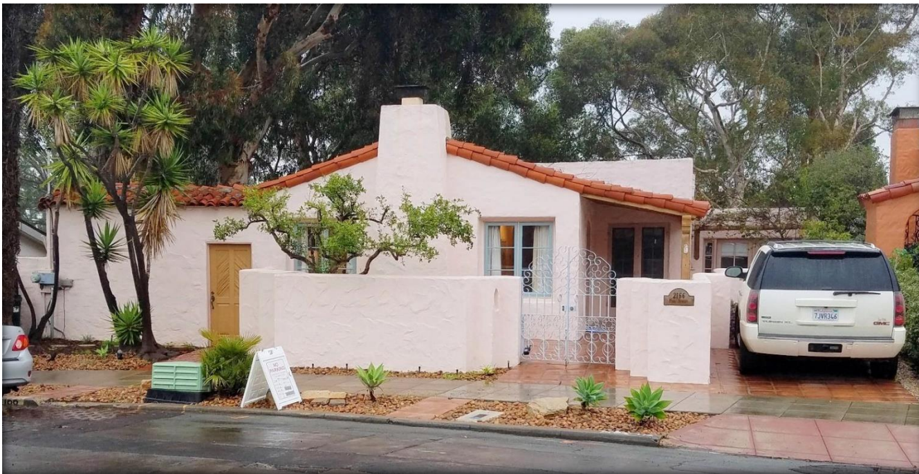
Transitional photo of southwest (front) façade, 2017