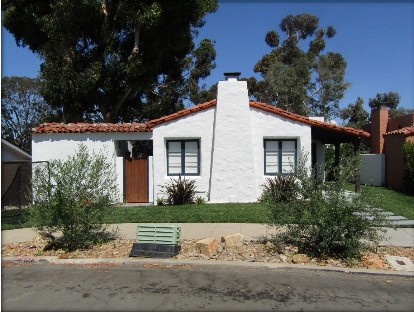
Southwest (front) façade