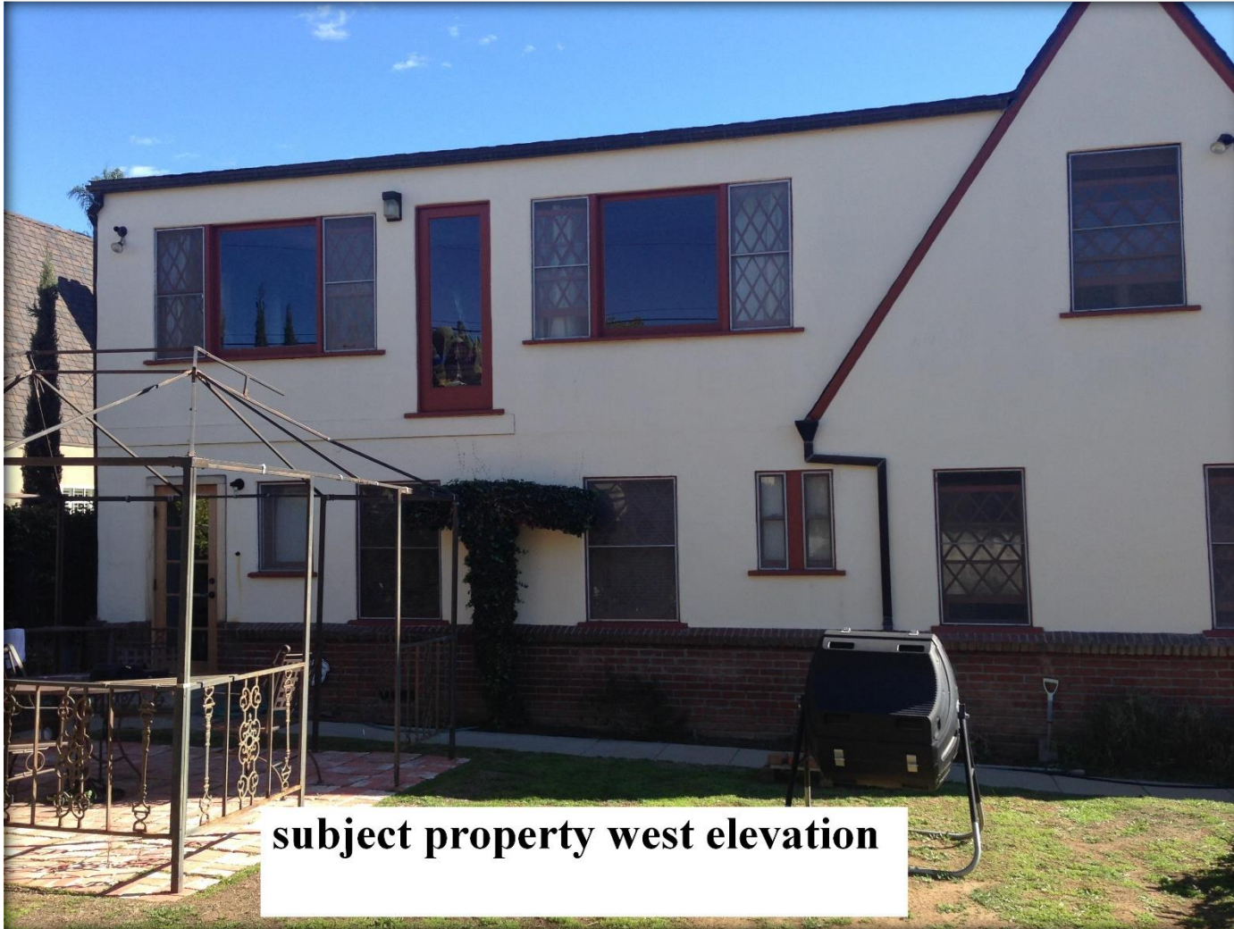
West Elevation 2015