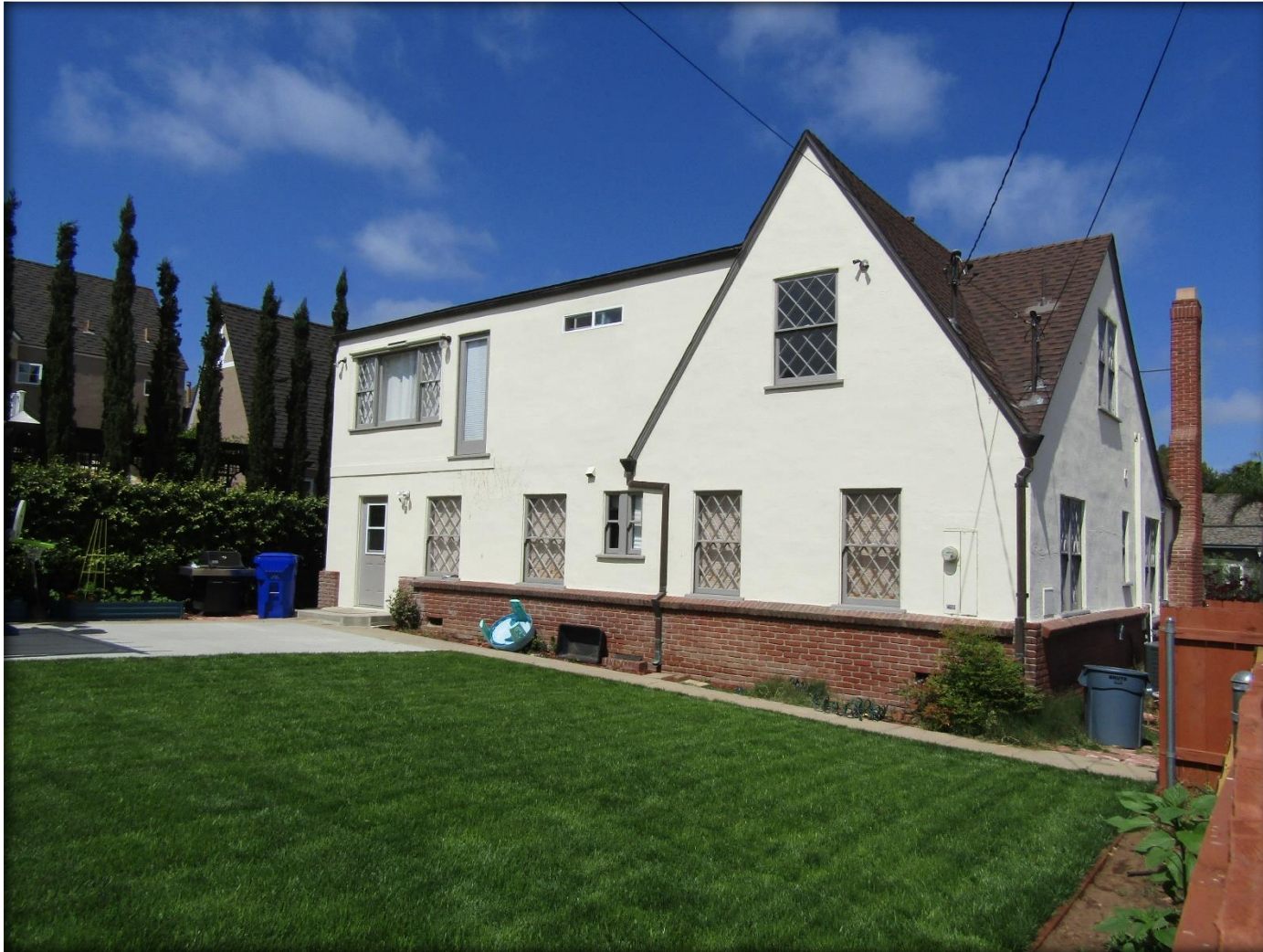
West Elevation 2018