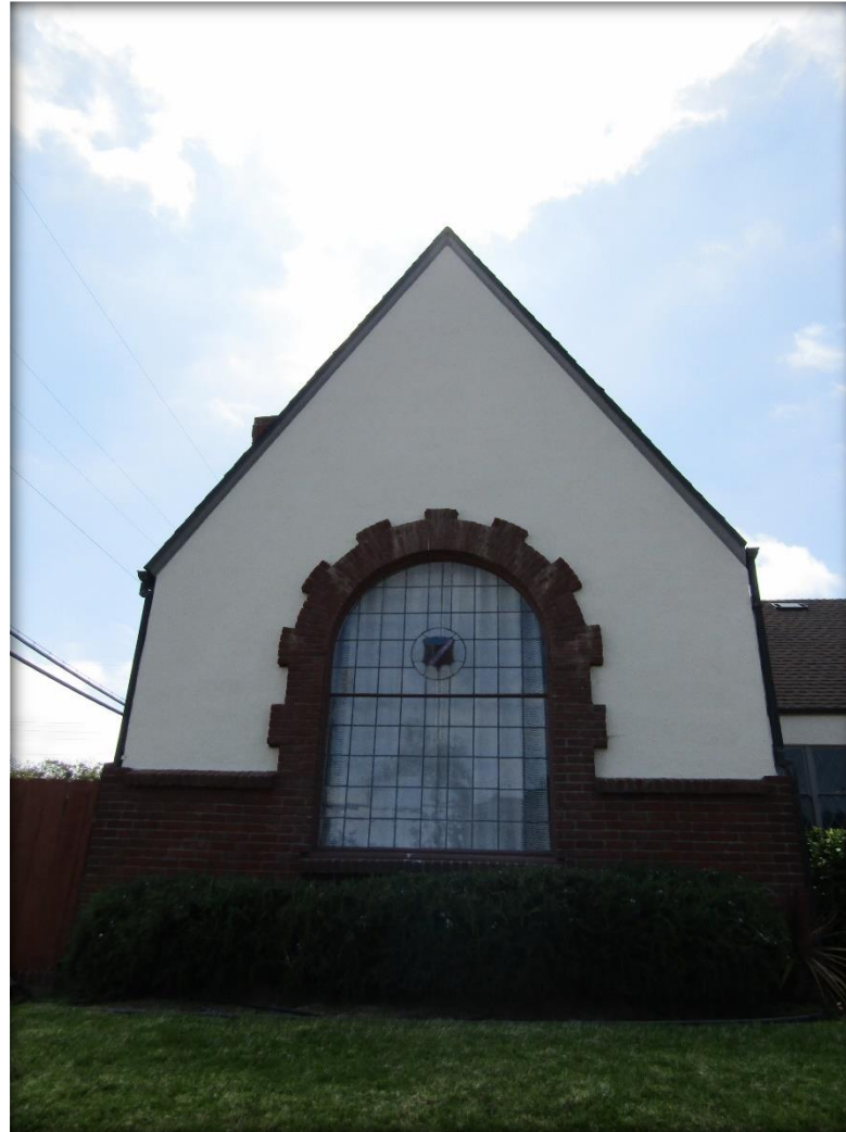
Focal Window Detail