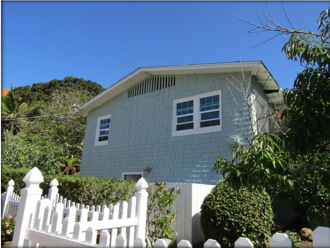
819 -819 ½ Coast Blvd. South – West Facade