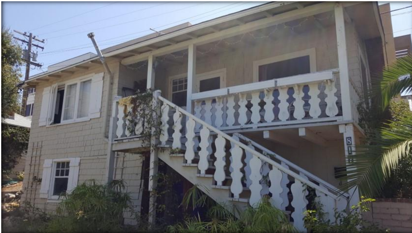
817 Coast Blvd. South – 2018