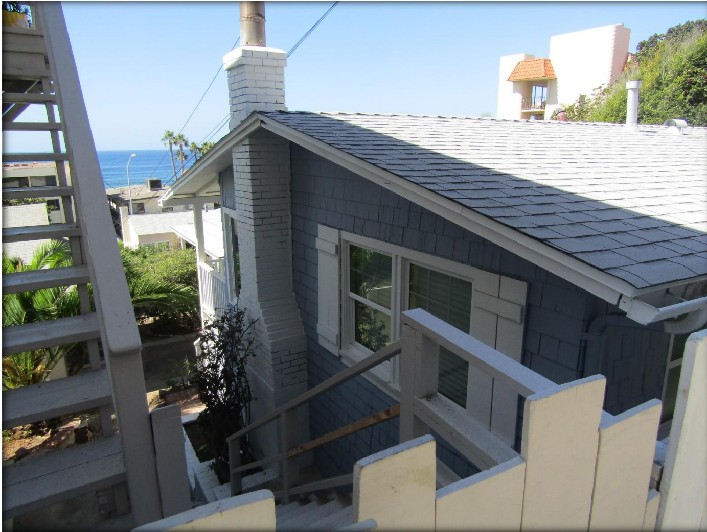
817 Coast Blvd. South – West Elevation