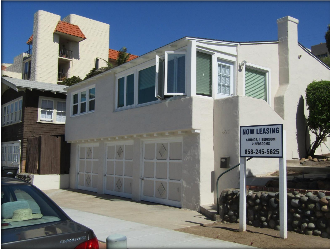
821Coast Blvd. South – West Elevation