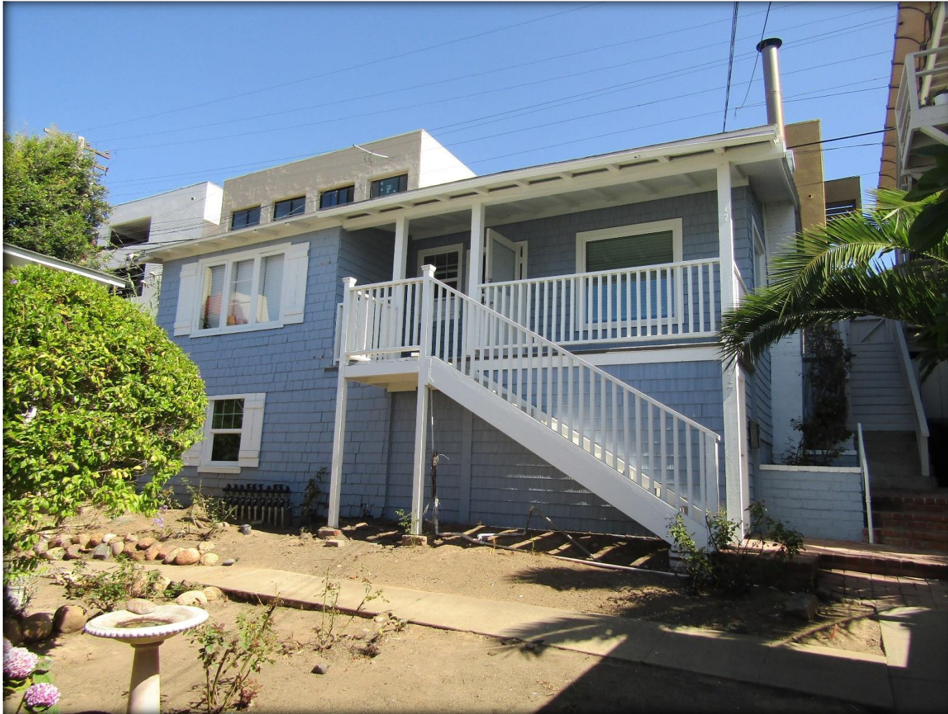
817 Coast Blvd. South – West Elevation