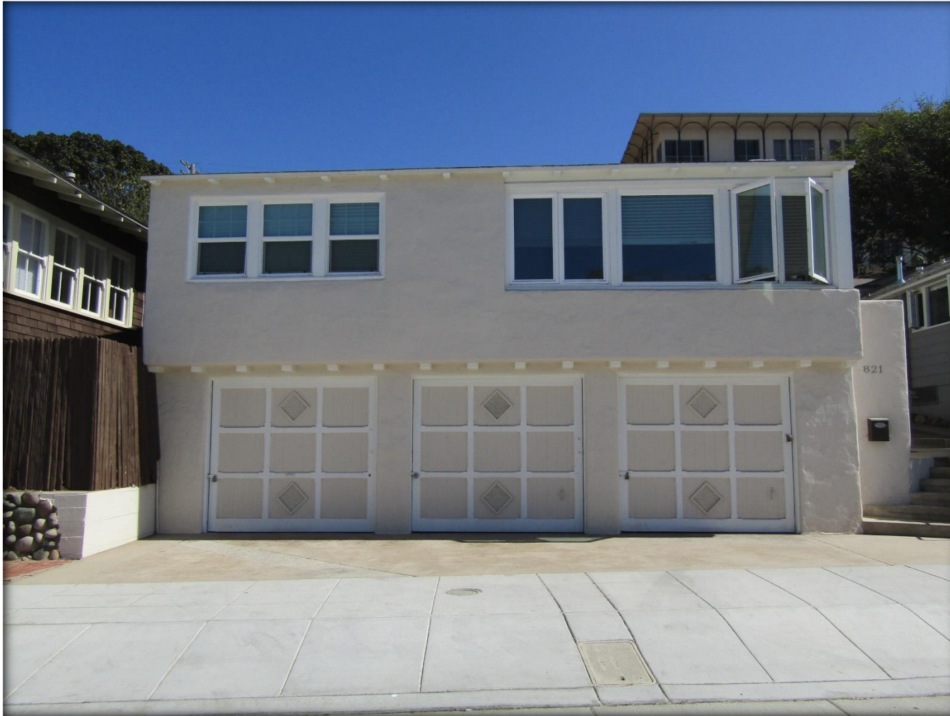
821 Coast Blvd. South – West Elevation