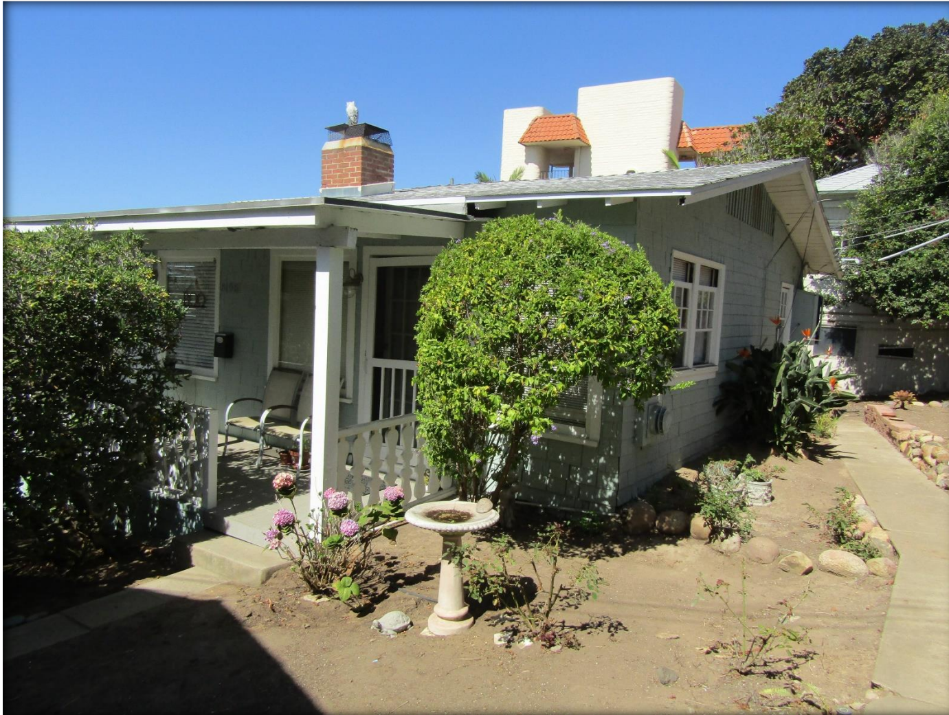
819 -819 ½ Coast Blvd. South – South East Corner