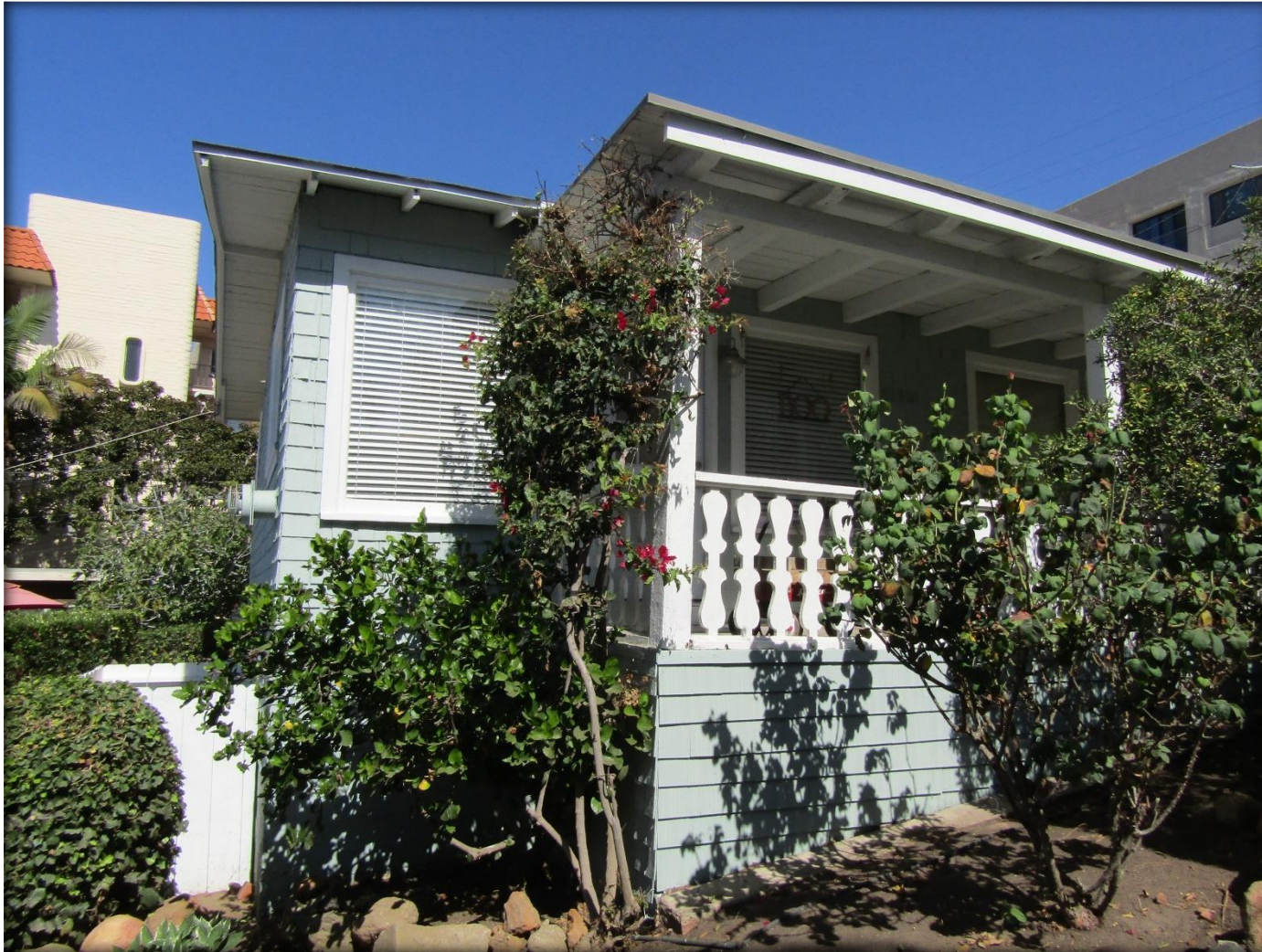
819 -819 ½ Coast Blvd. South – South Elevation