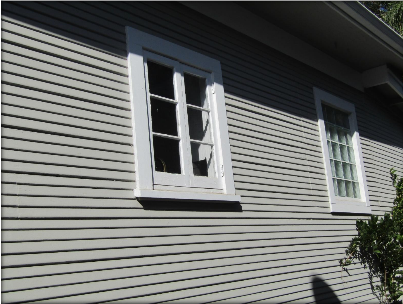
South Elevation Window Modifications