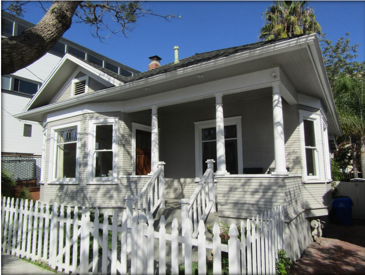
West and South Elevations