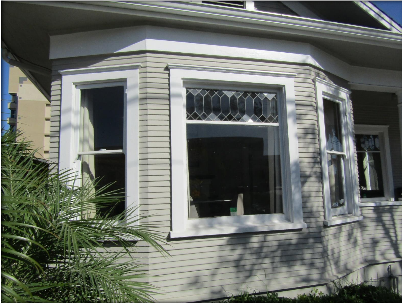
West Elevation Bay