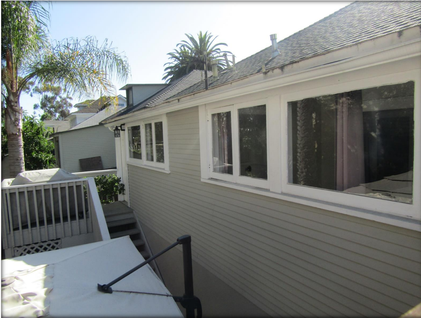
East Elevation Windows (addition)