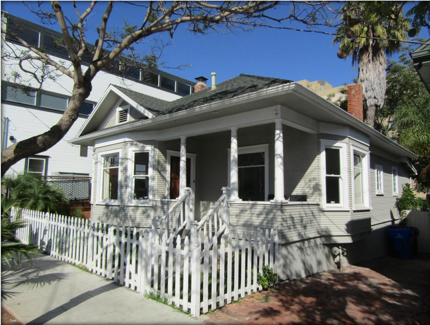
West and South Elevations