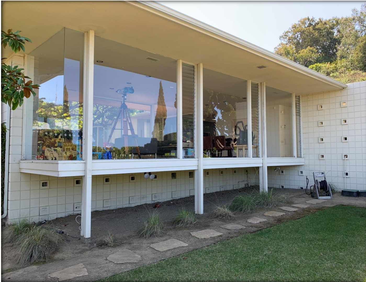
Projecting section at the eastern side of the north façade.