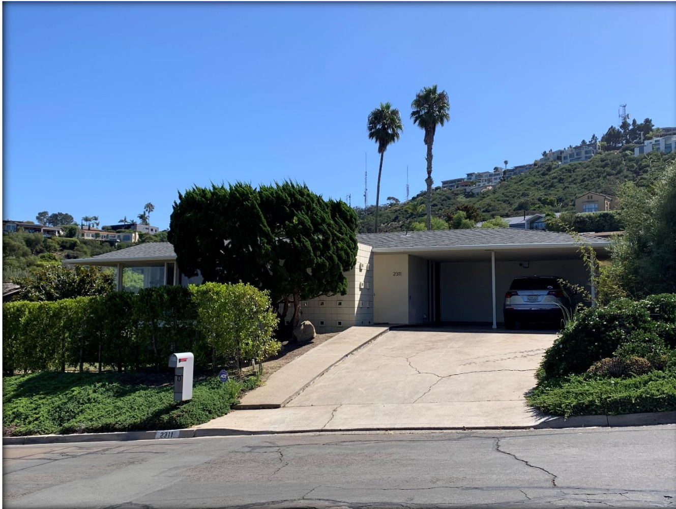
North (front) façade