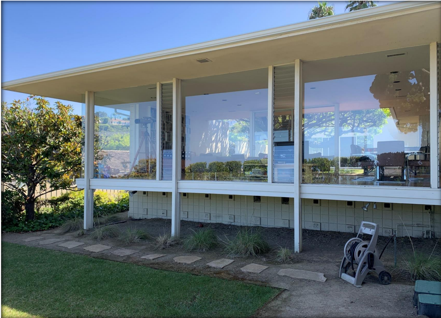
Projecting section at the eastern side of the north façade.