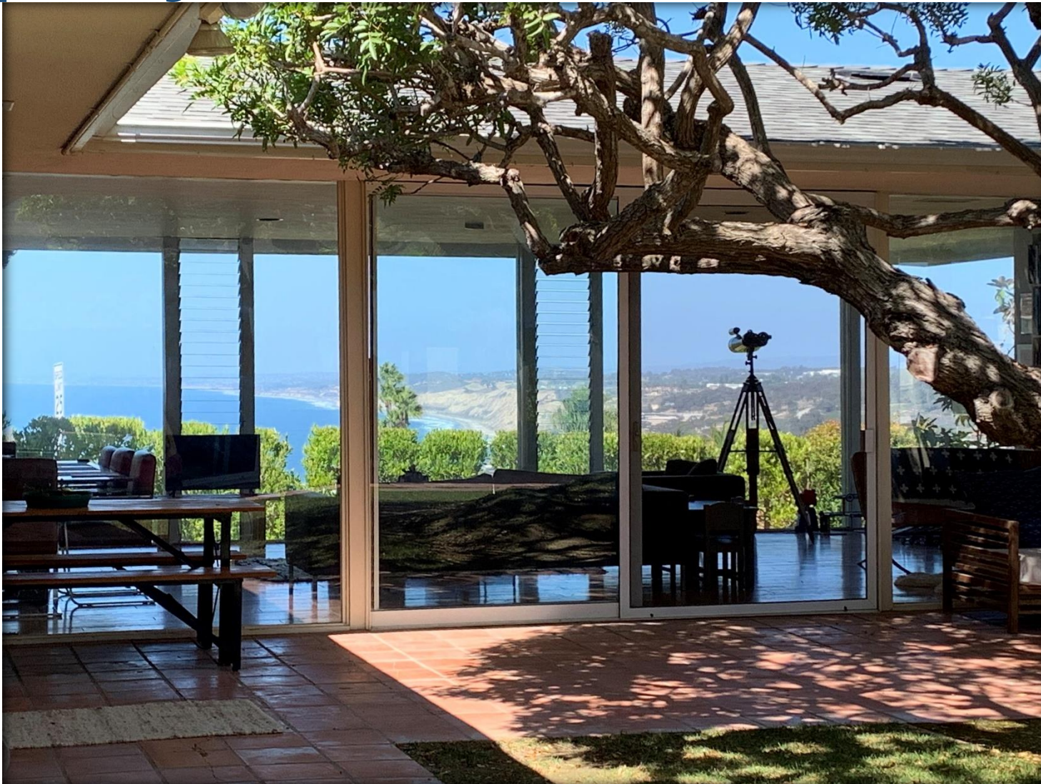
Looking north from courtyard