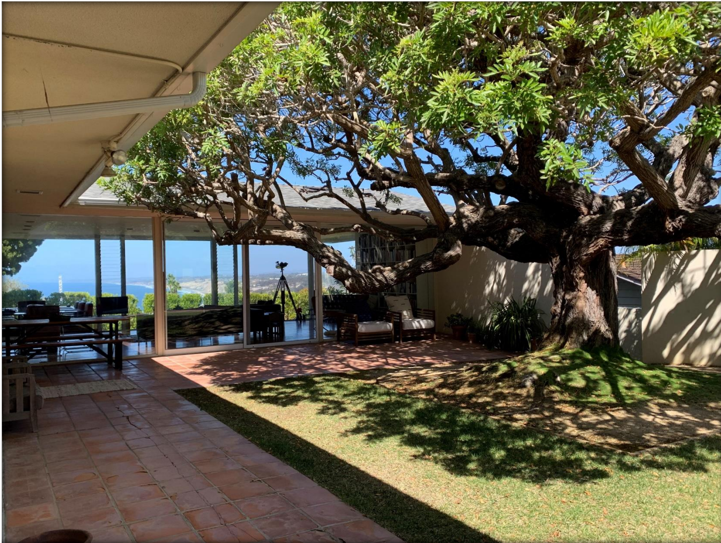
Looking north from courtyard