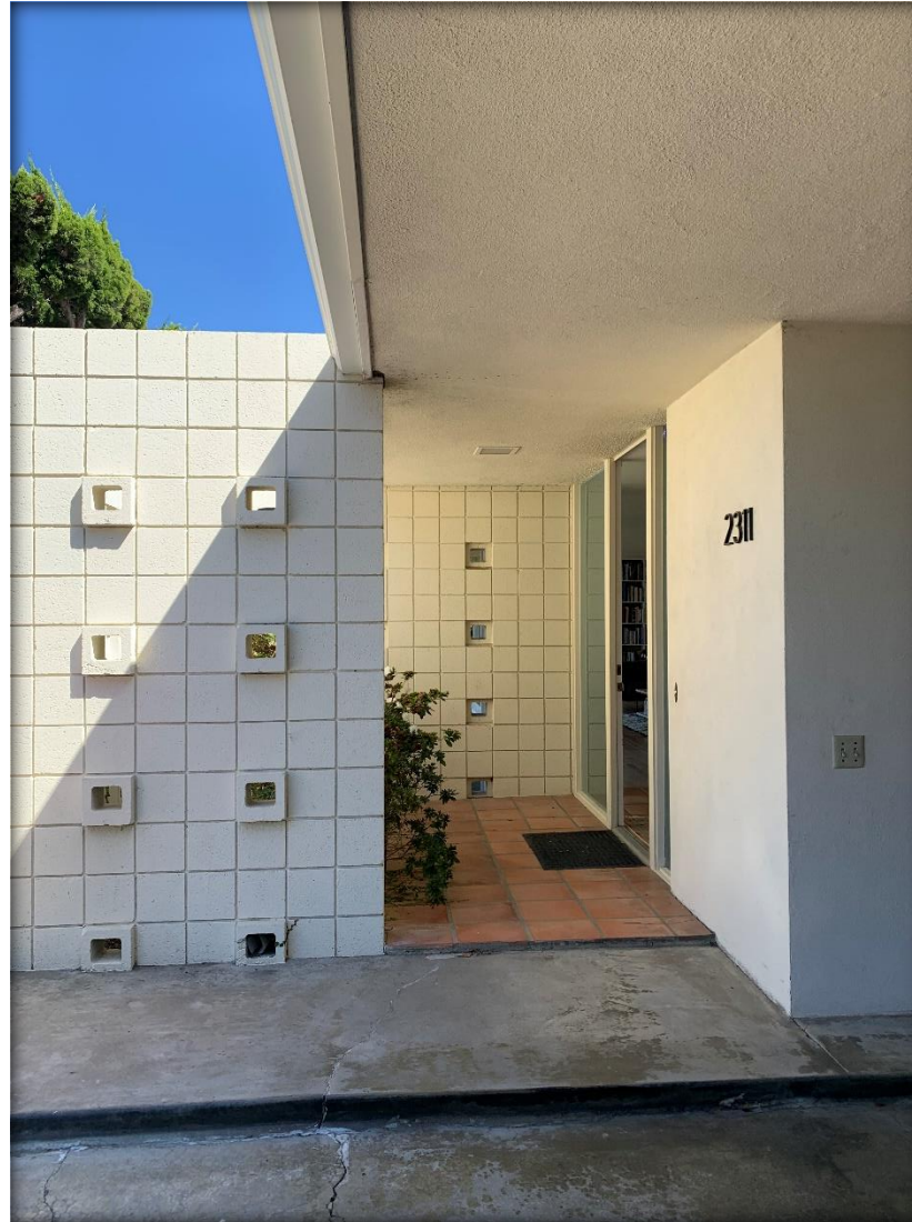
Front entry courtyard as seen from carport