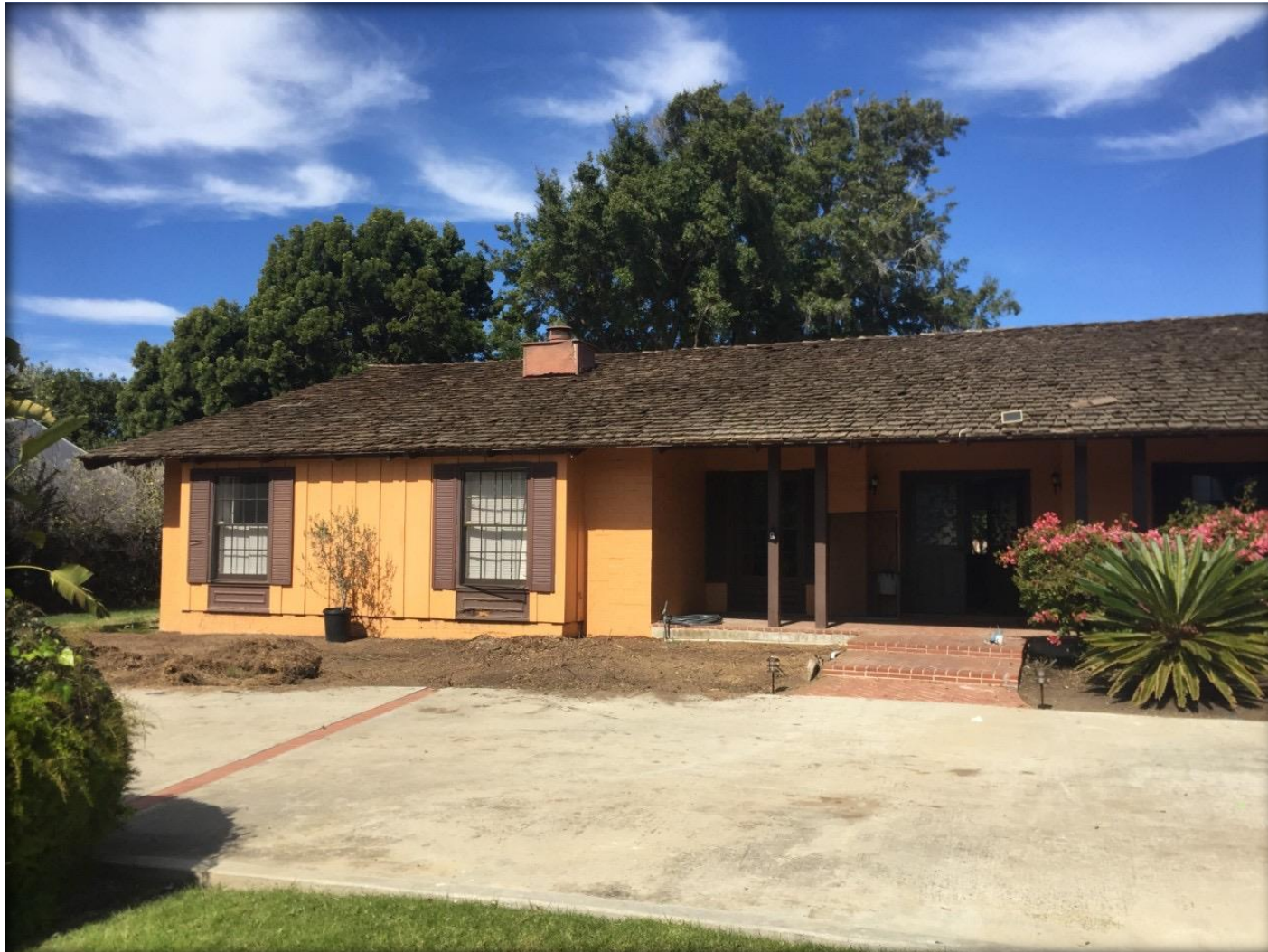
South Elevation - 2018