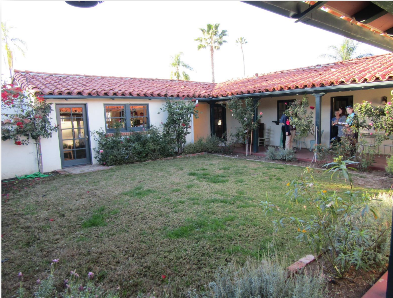
South and East Elevations of Interior Courtyard