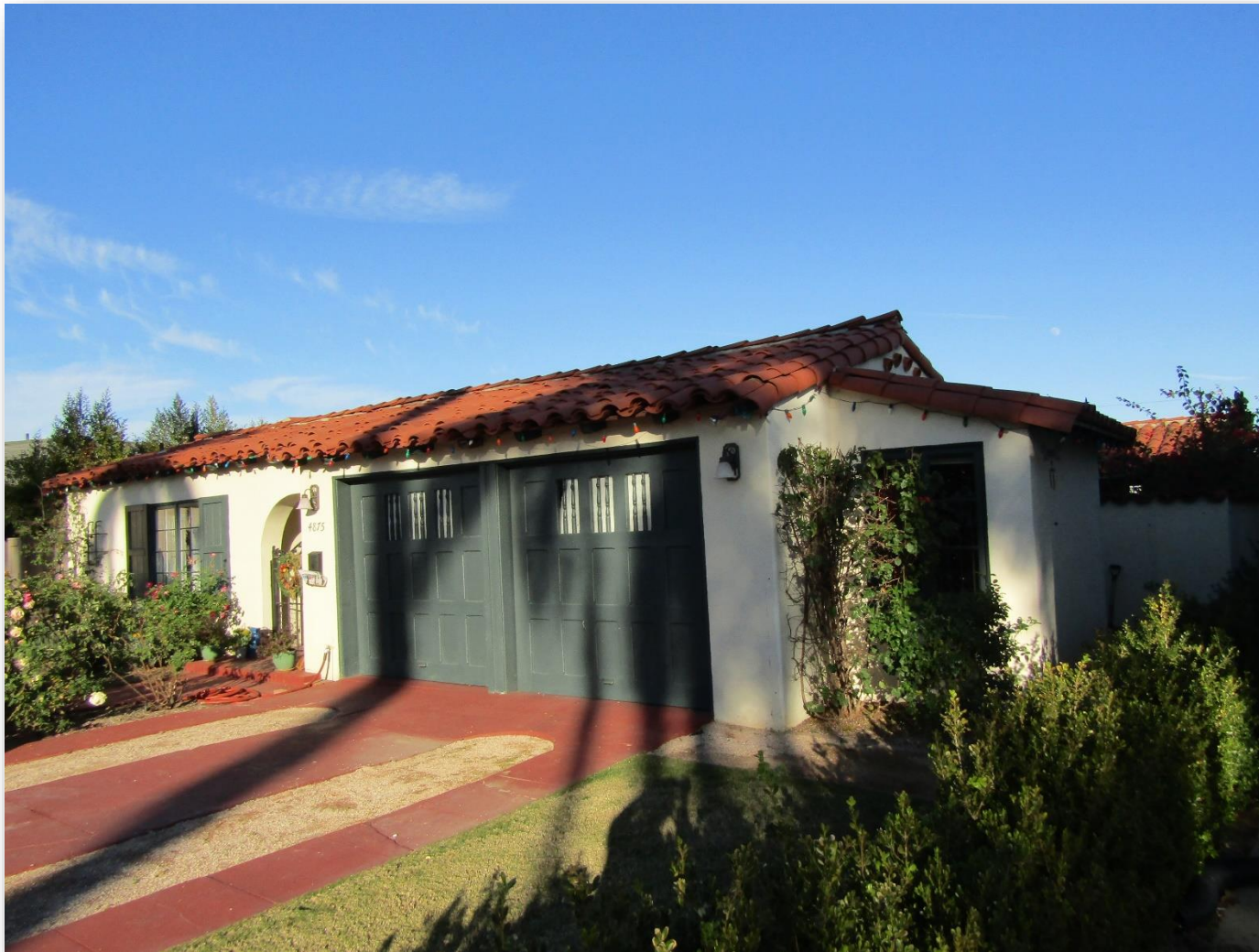
West and South Elevations