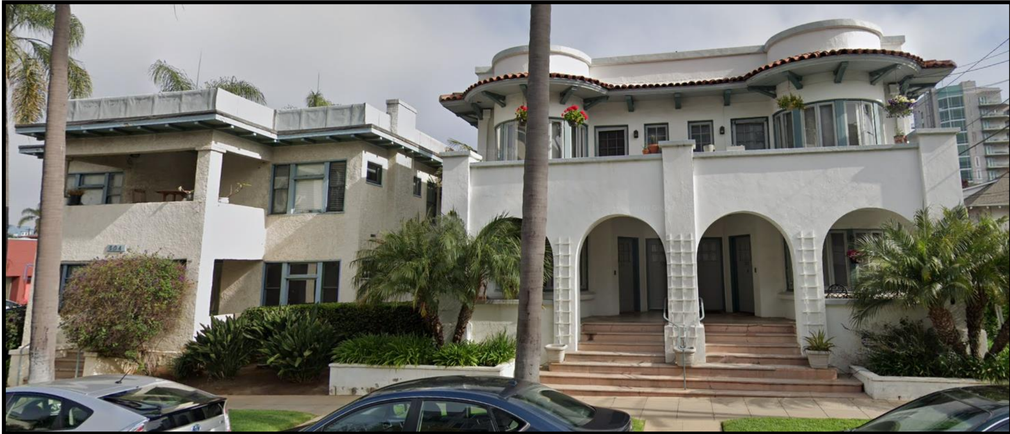
504 Thorn Street & 516-522 Thorn Street