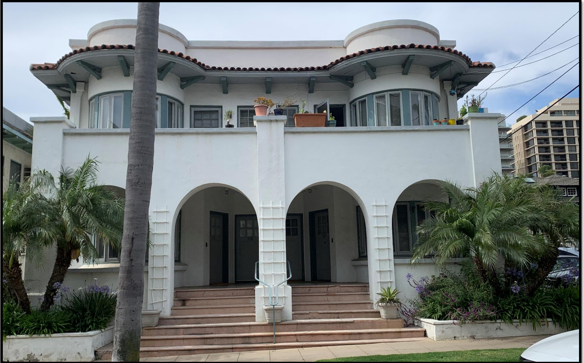
516-522 Thorn Street