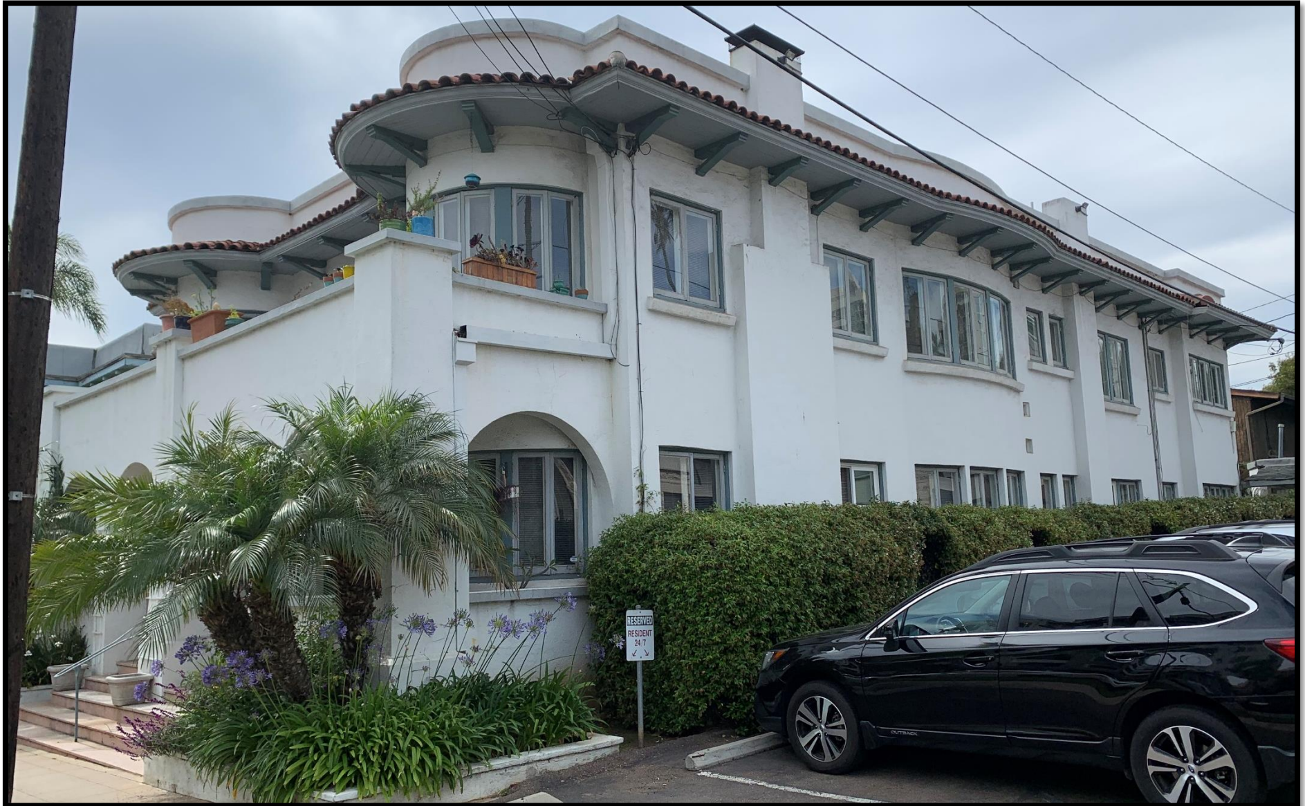
516-522 Thorn Street