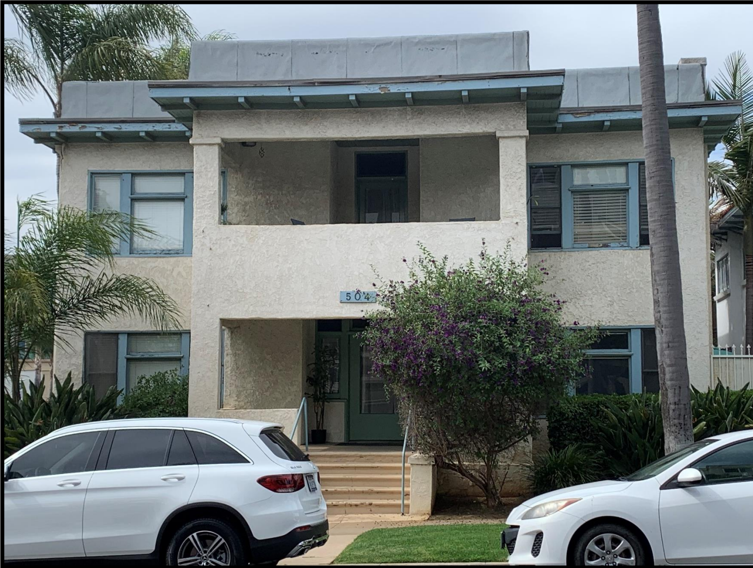
504 Thorn Street