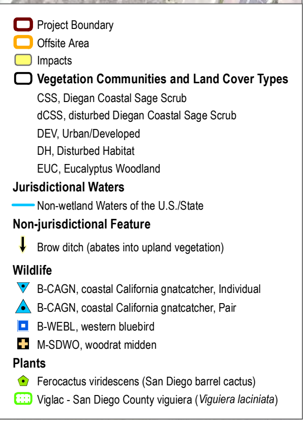
FIGURE 4 Impacts to Biological Resources

Biological Technical Report for Paseo Montril Development Project