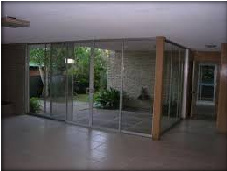
Courtyard Circa 2016