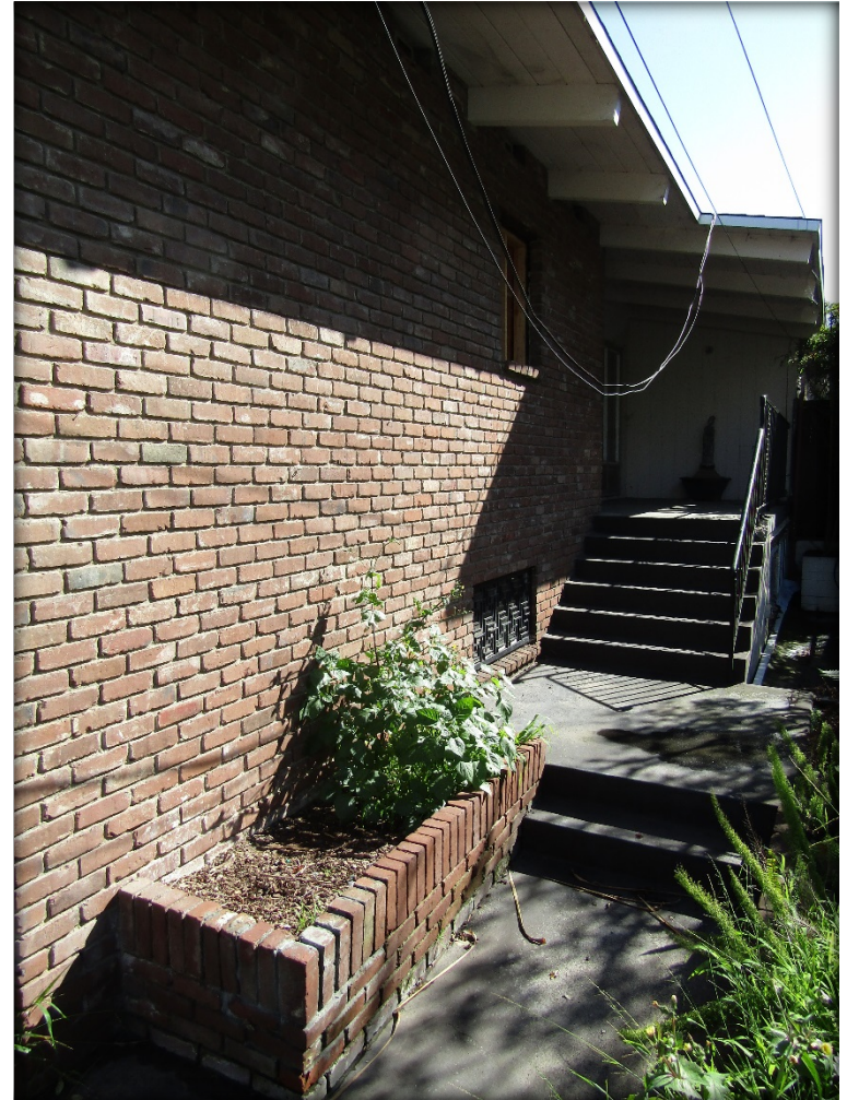
West Façade 2017