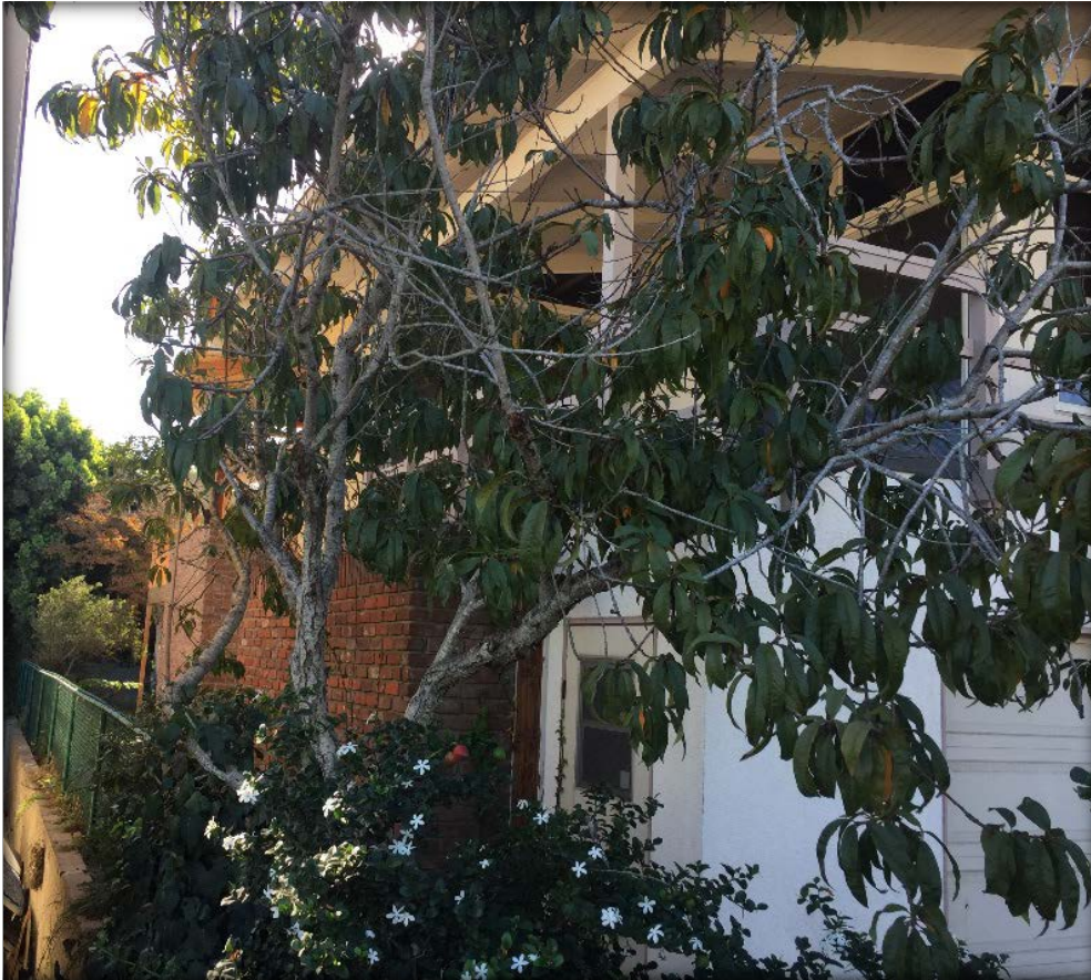
East Façade Circa 2016