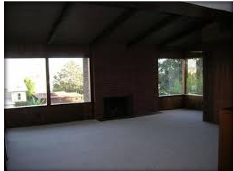
Windows from Interior Circa 2016