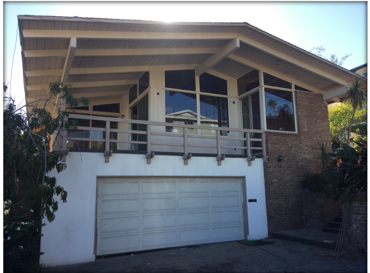
North Façade Circa 2016