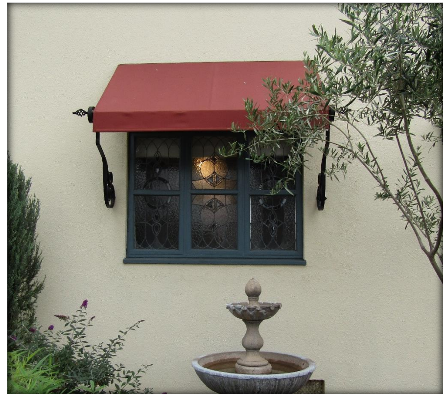
Window Details, West Facade