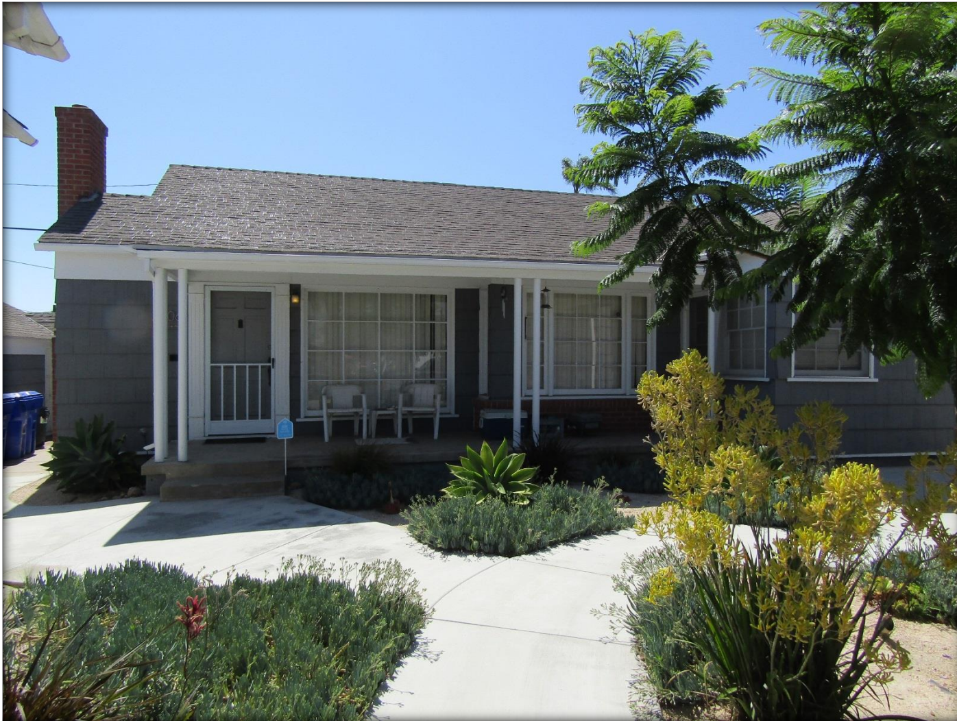
Rear dwelling unit