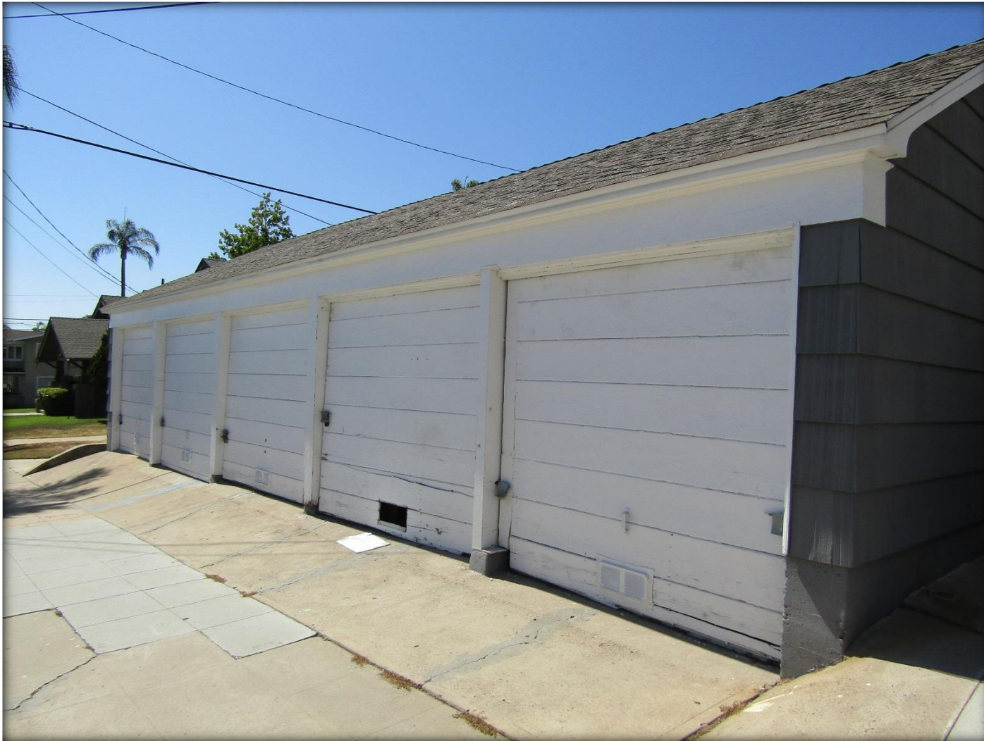
Garages – south elevation