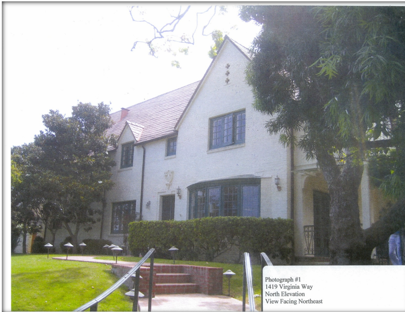
Front Façade 2013