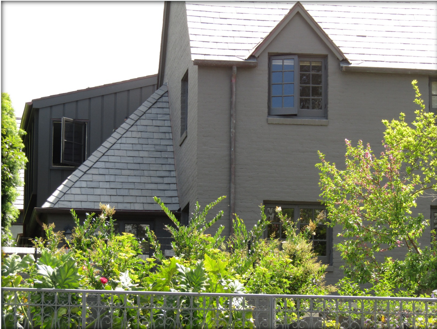
Wall Dormer Detail