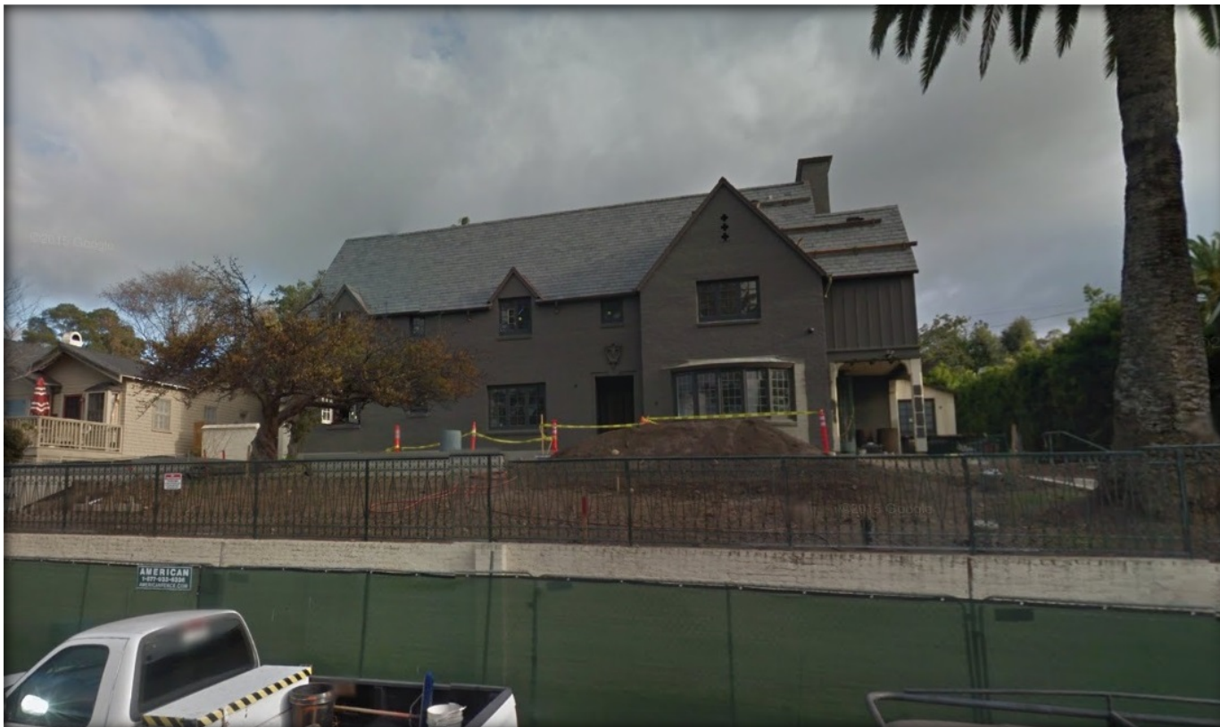
Front Façade 2015, During Remodel