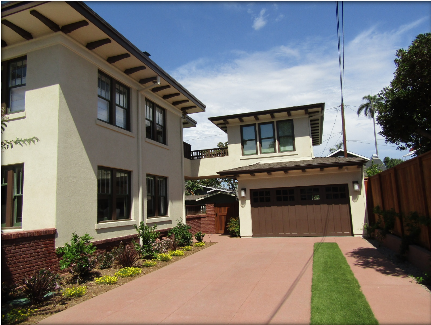
New Garage and Game Room Addition