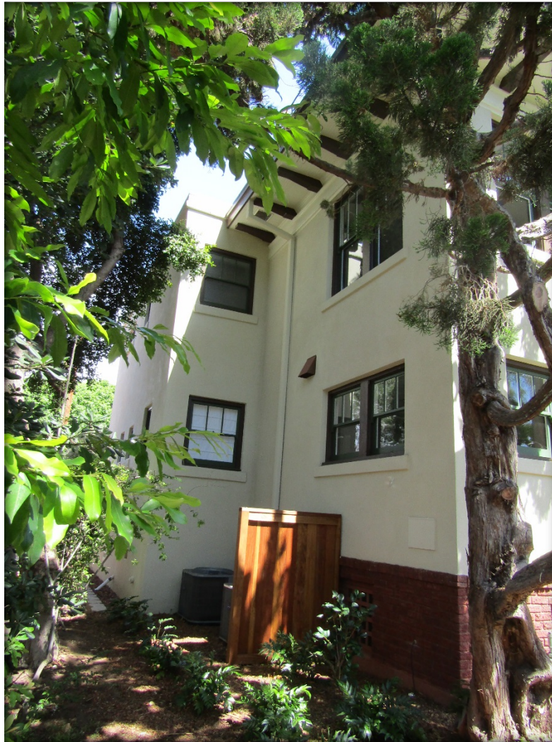
Flat-roofed Addition at North Side