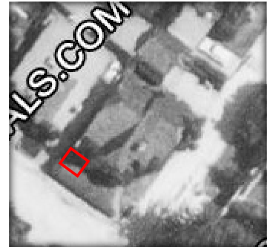
1972 Aerial Photo