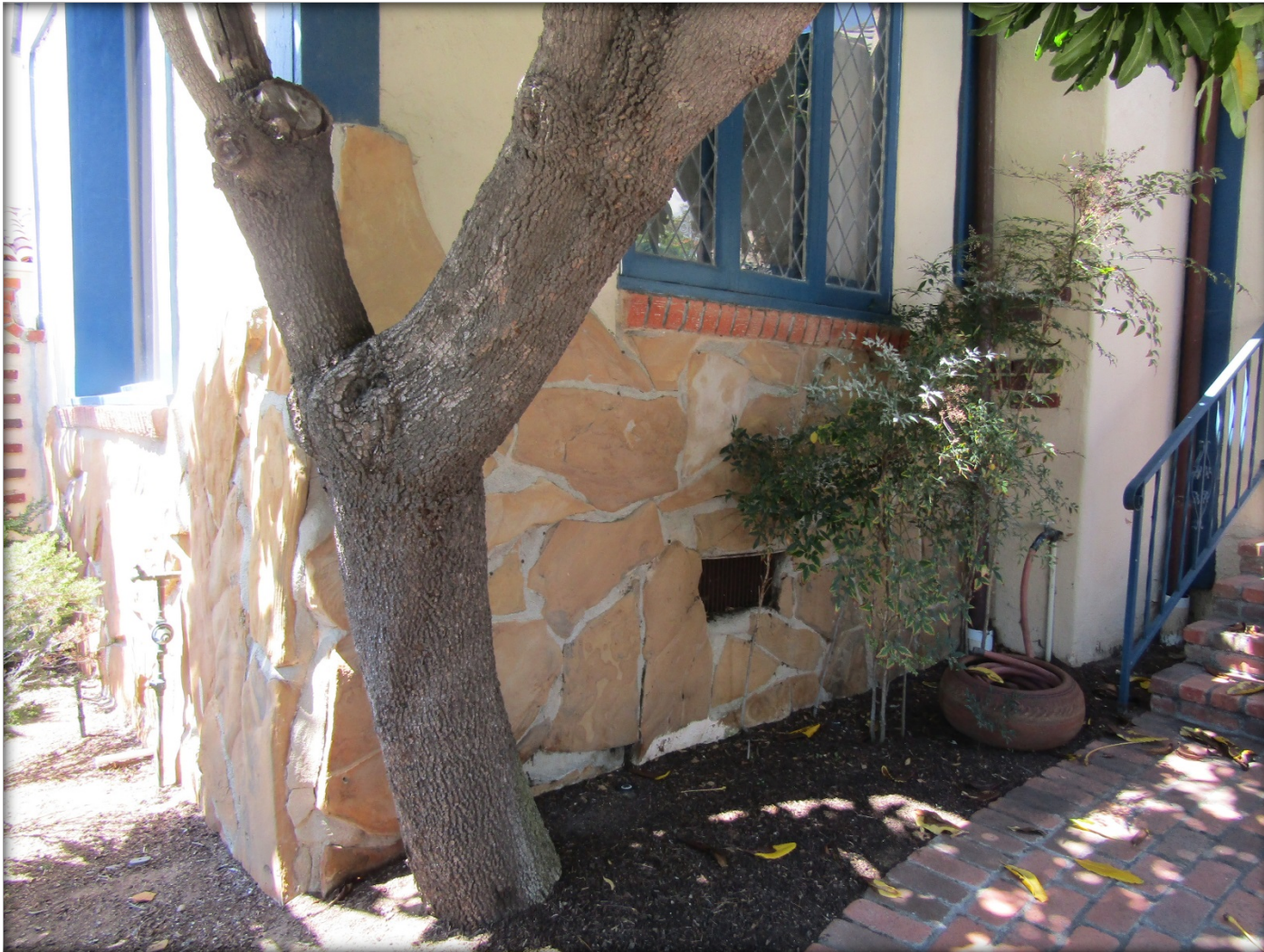
Flagstone Veneer Detail