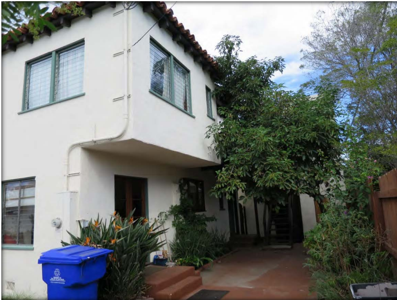
East and South elevation, October 2015, photo by IS Architecture