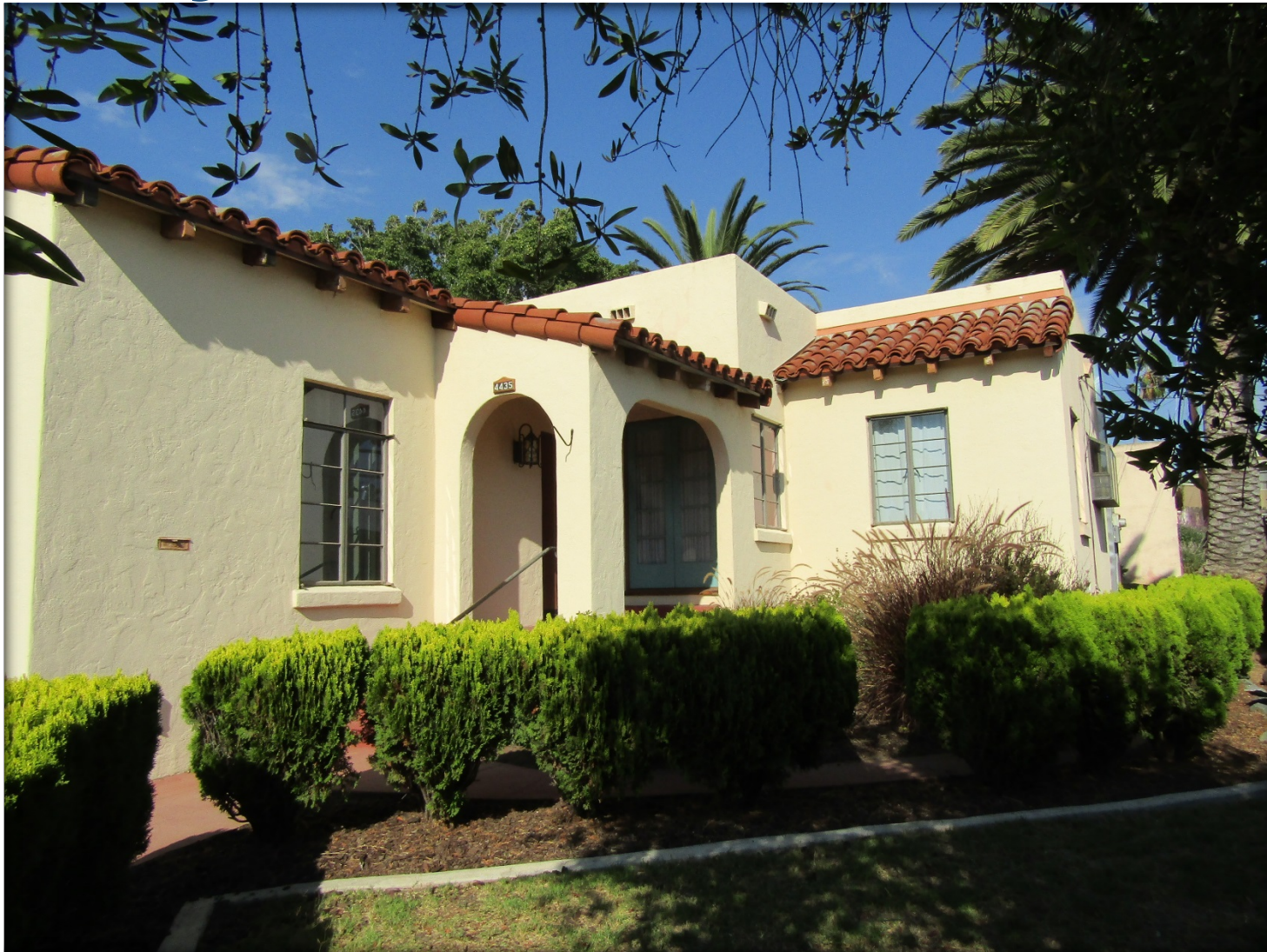
Arched entry porch