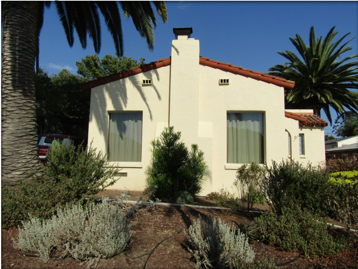
Front recessed focal windows