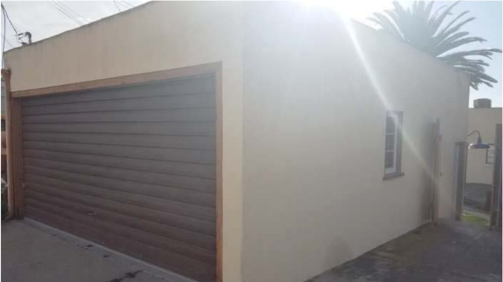
Detached Garage at rear alley