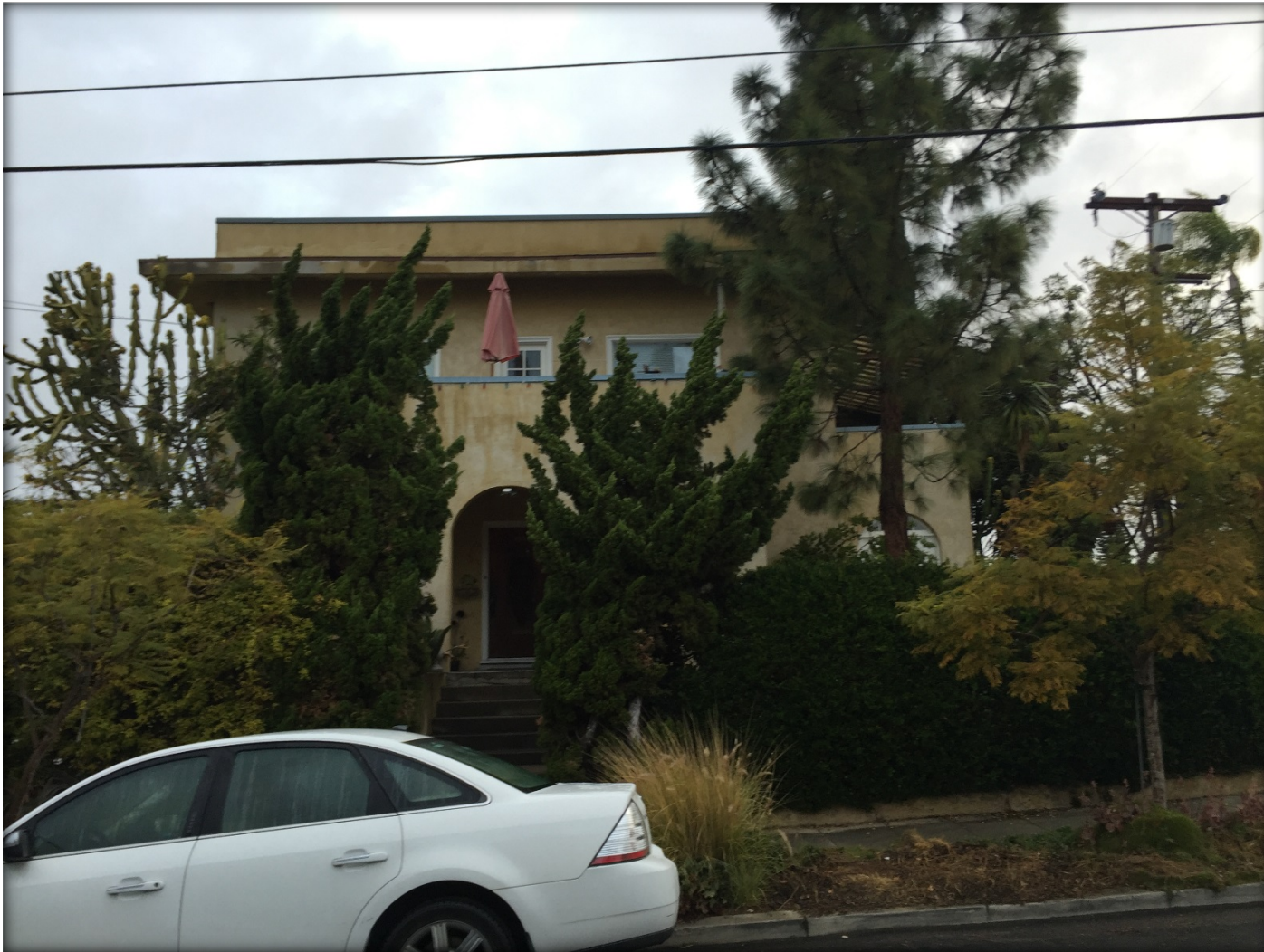
West Montecito Street Façade, January 2016