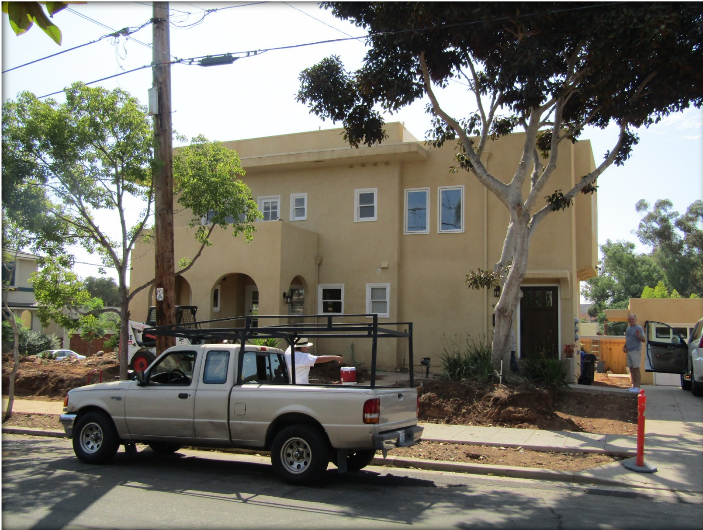
Stephens Street Façade