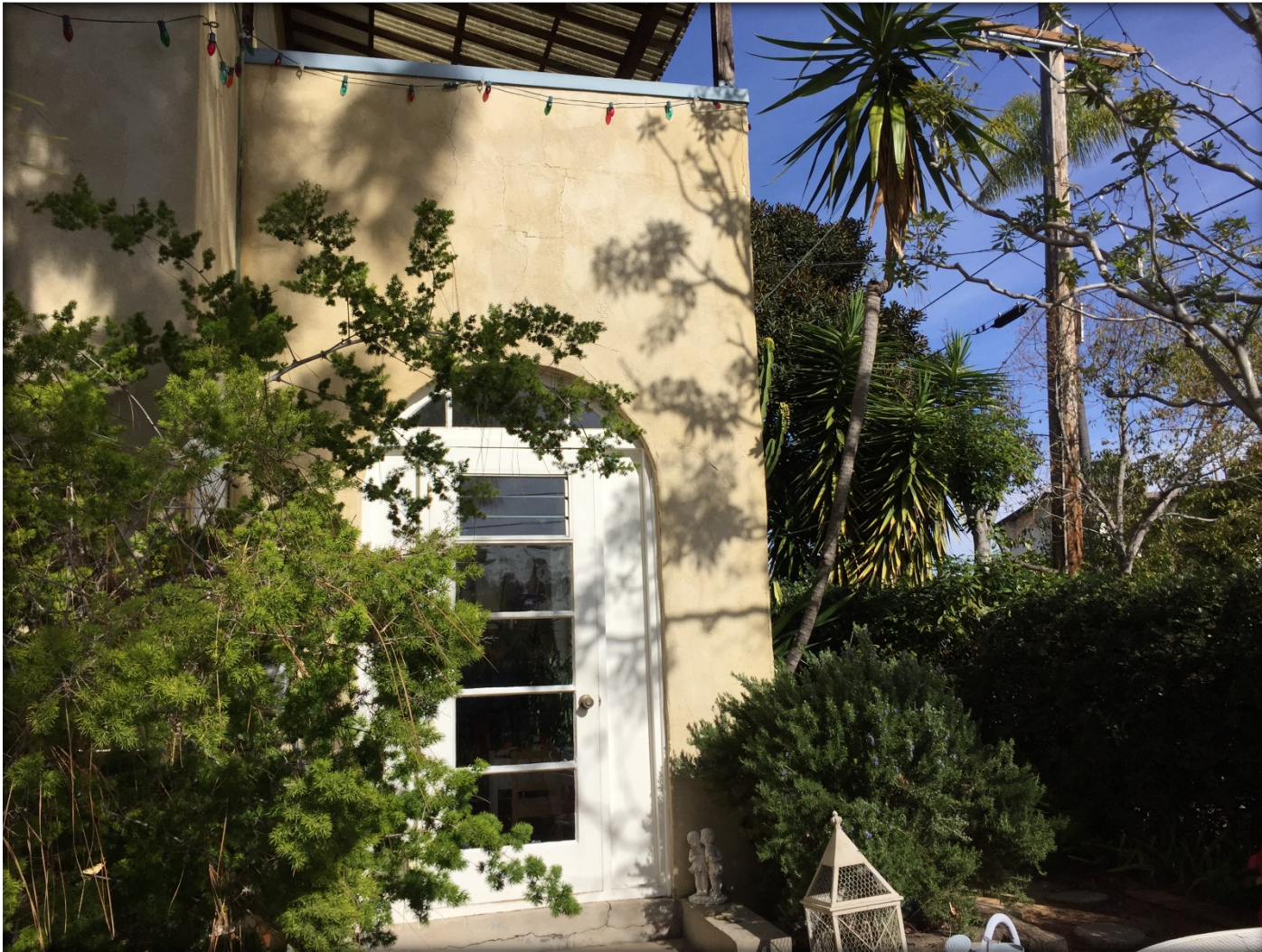
Side Porch, January 2016