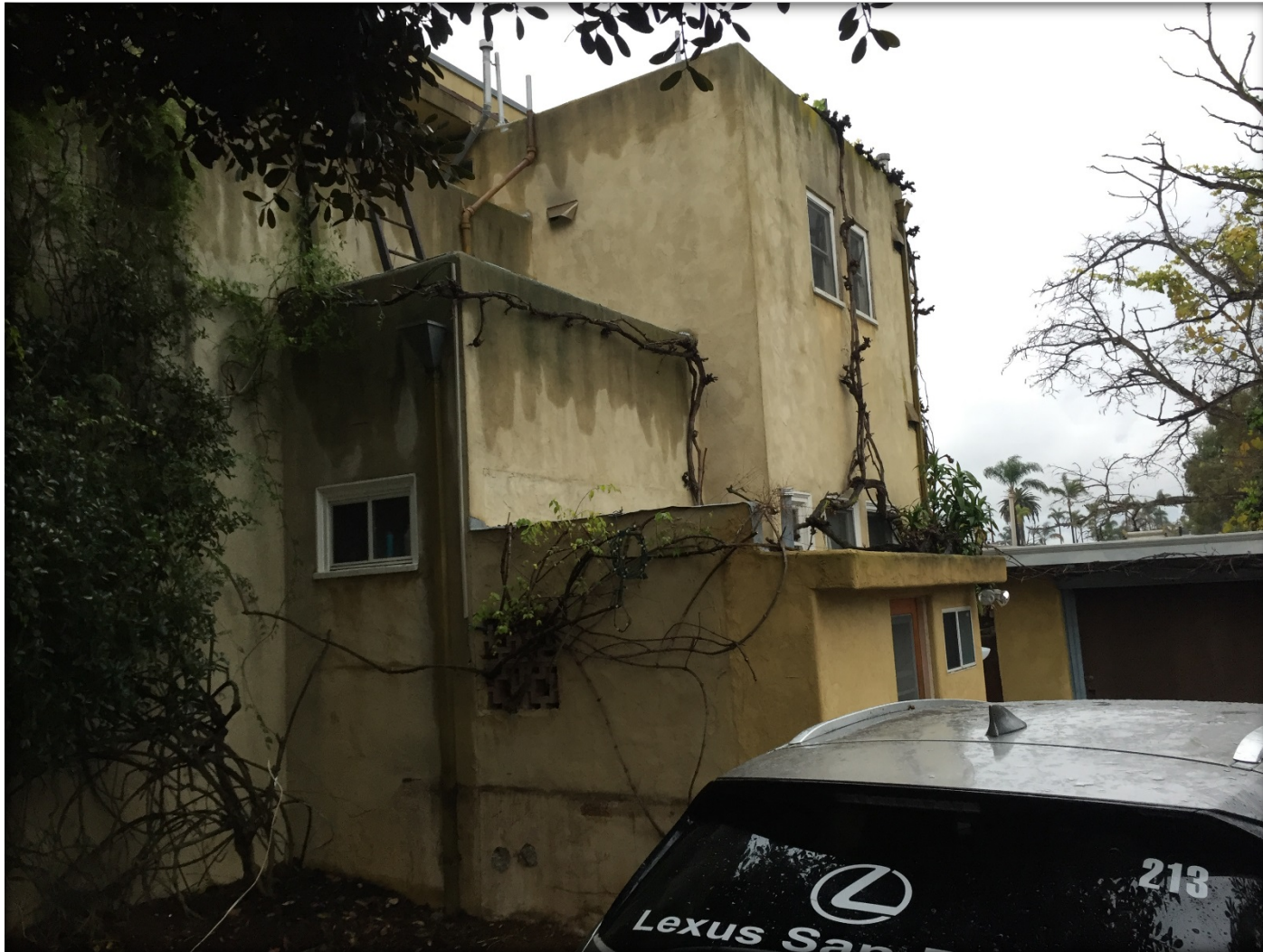
Rear Additions, January 2016