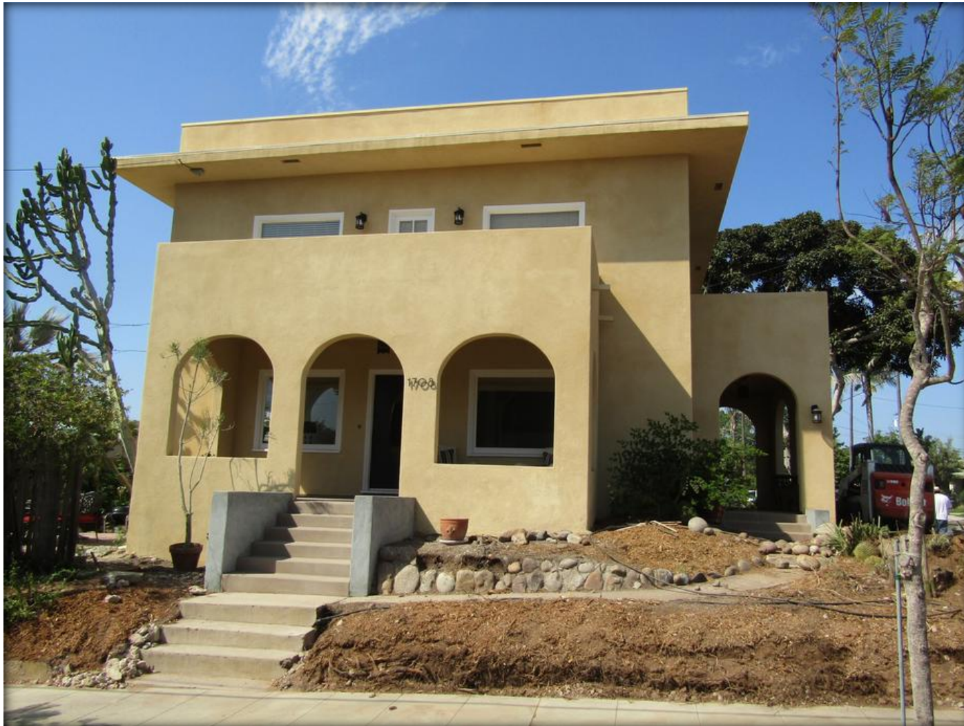
West Montecito Façade