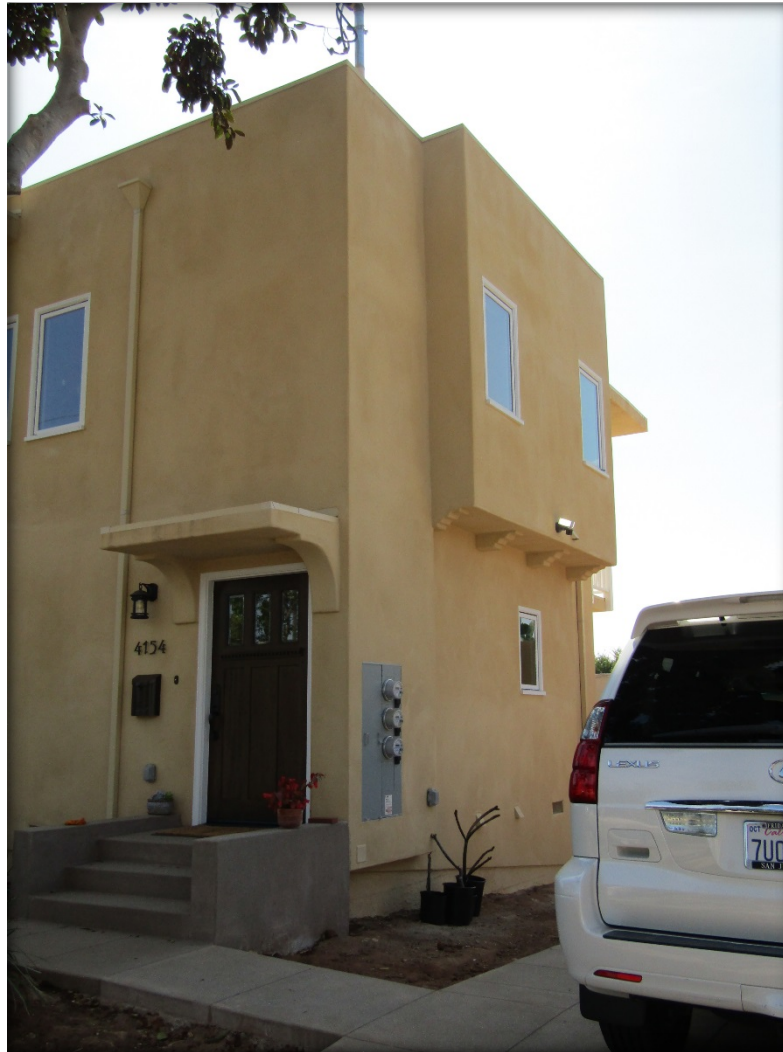
New Rear Addition