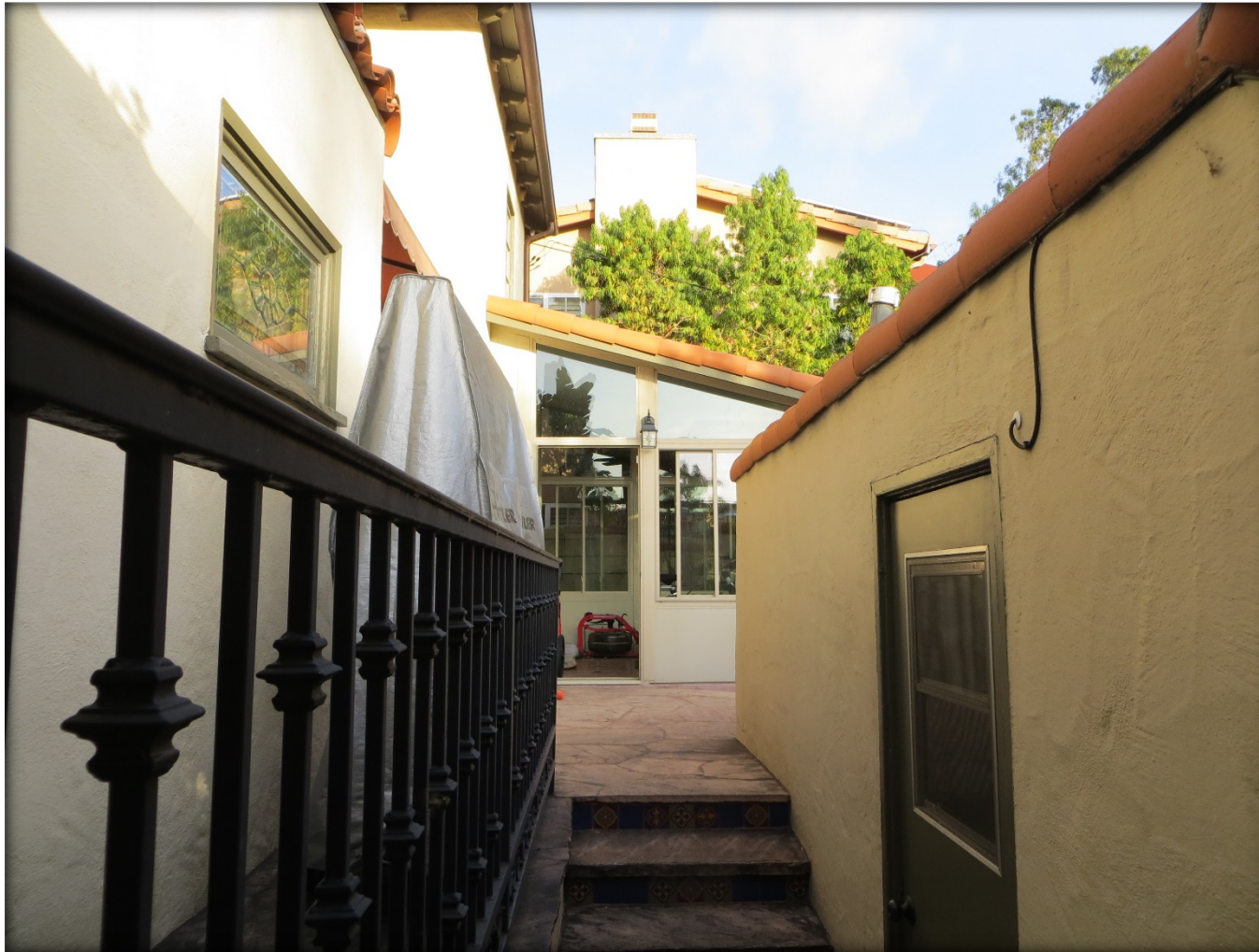
Patio enclosure at rear