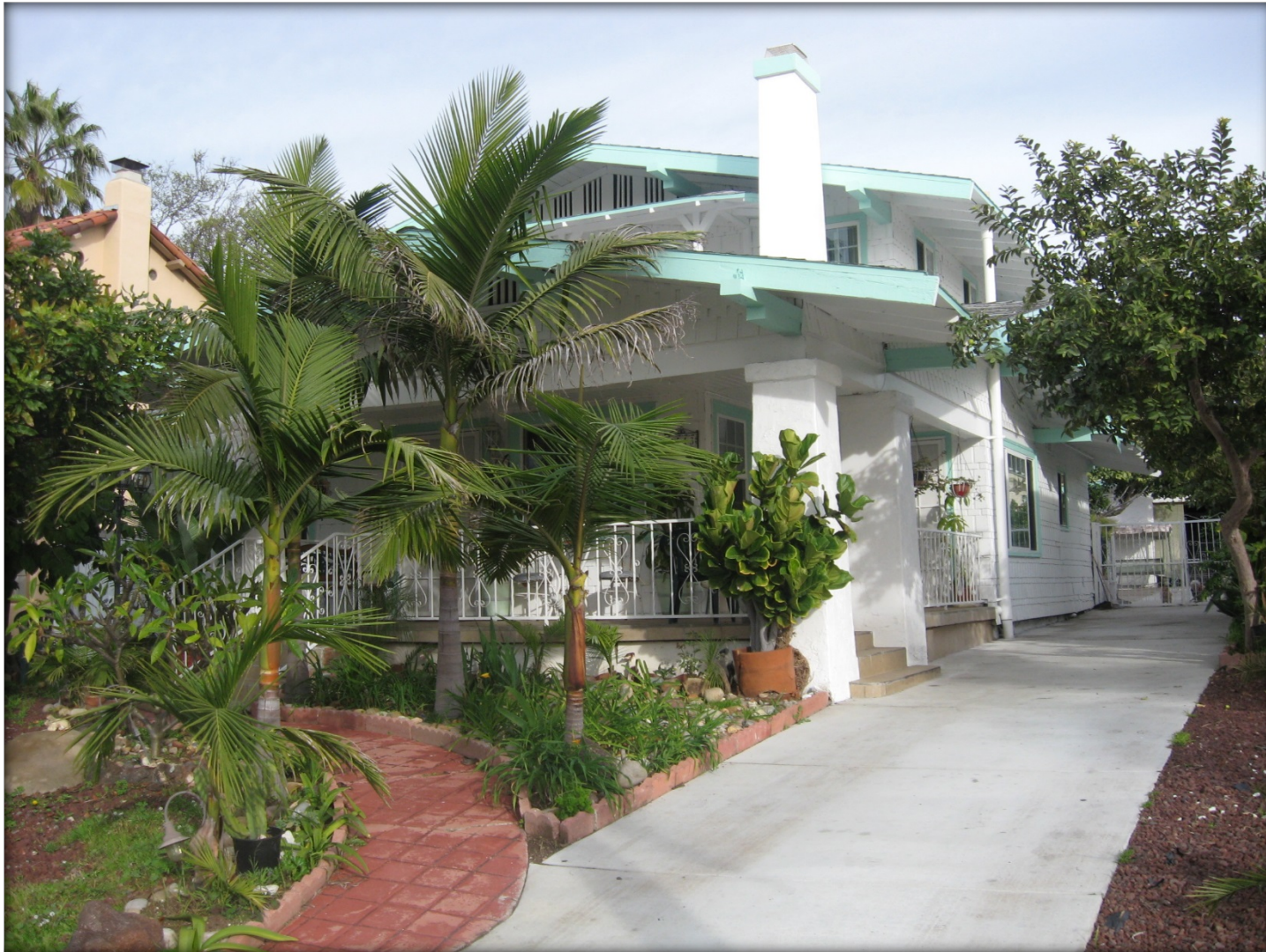
Southwest Corner, 2011