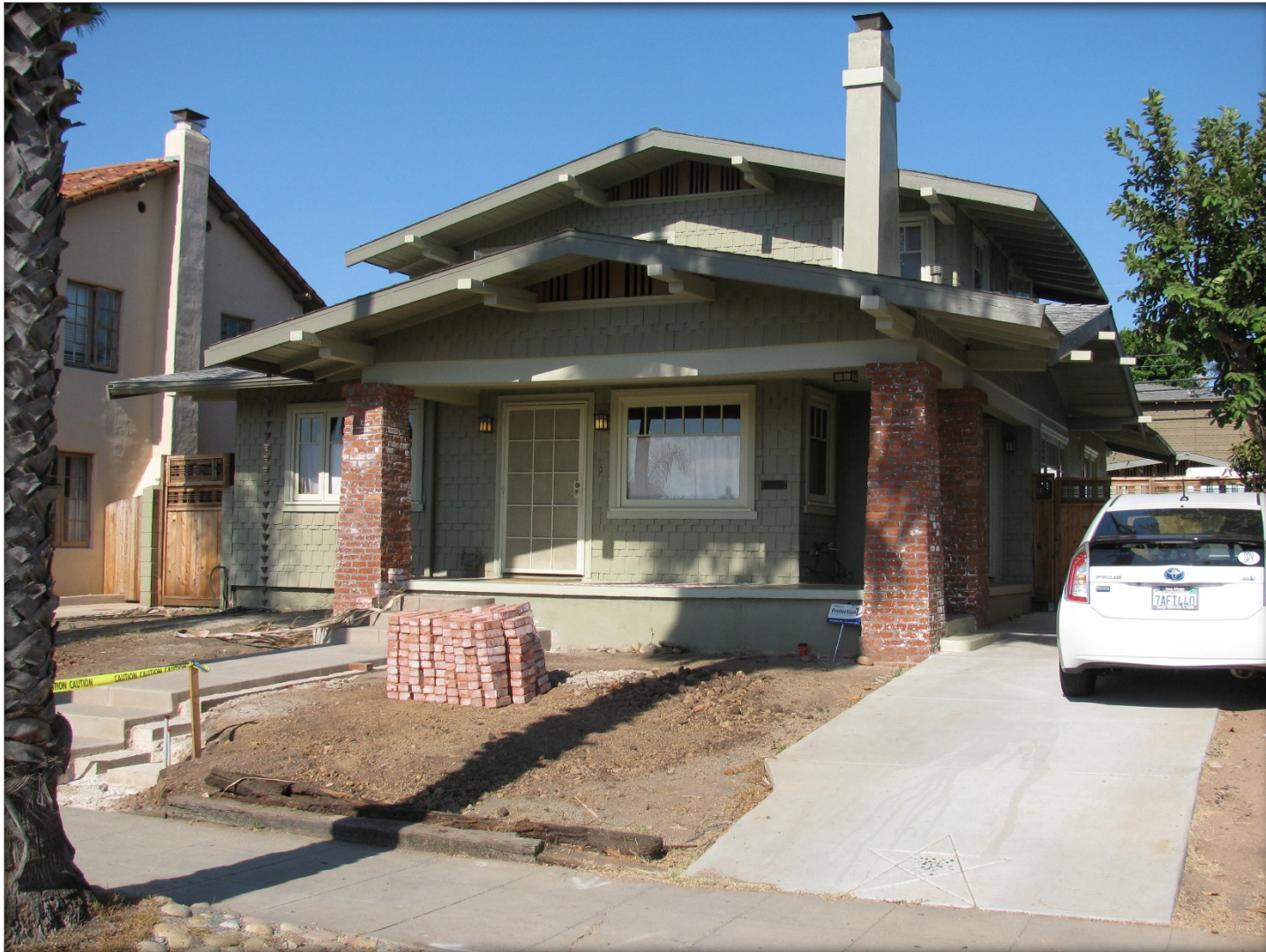
Street Façade, 2016