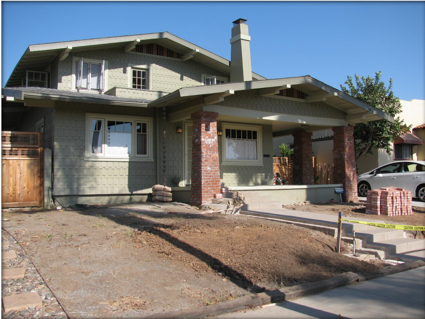
Street Façade, 2016