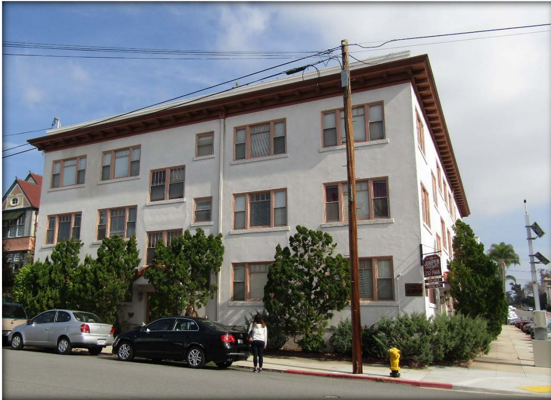
West Façade (2 nd Avenue)