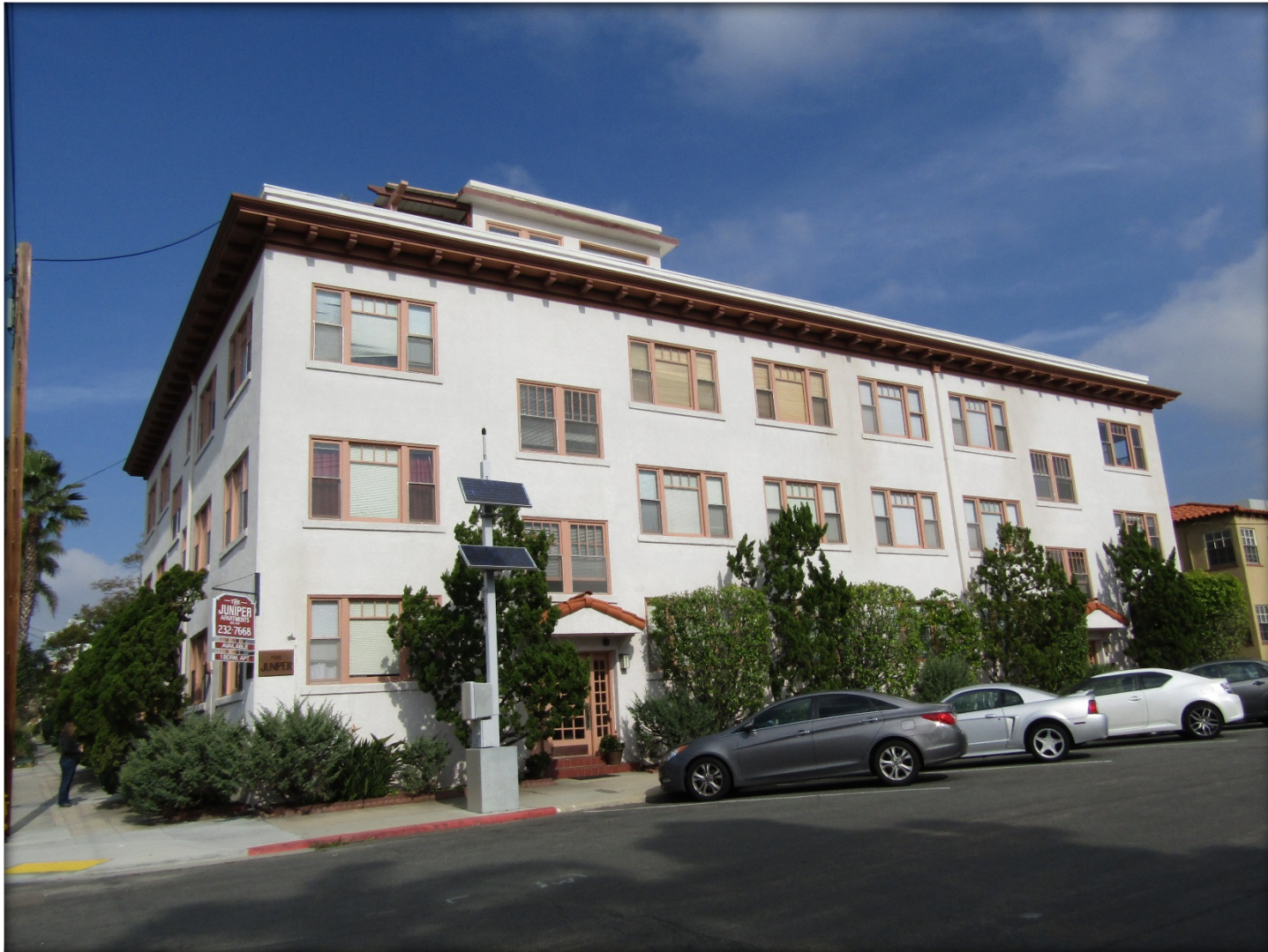
South Façade (Juniper Street)