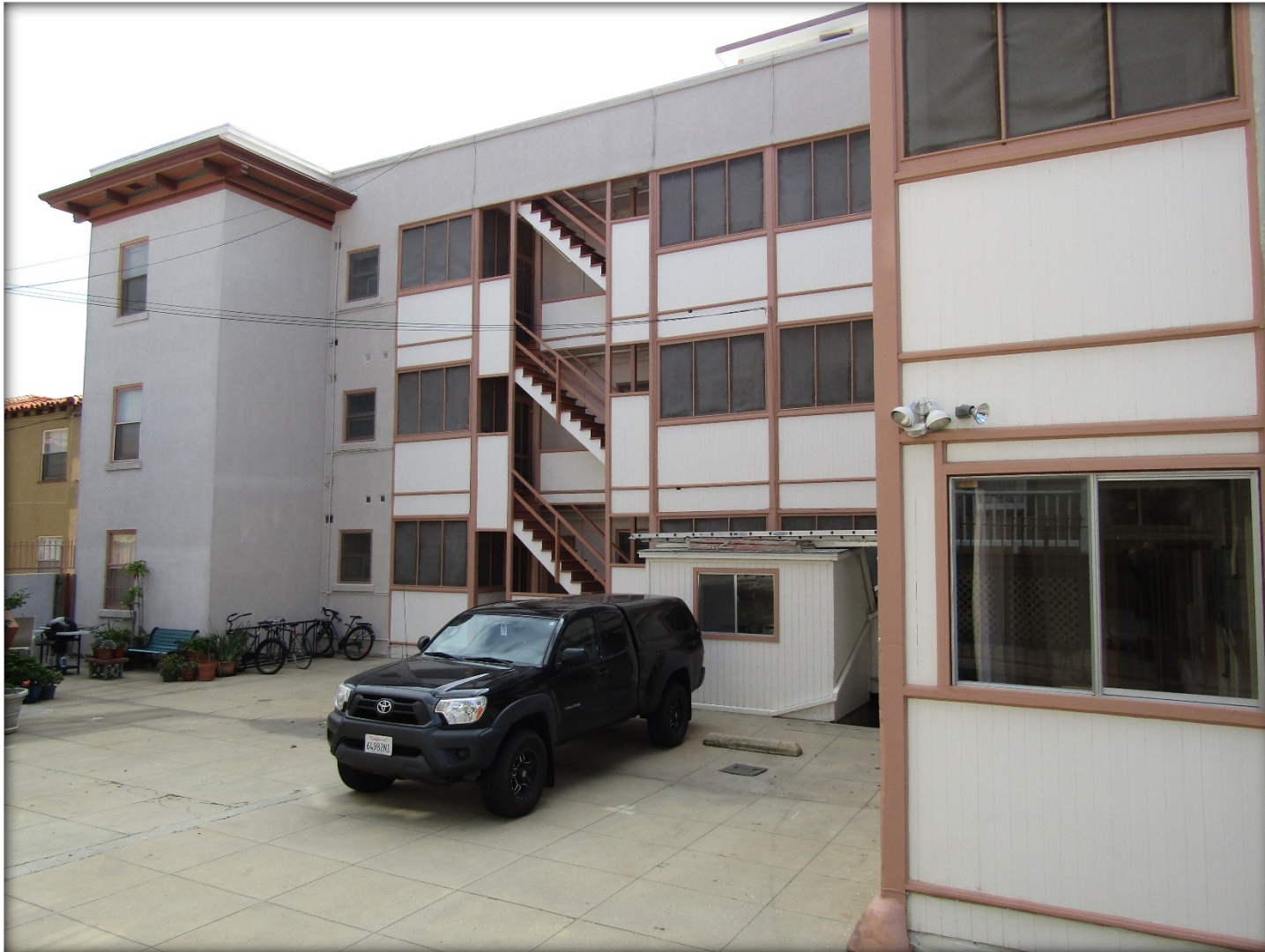
North Façade (Rear)