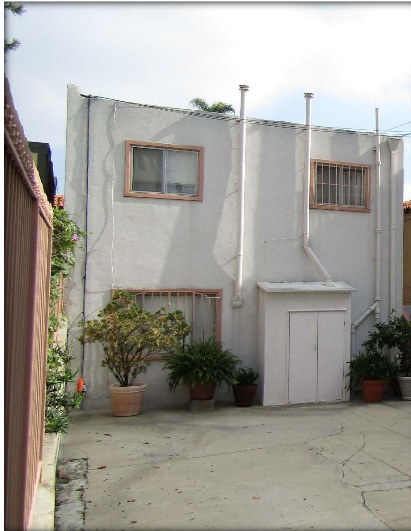
Excluded from designation