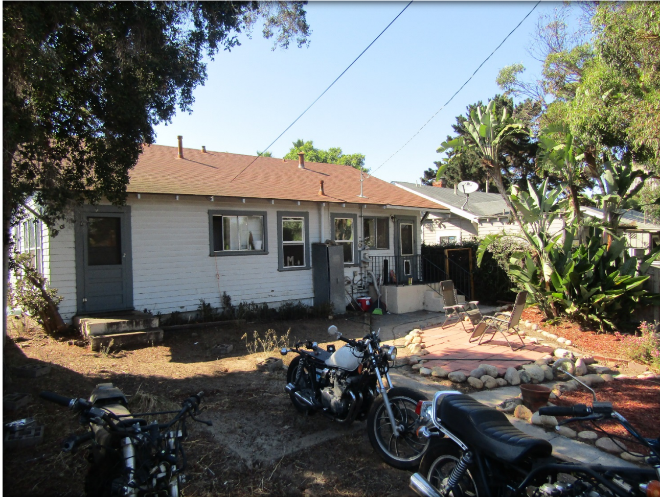
View northwest, toward east elevation, taken September 26, 2017