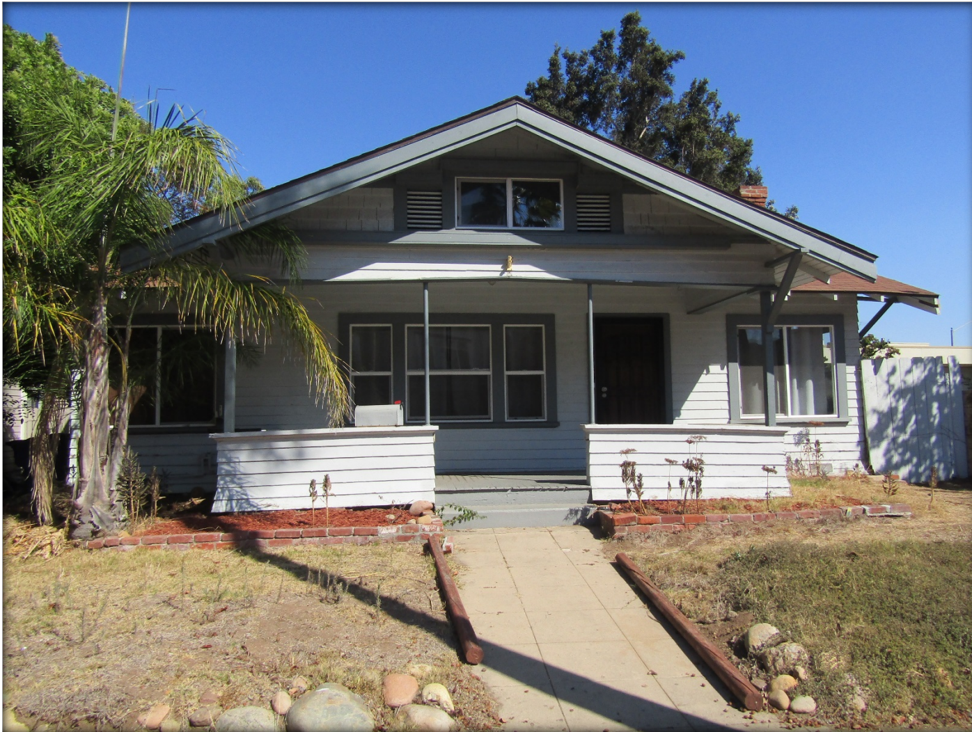
View east, taken September 26, 2017