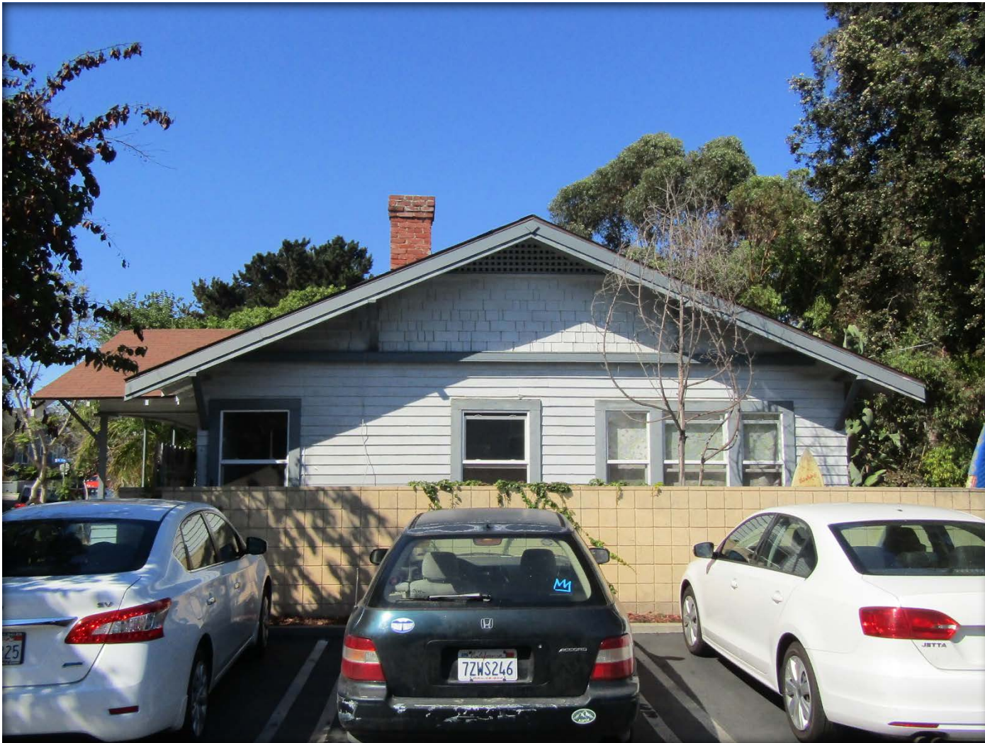
View north, taken September 26, 2017