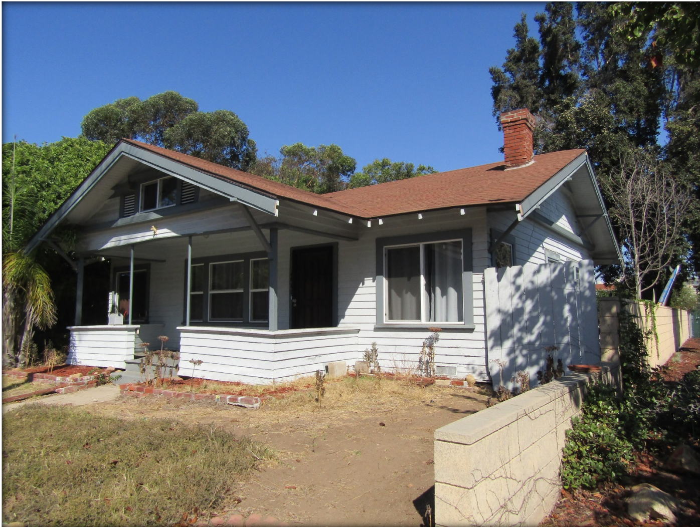
View northeast, taken September 26, 2017