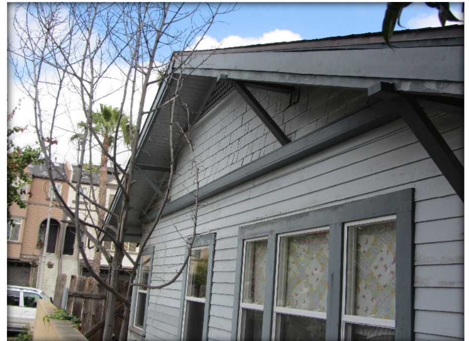
View west-northwest, toward south elevation, taken June 11, 2017