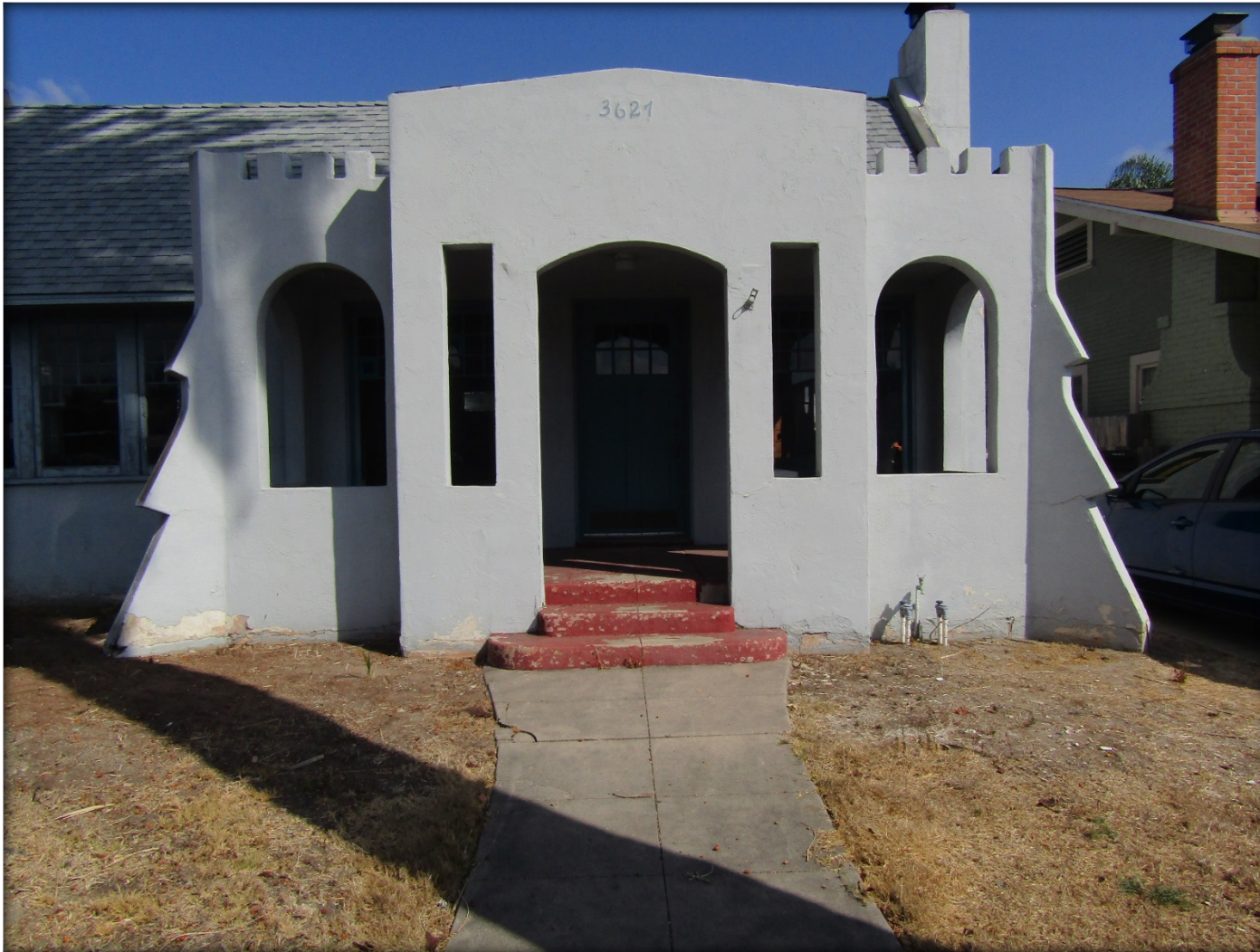
Entry Porch Detail