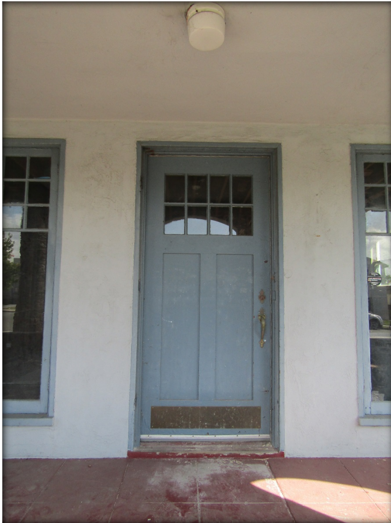
Front Door Detail