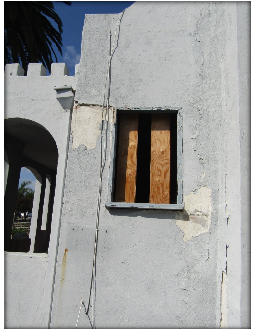
Removed Window, South Façade