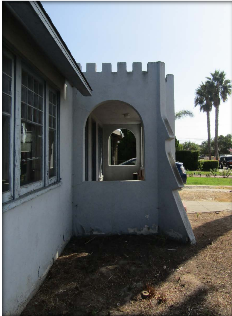
Entry Porch Detail