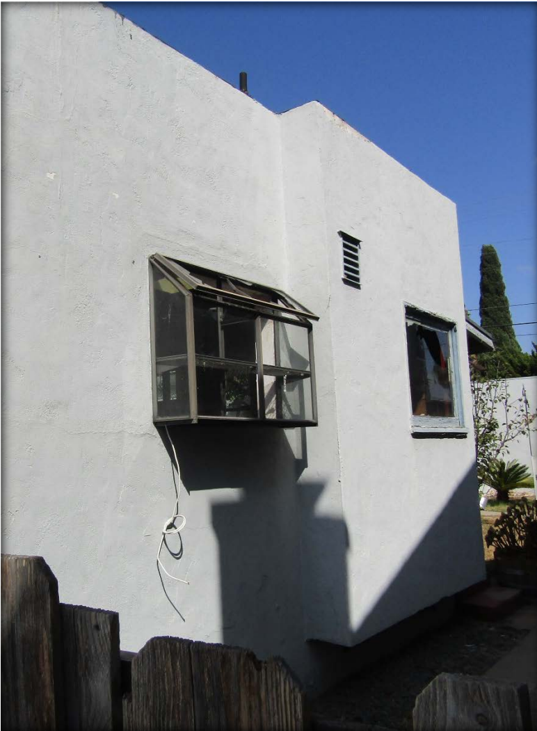
Garden Window Detail, South Façade