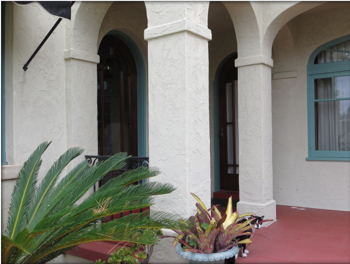
Former non-historic stucco at front entry arcade