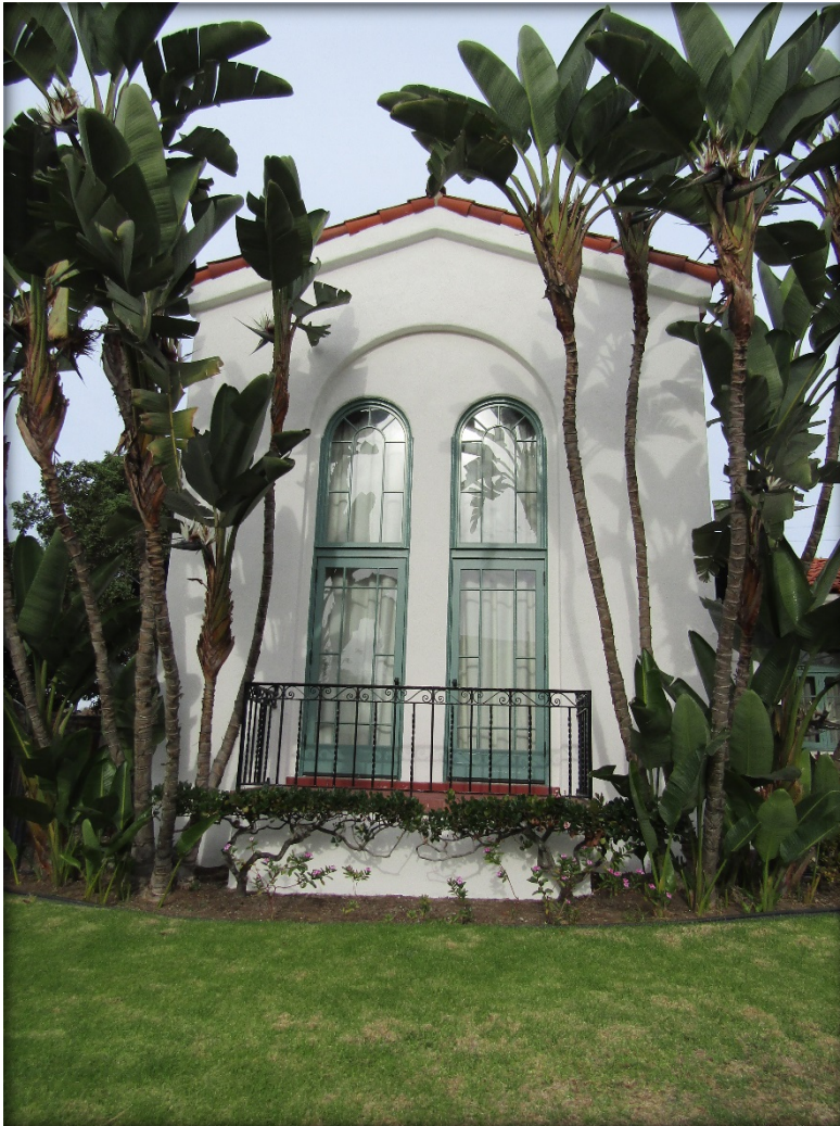
Arched wall relief with focal windows over full-light doors