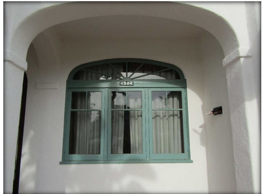
Arched front door and window with segmental arched fanlight