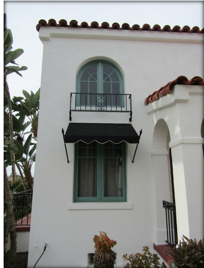
Wood sash windows and metal railing