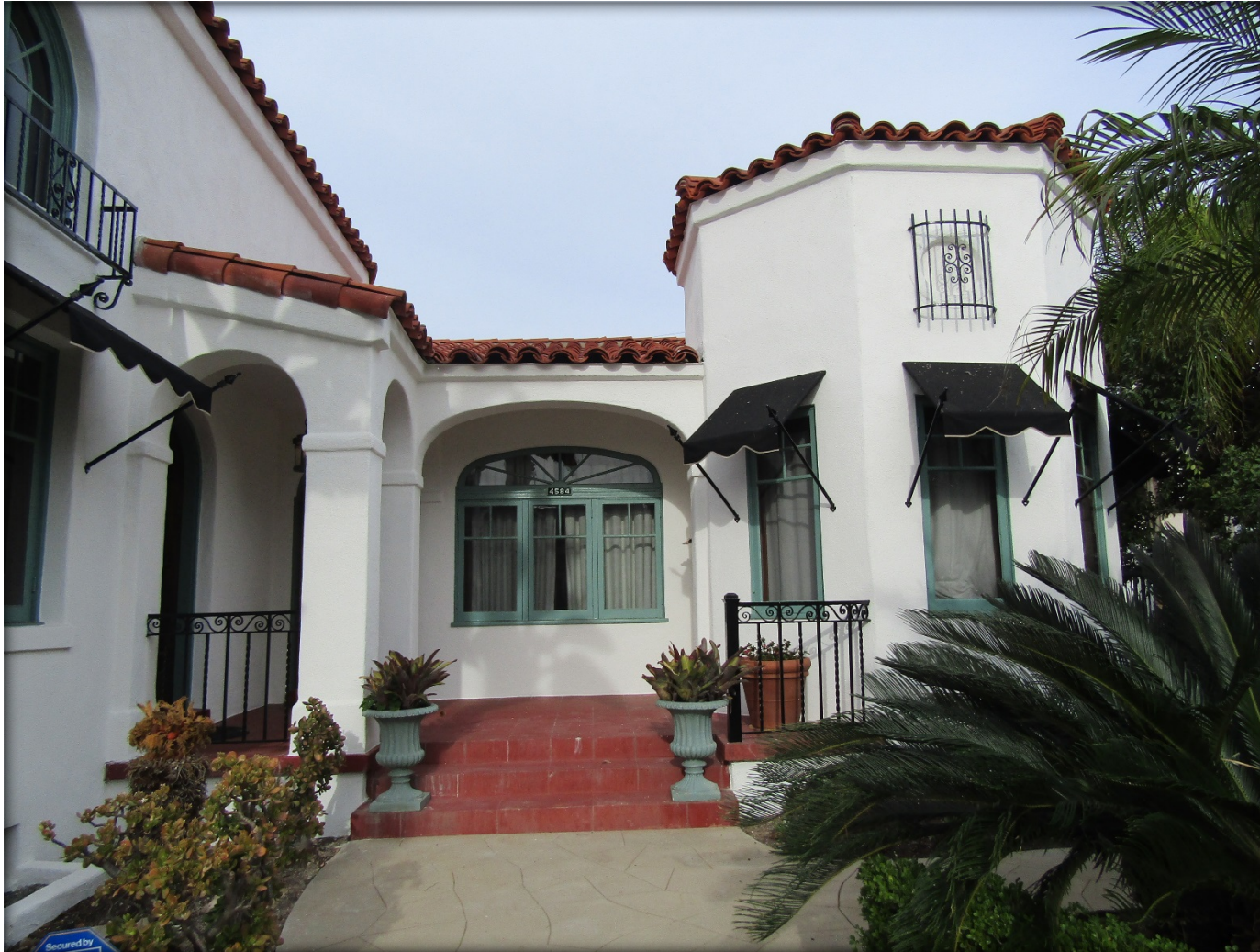
Arcaded front entry and turret