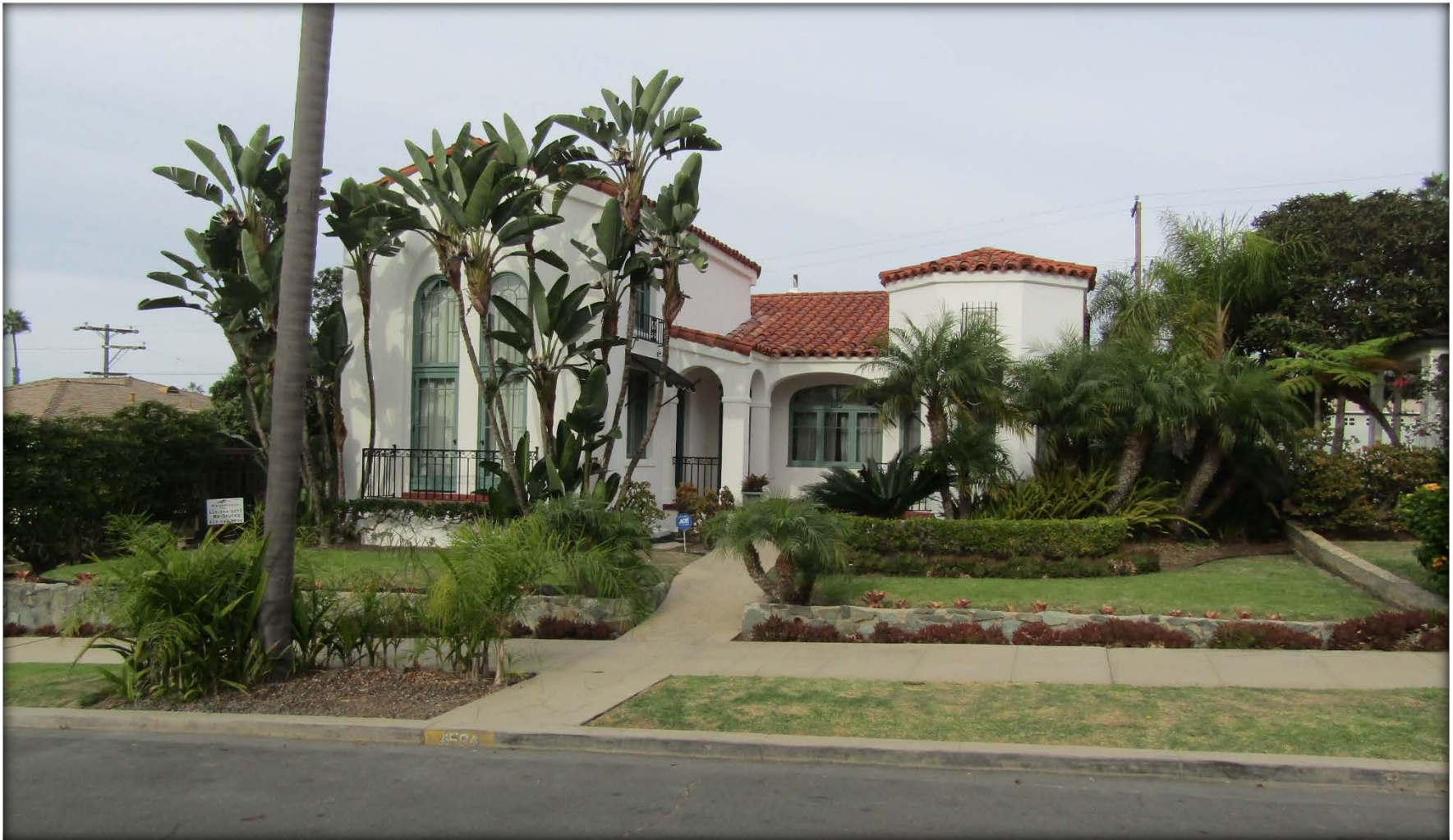
Main Elevation (Granger Street)