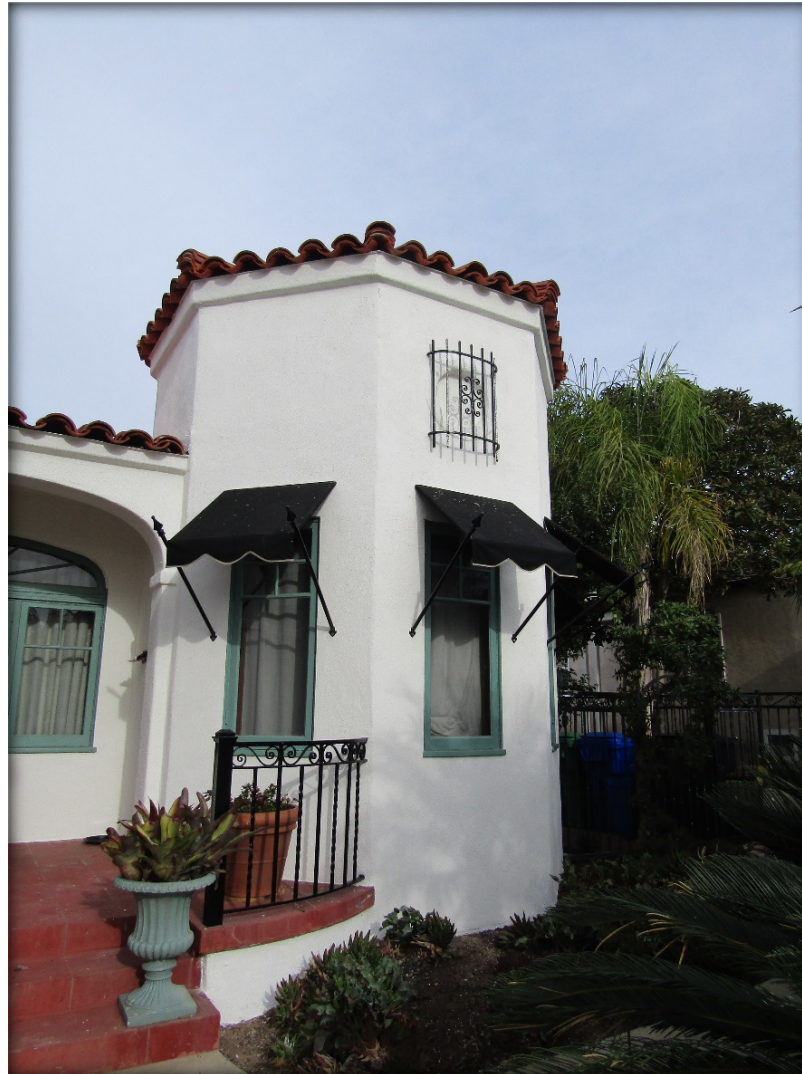
Turret with circular wall relief