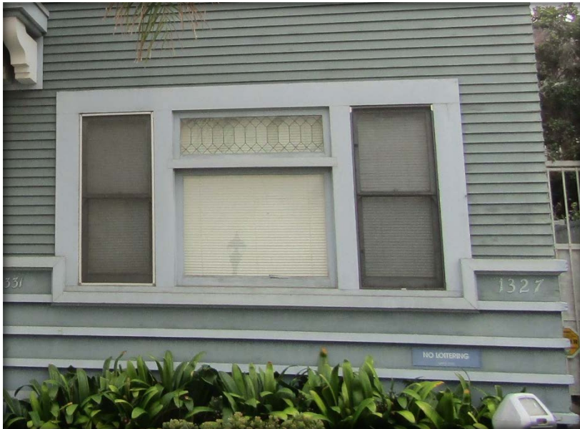
Window Detail, Front Façade