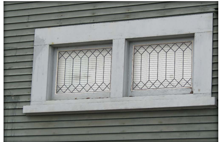
Window Detail, East Façade