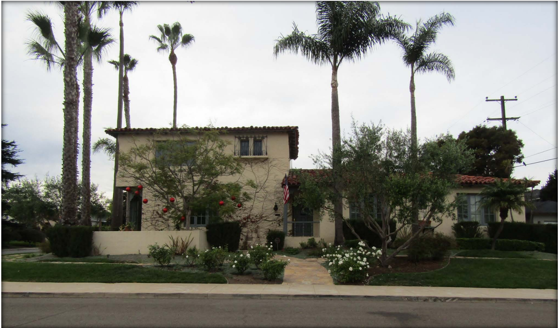
Southeast Elevation (Willow Street)