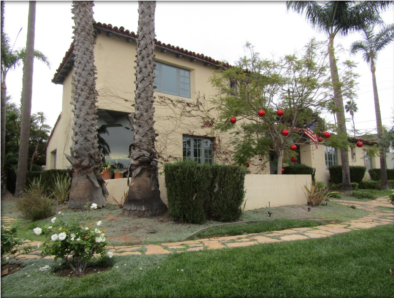
Southeast Elevation (Willow Street)