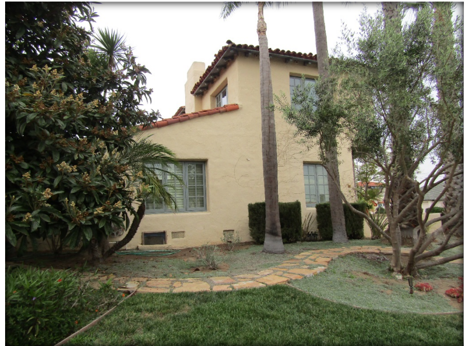
South Corner and Southwest Elevation (Freeman Street)