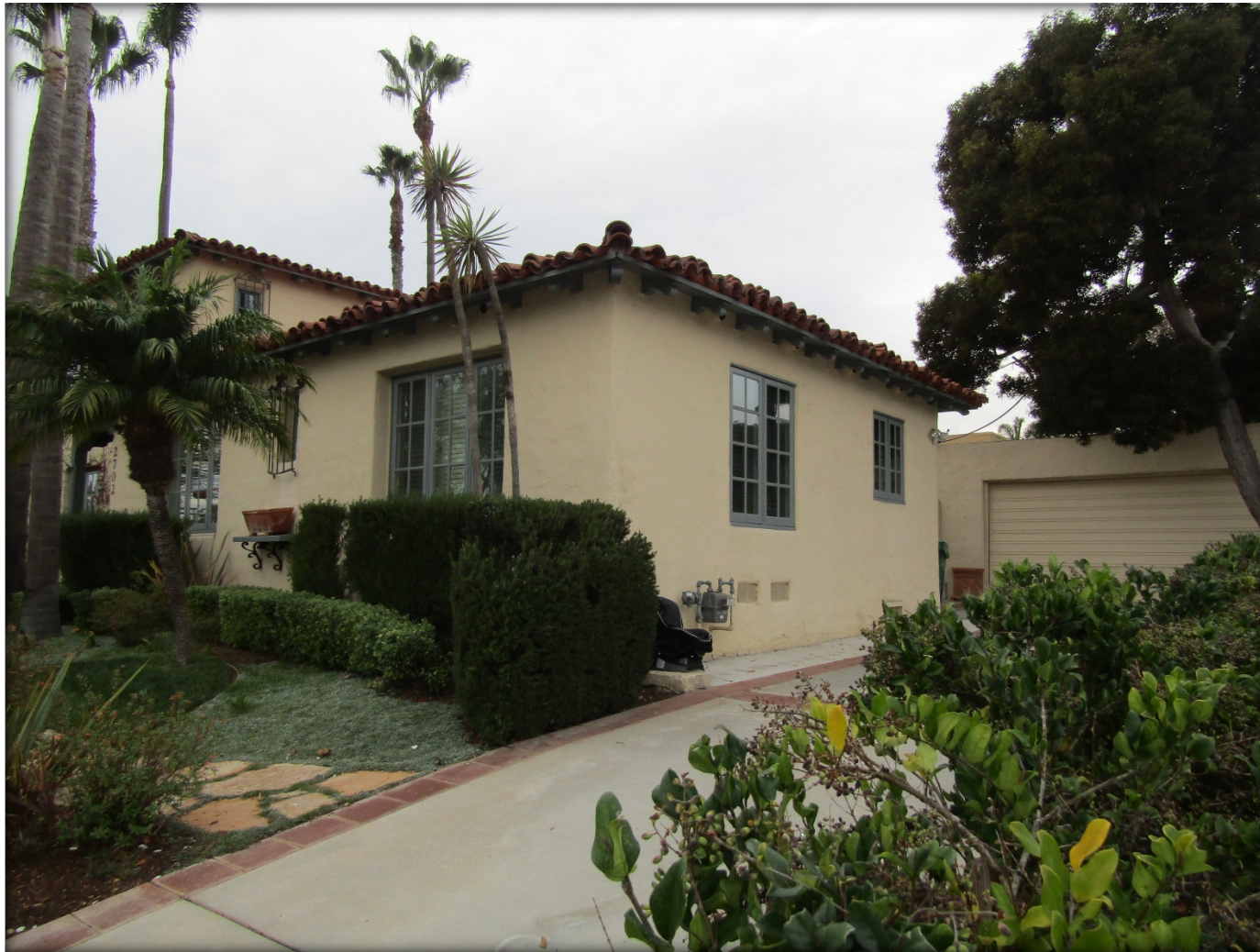
East Corner and Northeast Elevation (Willow Street)