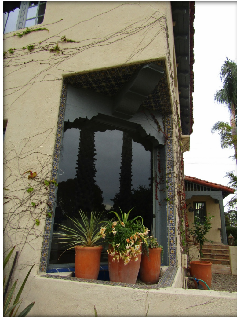
Focal window with glazed tile surround