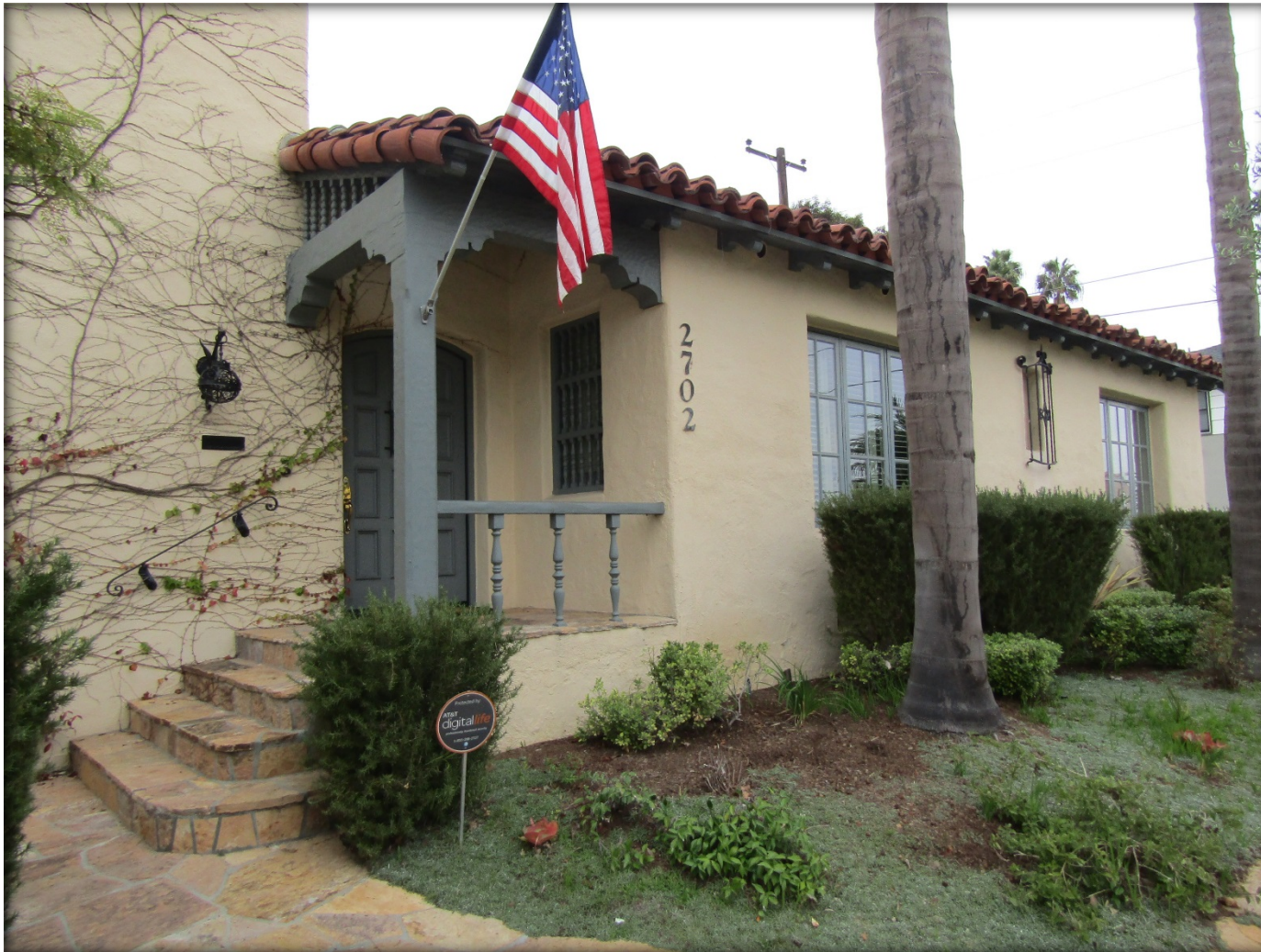
Front entrance with original flagstone walkway (Willow Street)