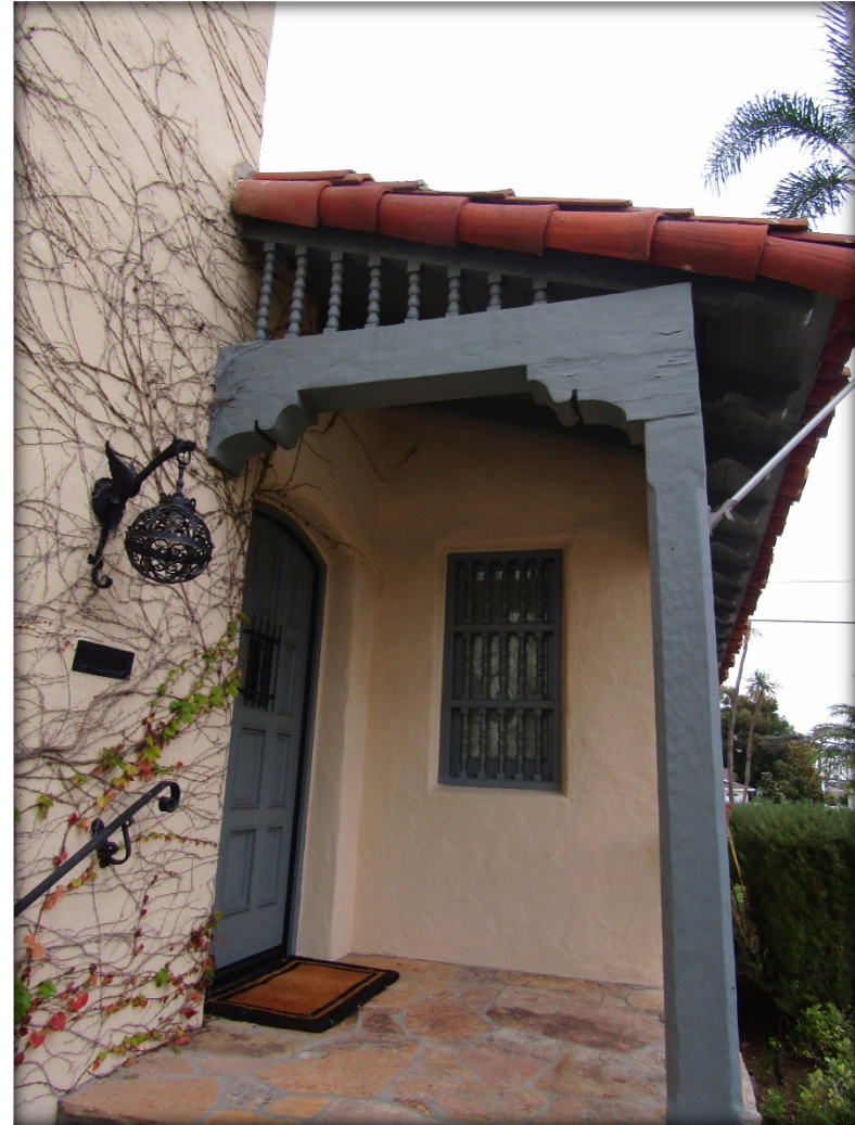
Decorative adz textured wood post, beams and corbels, and wood spindles