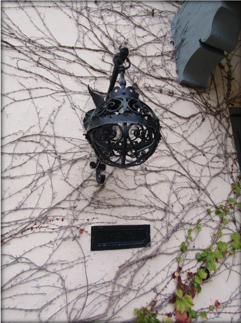
Decorative metal details