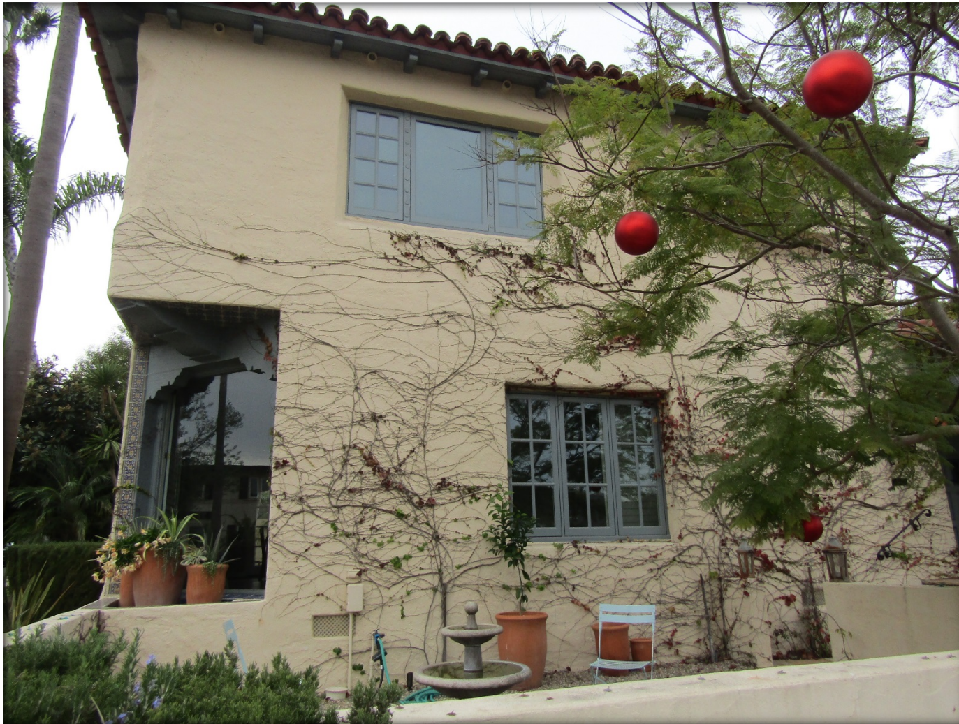
Southeast Elevation (Willow Street)