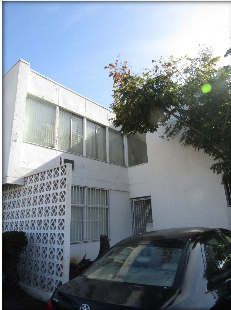
Window Detail, West Façade