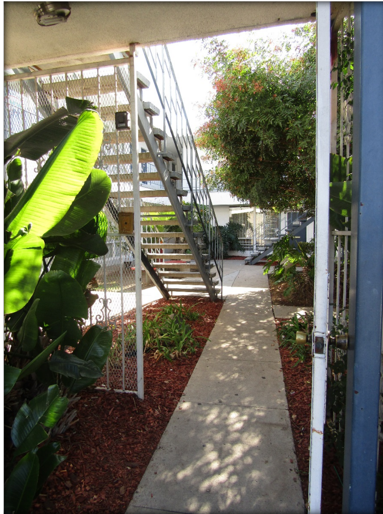
Entrance to Courtyard