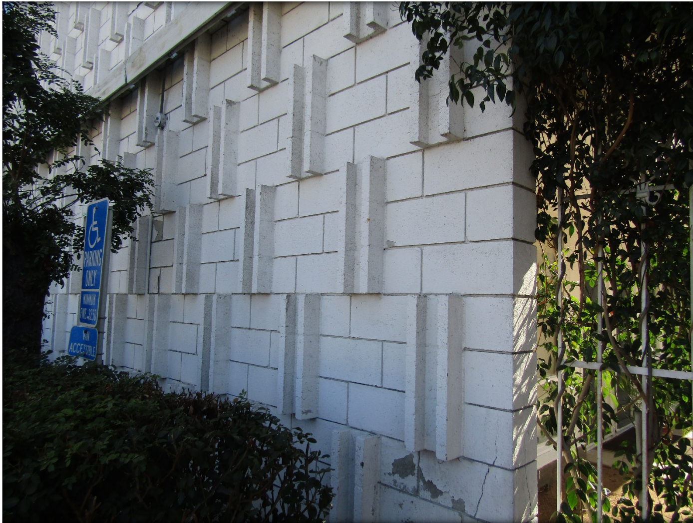
Shadow Block Detail