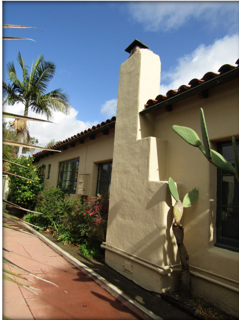
Chimney Detail, West Façade