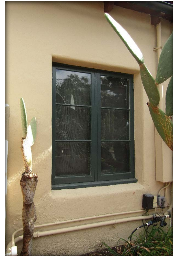
Casement Window Detail