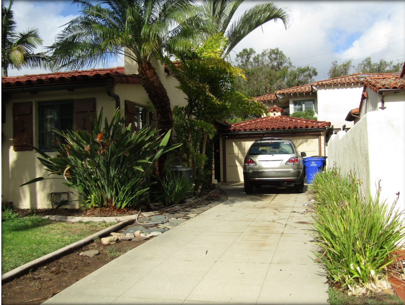
Driveway and Garage