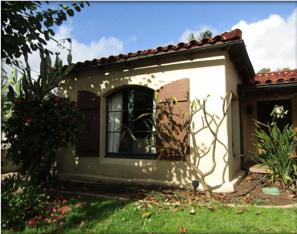
Focal Window Detail