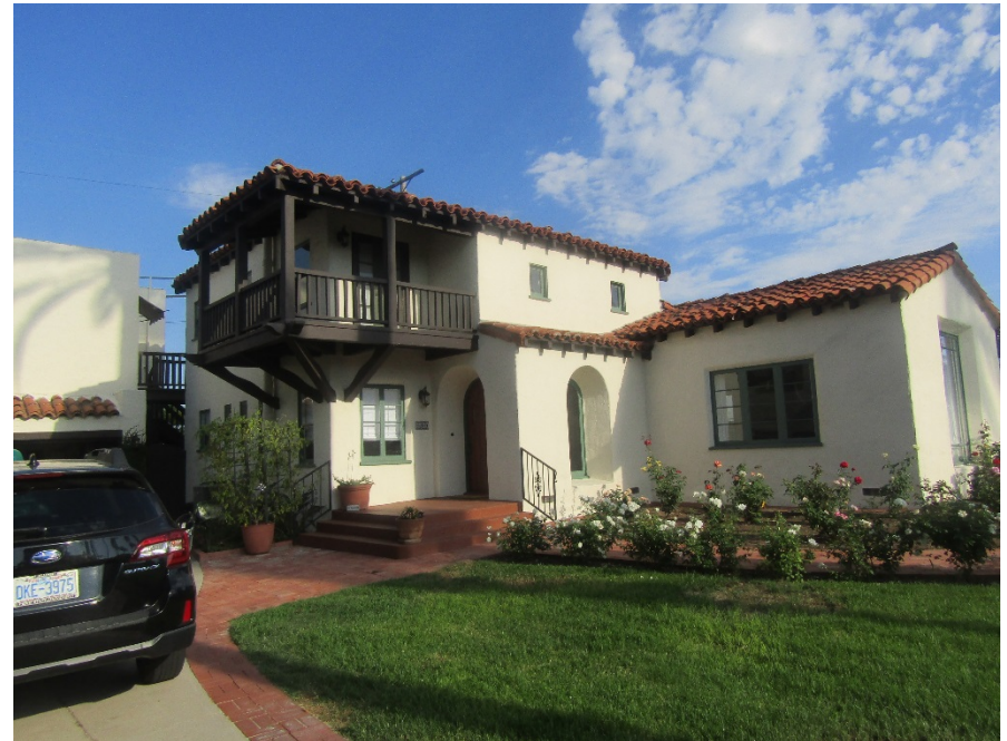
HRB 1275 Casa Descanso 5201 Marlborough Drive