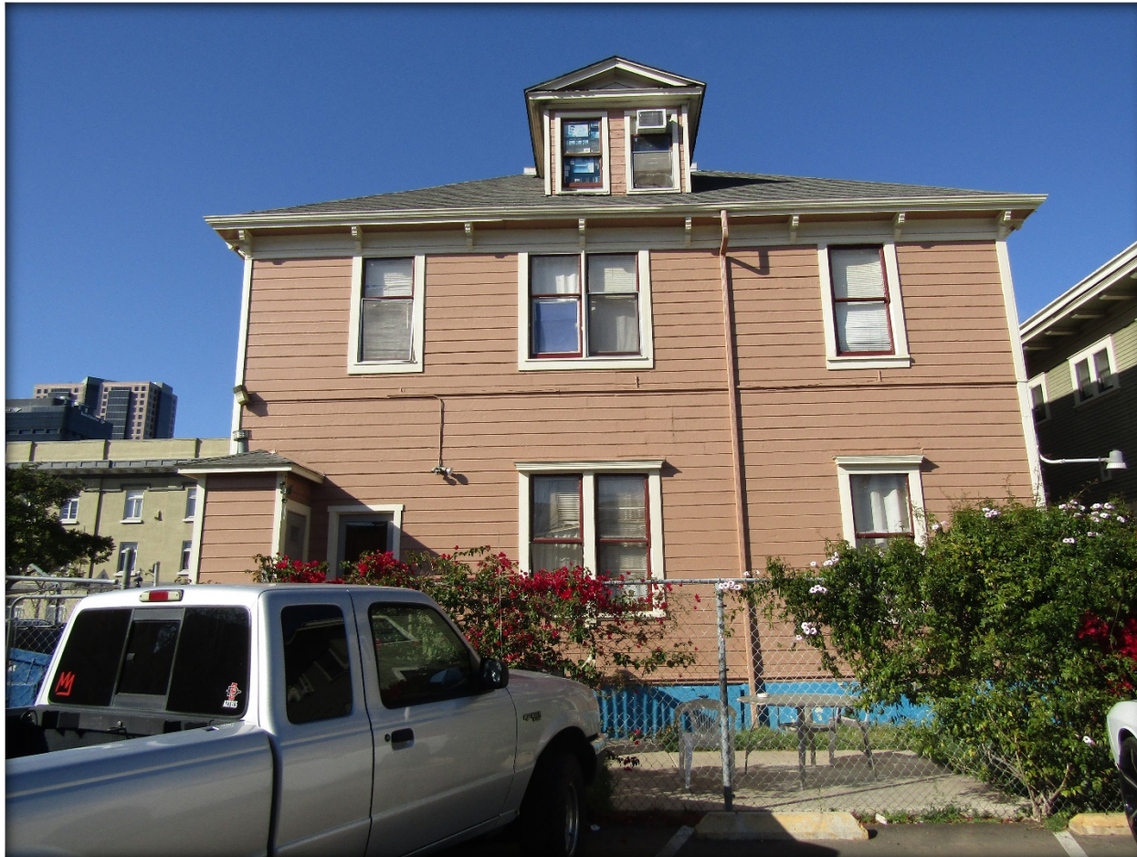
Custer Apartments at 1035 E Street, view north toward rear elevation