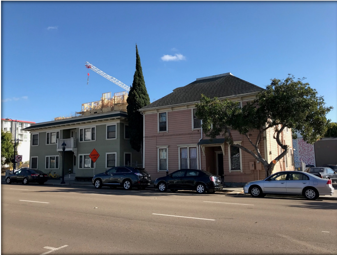
View southeast toward 1045 E Street (Left) and 1035 E Street (Right).