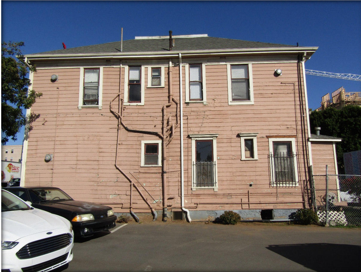
Custer Apartments at 1035 E Street, view east toward right side elevation