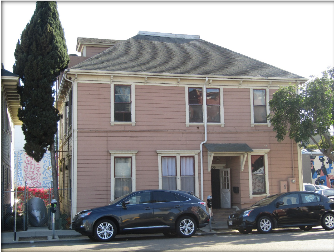
Custer Apartments at 1035 E Street, view south toward primary façade