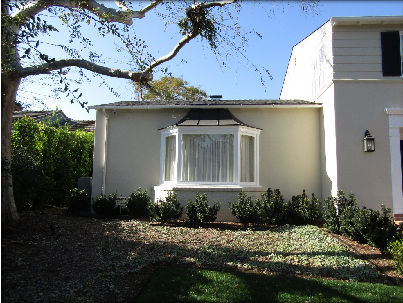
Side Wing Detail