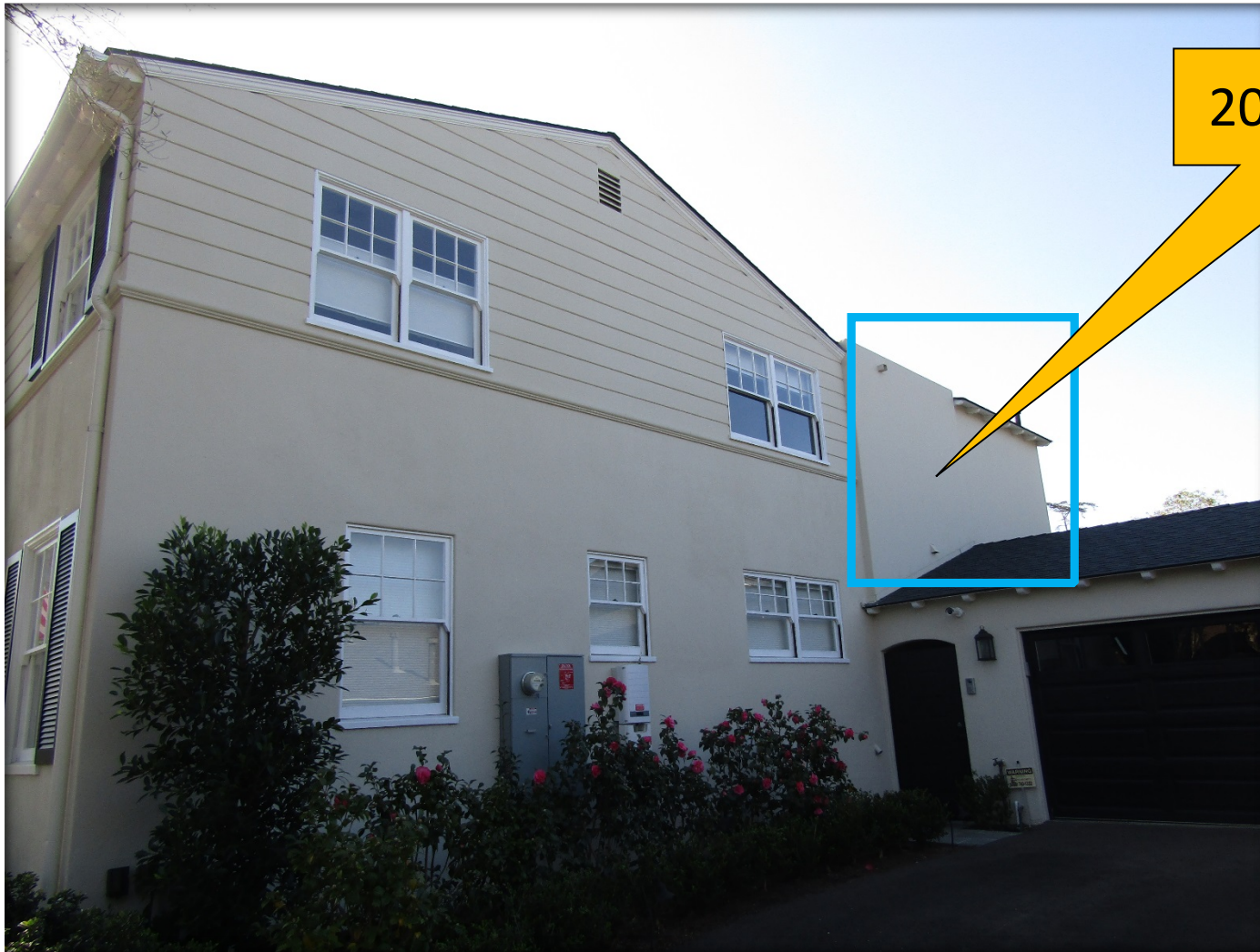
North Façade Showing Addition