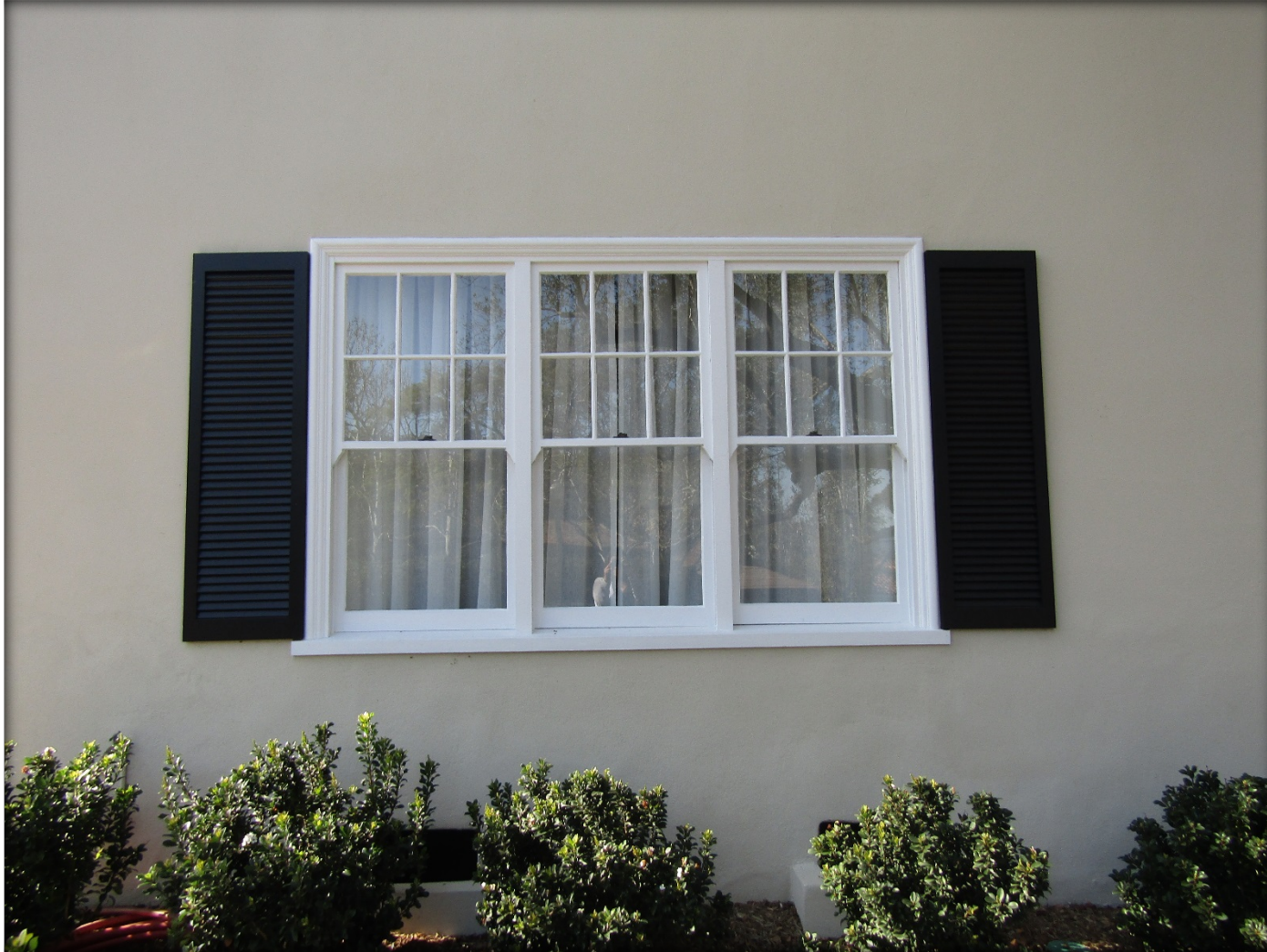
Window Detail, Street Façade