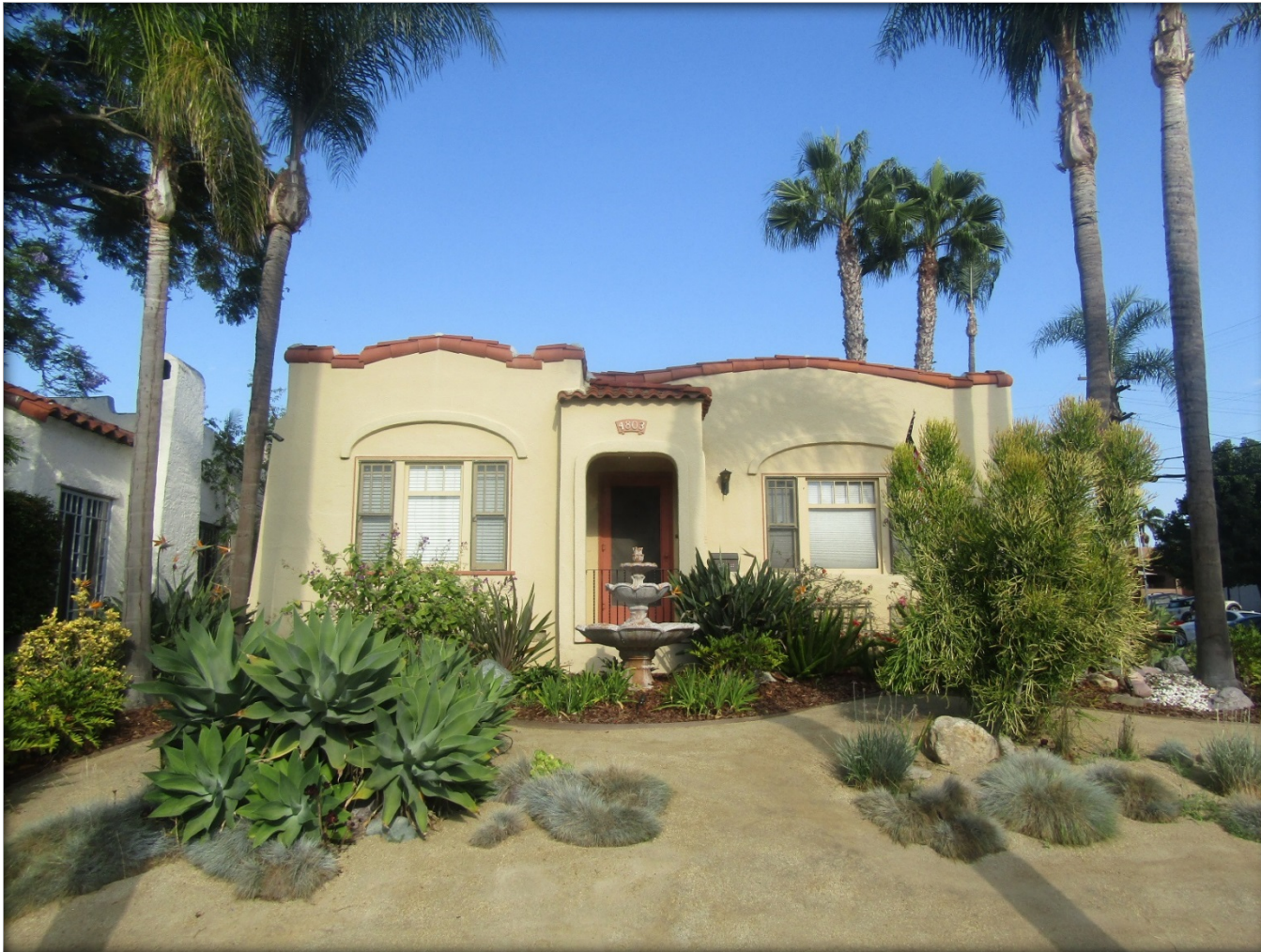
View east toward primary façade