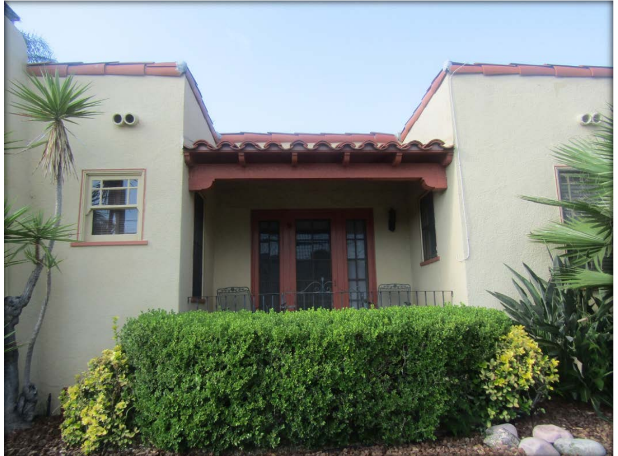
Detail views to chimney and side porch at south elevation