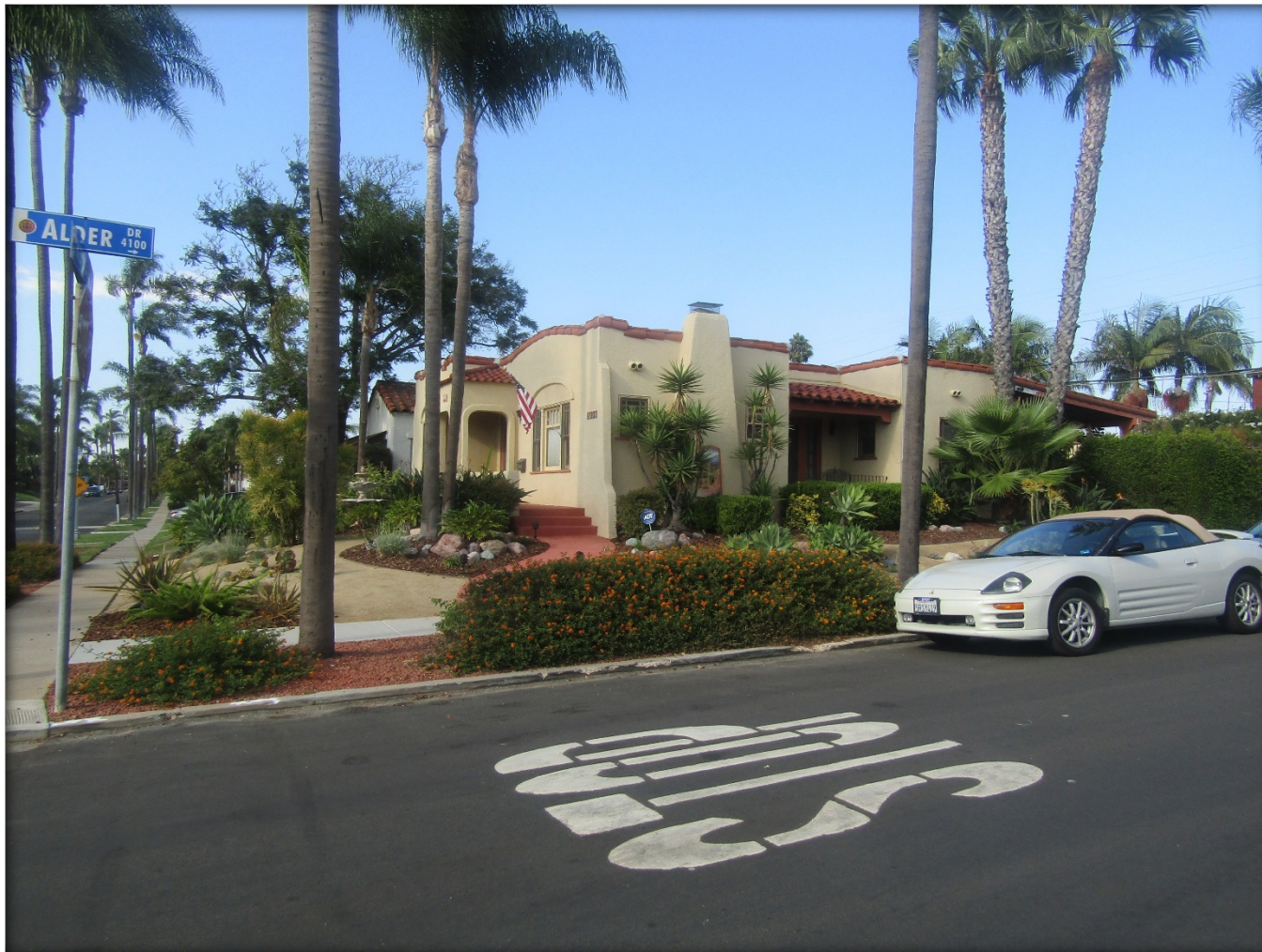
View northeast toward west [primary] and south elevations