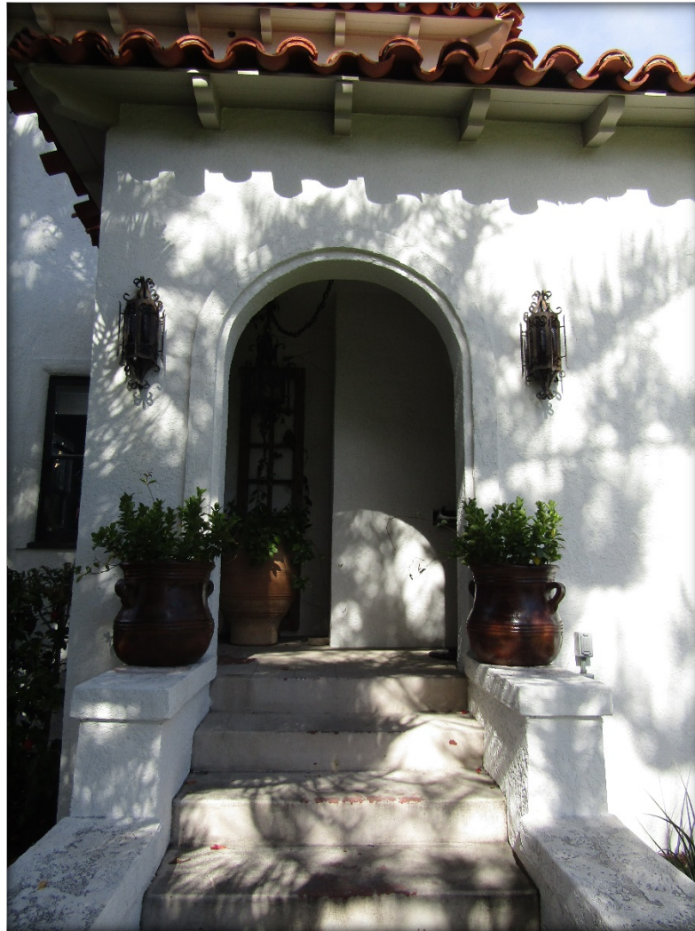
Entry Porch Detail