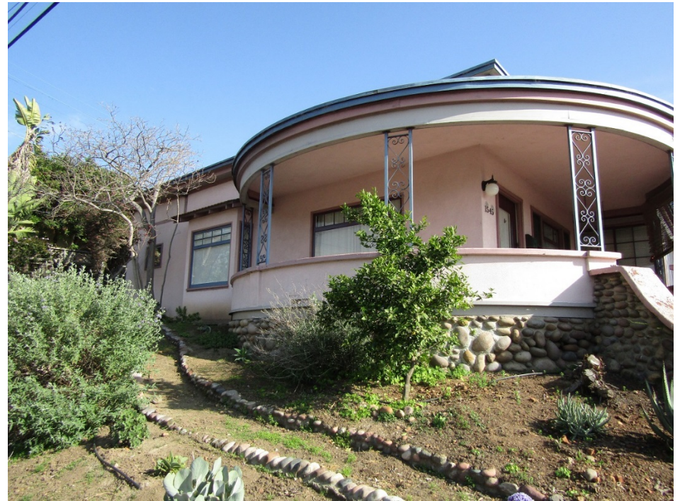
View southeast toward front porch and north elevation