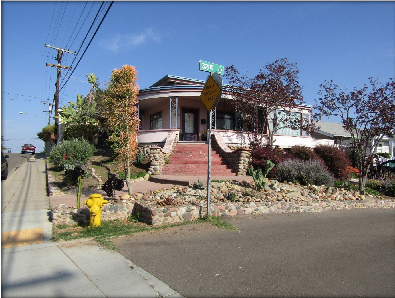
Subject Property, 1545 32 nd Street, view east toward primary façade