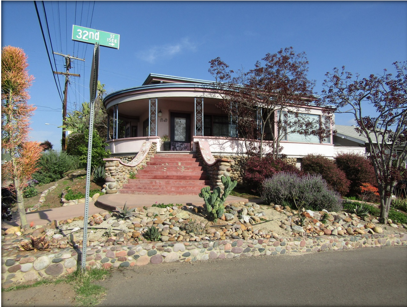
Subject Property, 1545 32nd Street, view east toward primary façade