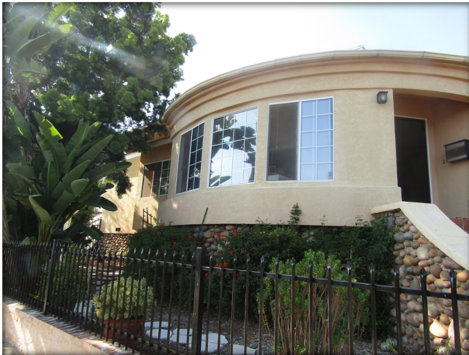
1802 Bancroft Street, view northwest toward south elevation