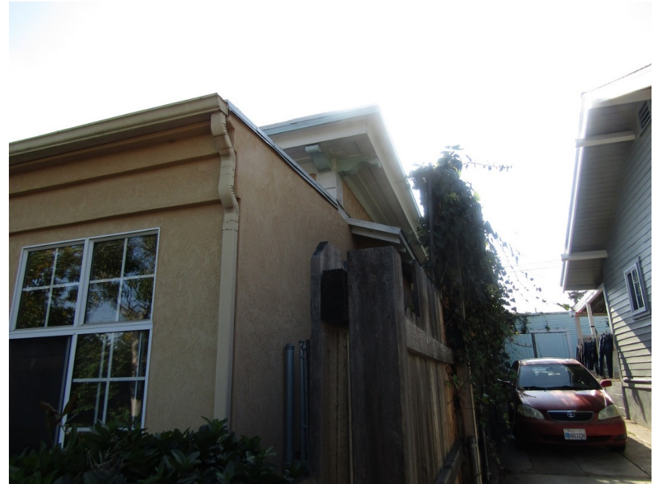
1802 Bancroft Street, view west