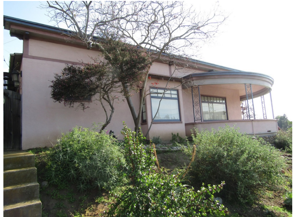
View south toward north elevation, along Cedar Street