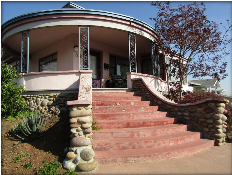
Porch detail, View southeast