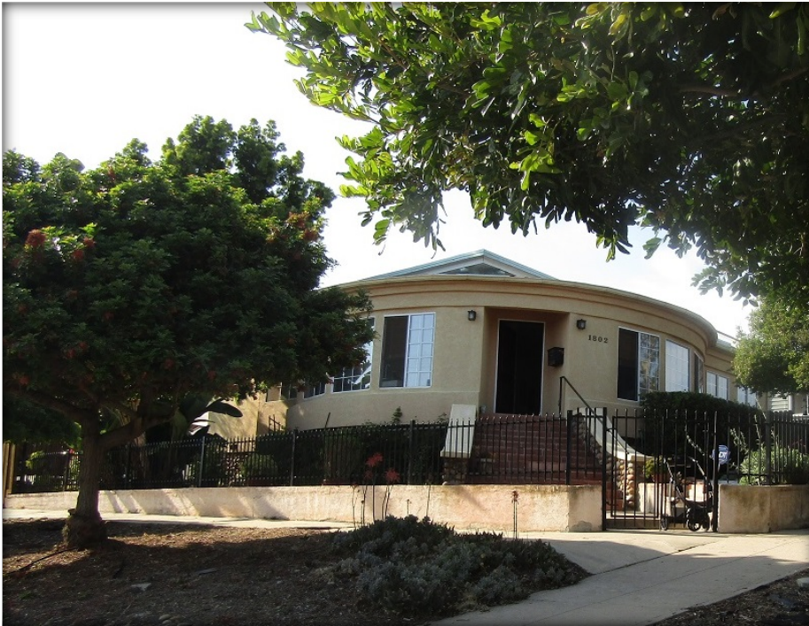
1802 Bancroft Street, view northwest