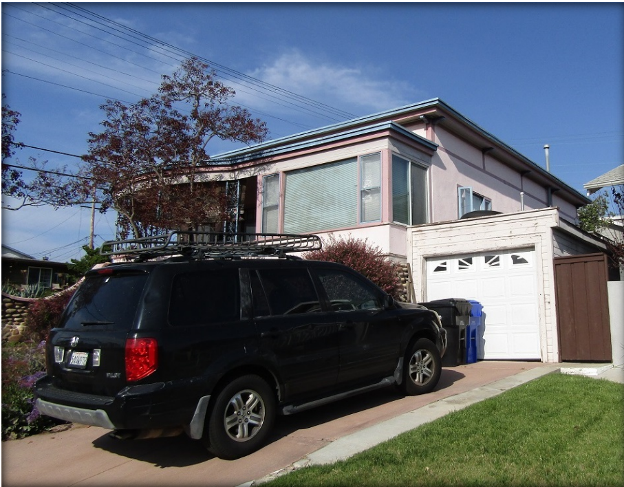
View east-northeast toward Primary façade