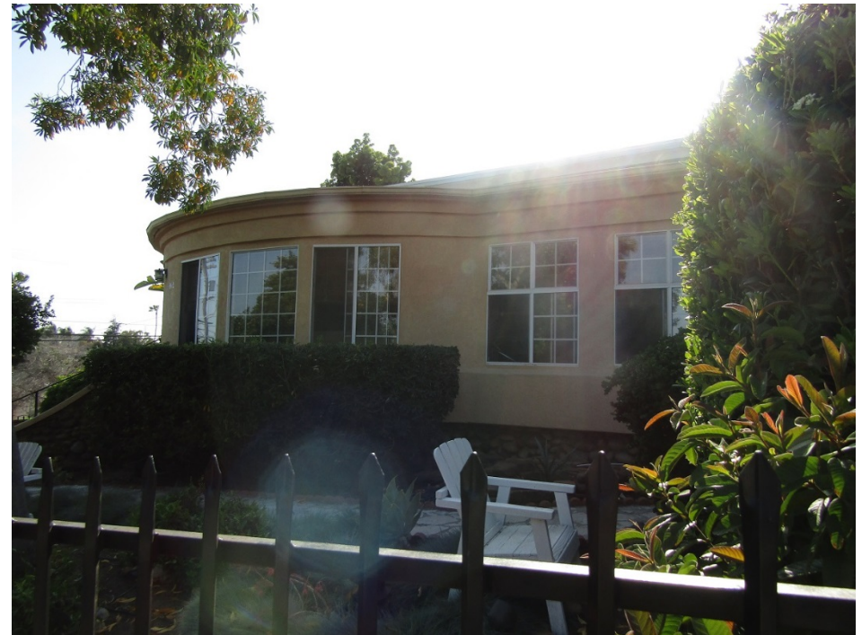
1802 Bancroft Street, west southwest toward east elevation