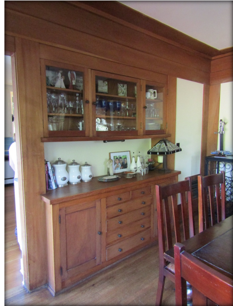
Dining Room Buffet