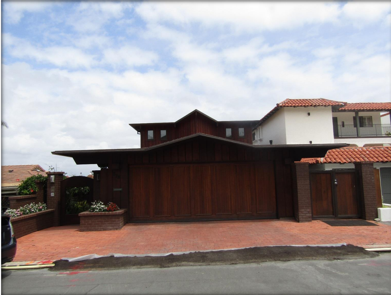
View east toward primary façade of 379 San Antonio Avenue