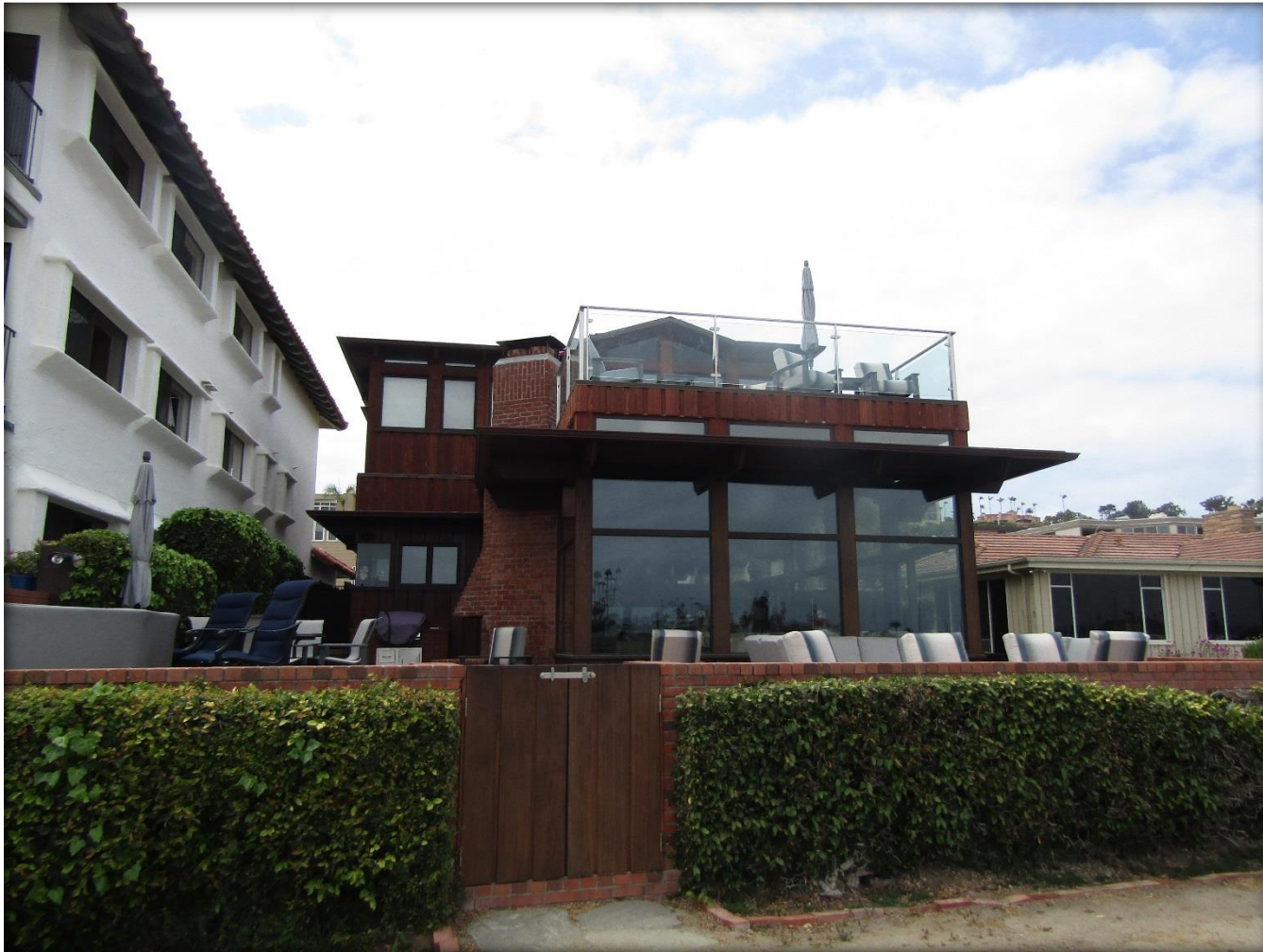
View west toward rear elevation of subject property