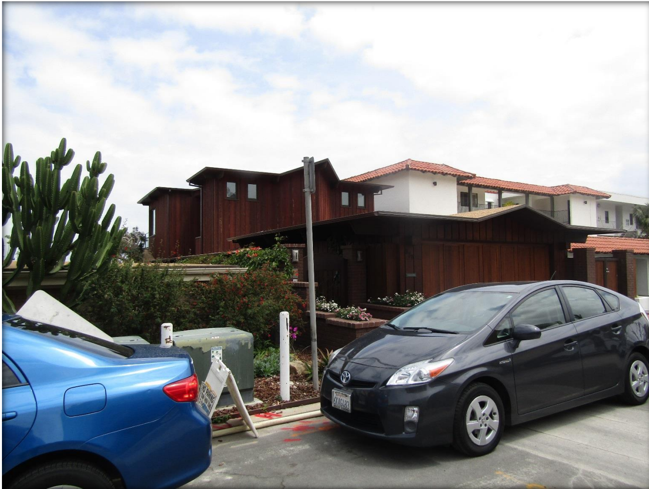
View southeast toward subject property