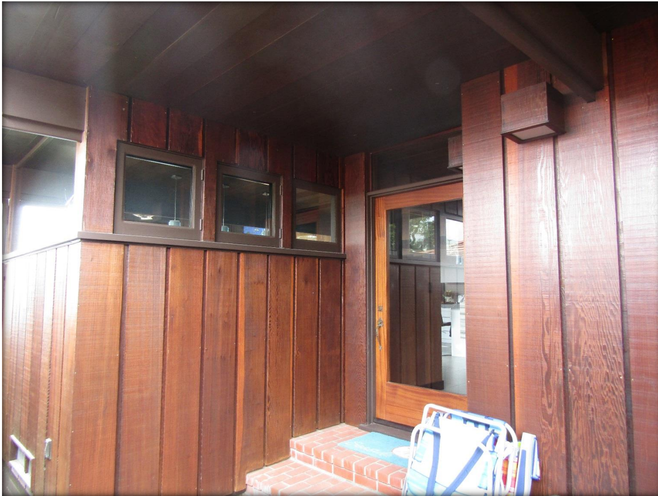
View southeast toward front entry of 379 San Antonio Avenue along the north elevation