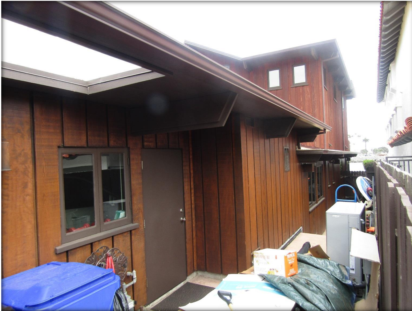
View east along south elevation