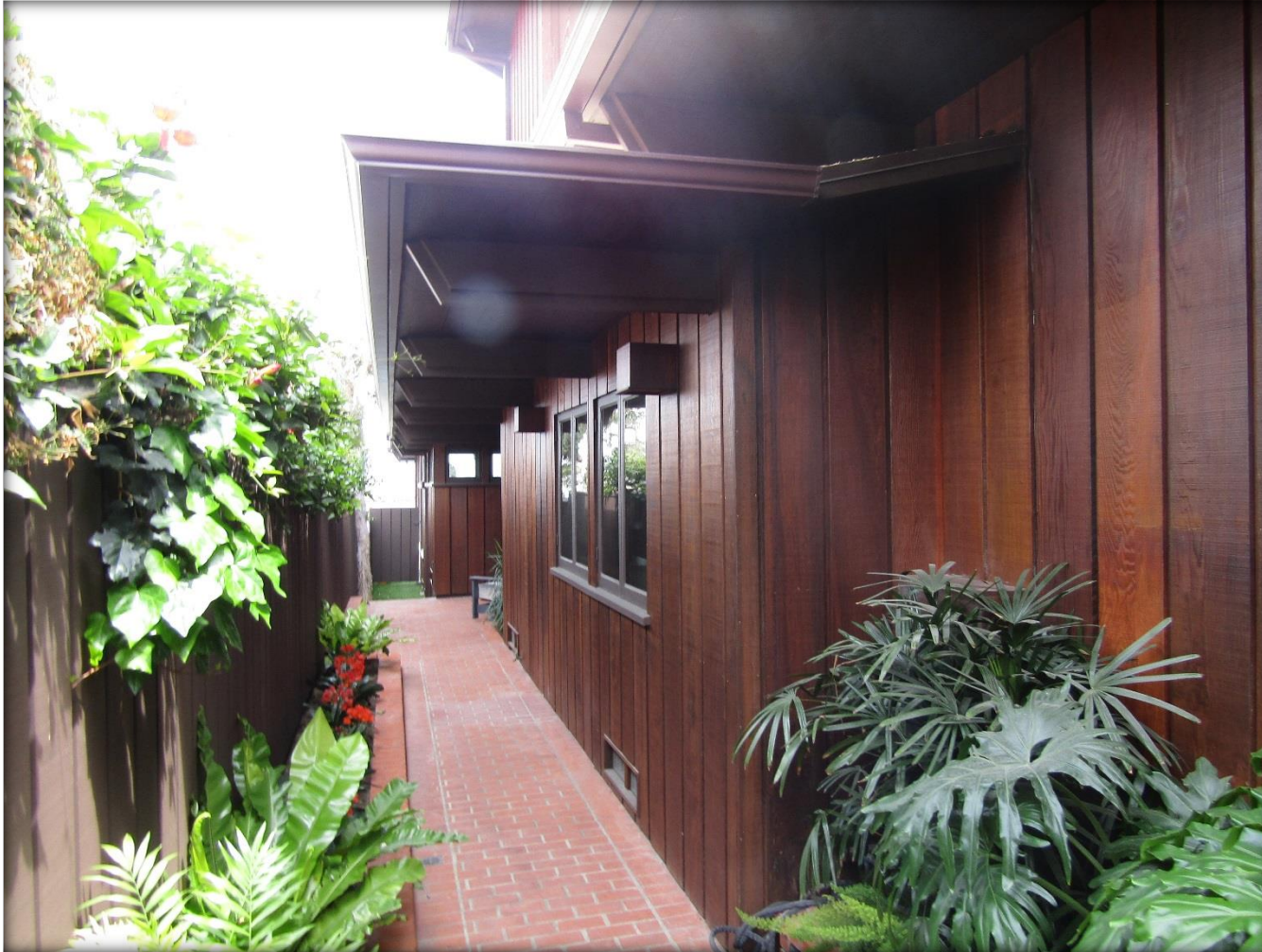
View east along north elevation and approach toward the entry door