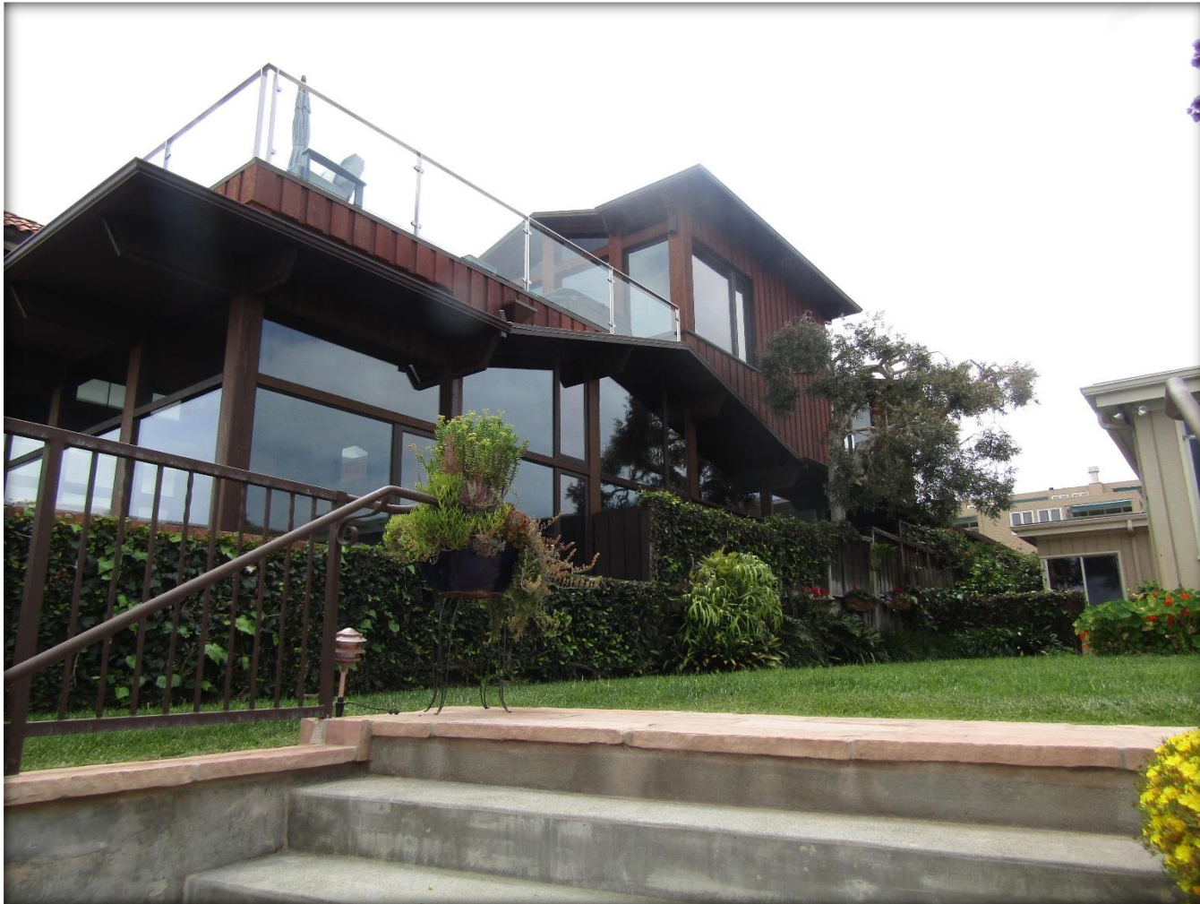
View southwest toward north and east elevations