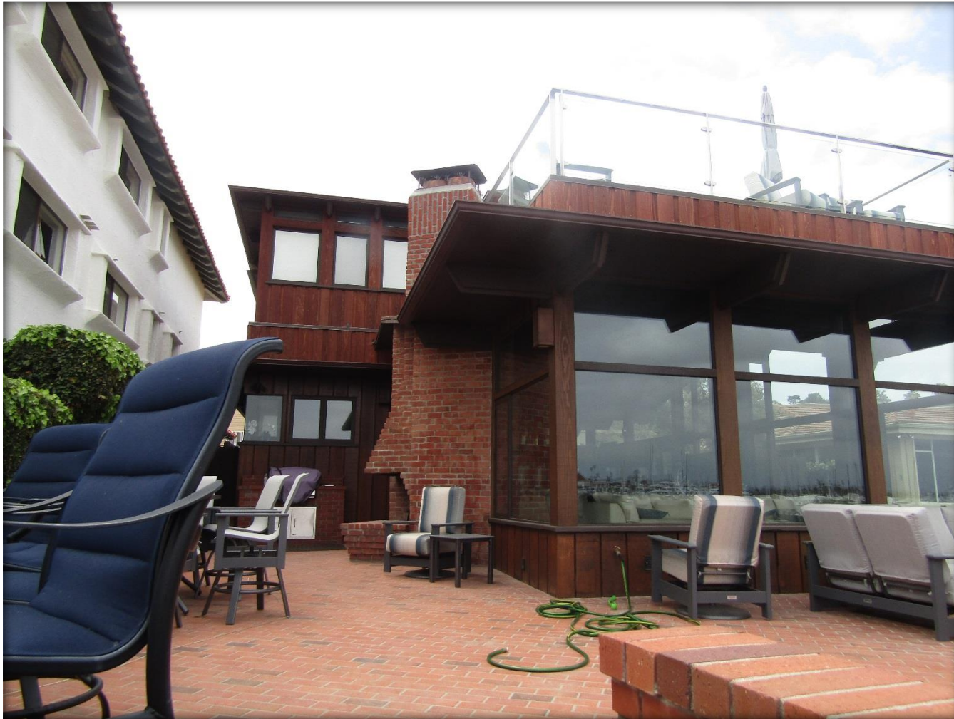
View west toward east [rear] elevation