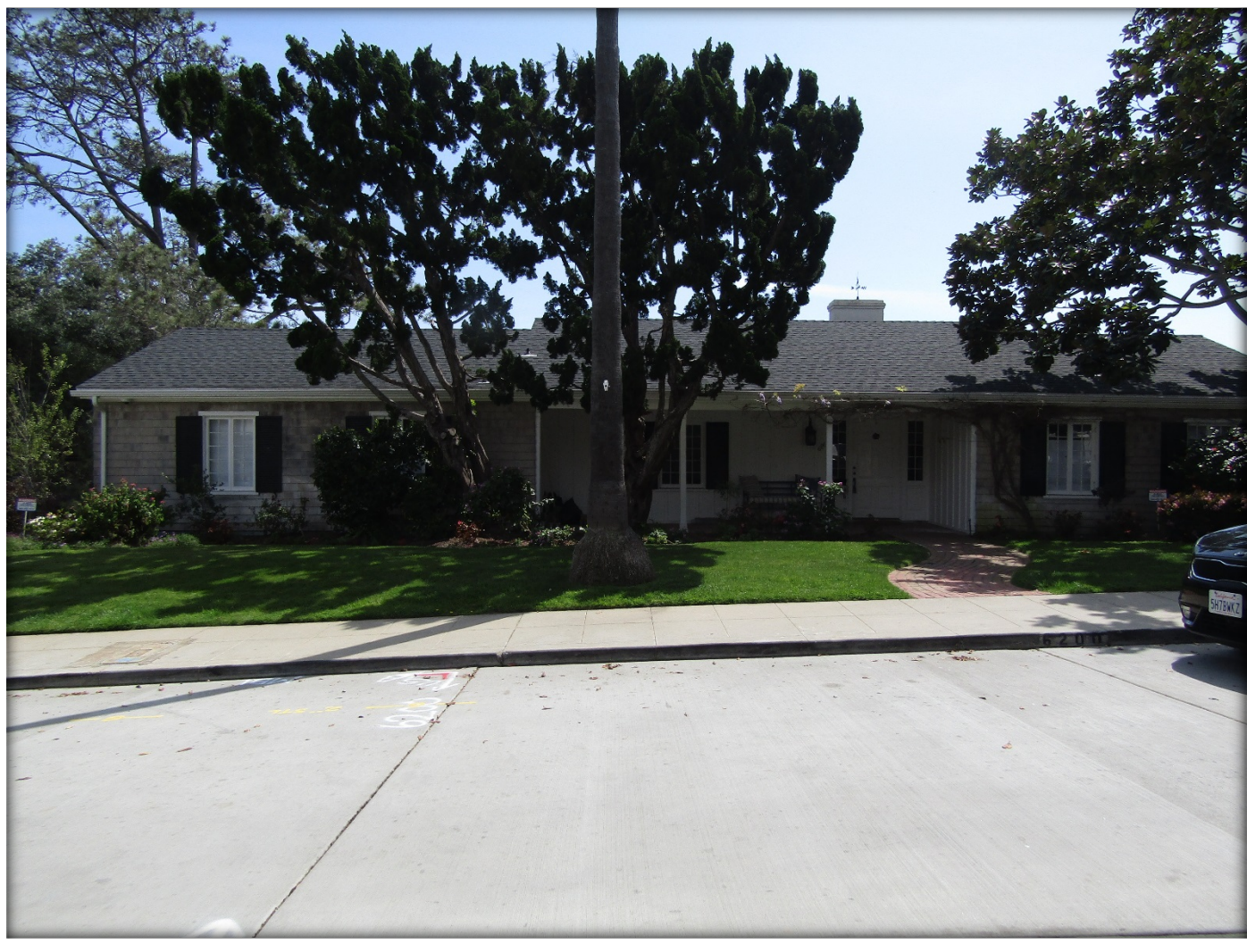
North Façade, Avendia Cresta