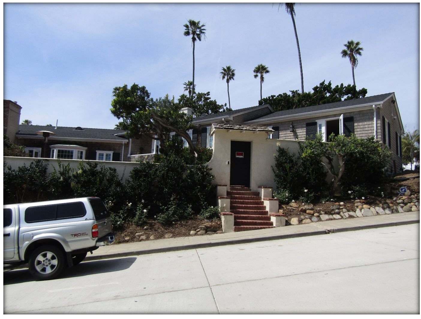
East Façade, Avenida Cortez