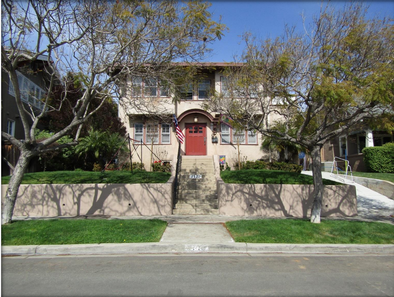
View northeast toward primary elevation