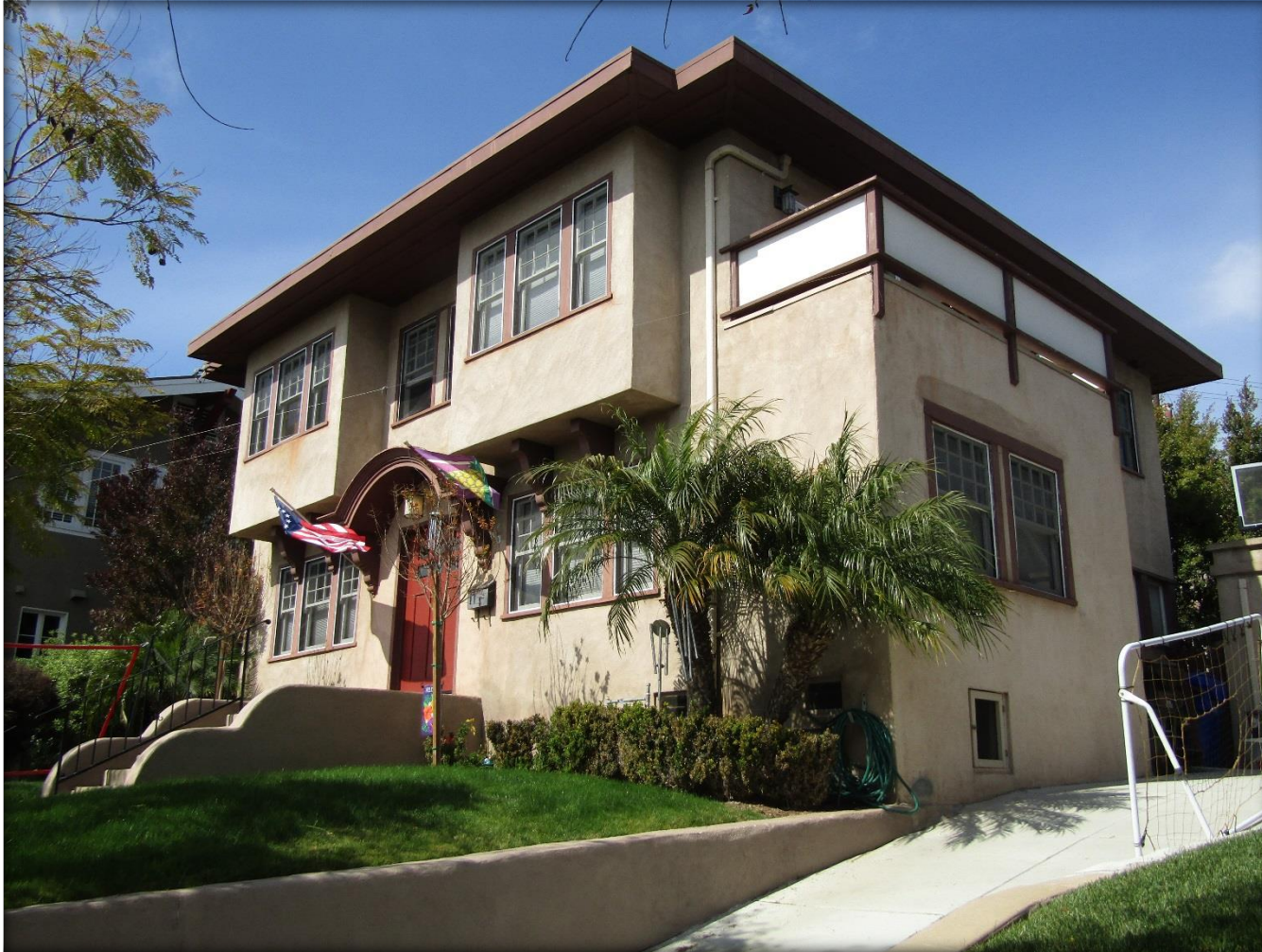
View north toward subject property