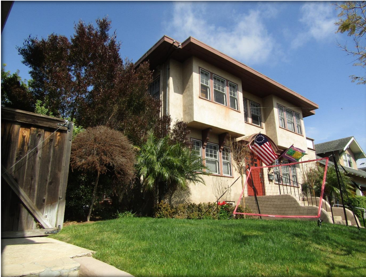
View east toward subject property