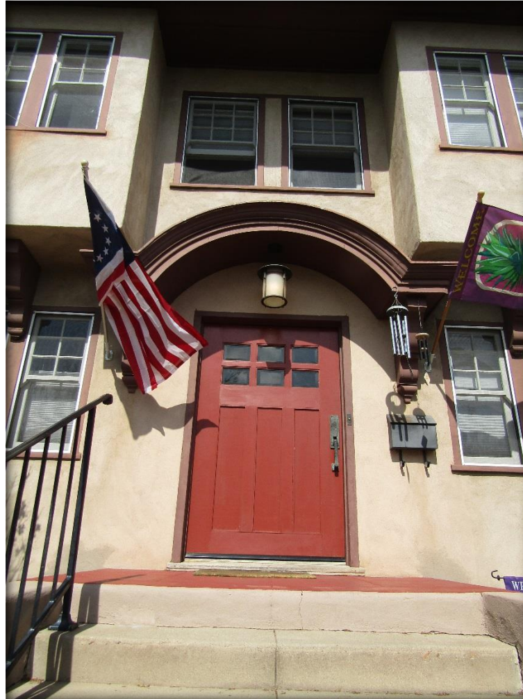
Detail view of front entry