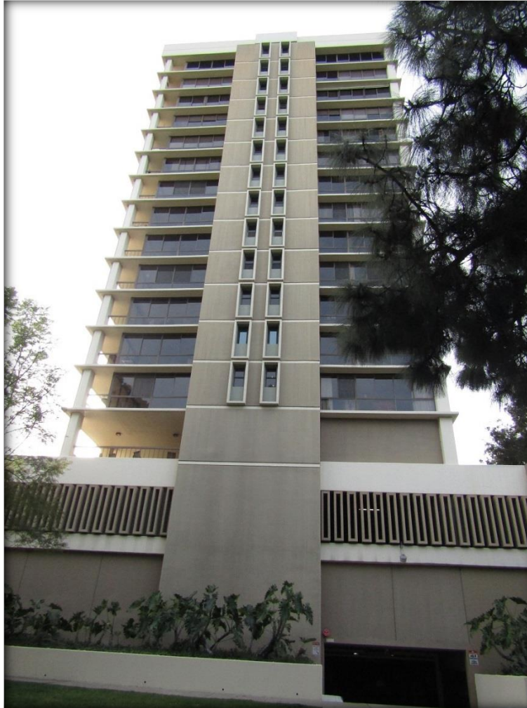
View west toward east elevation