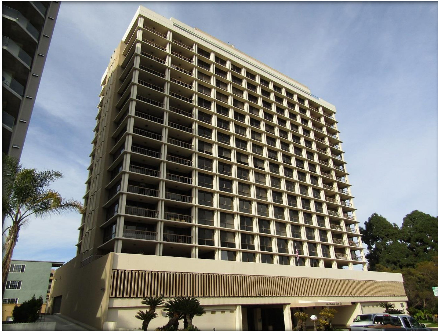
View north toward primary elevation