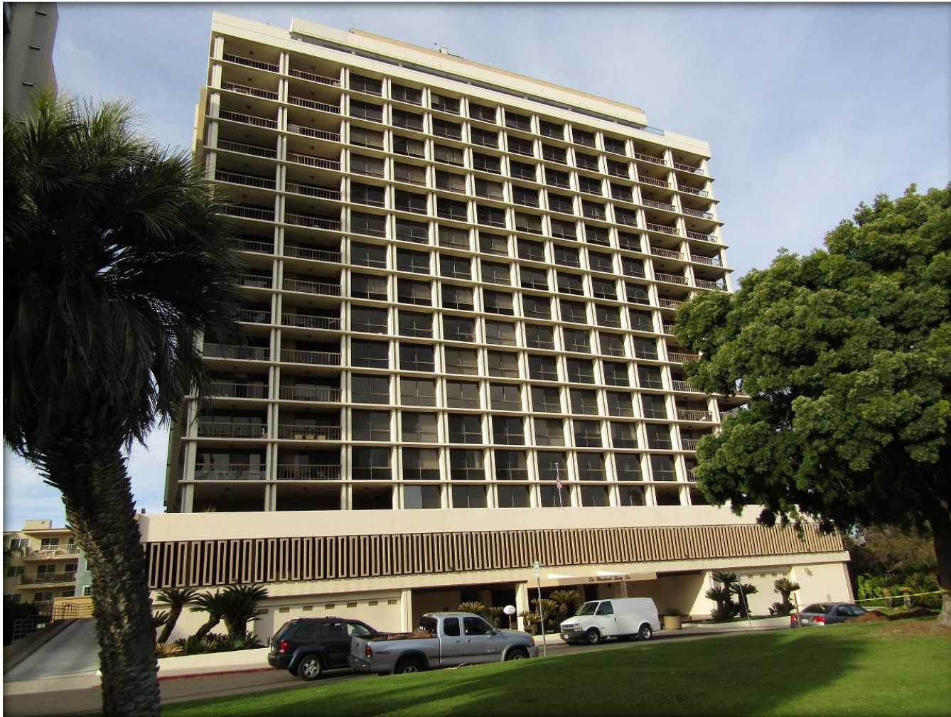
View north toward subject property