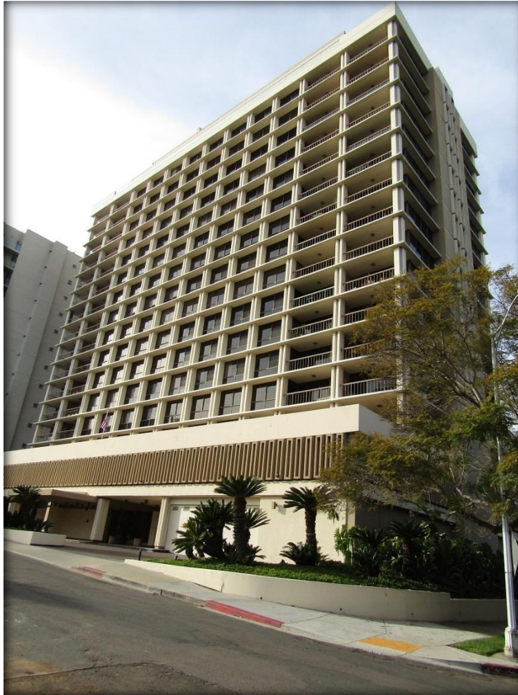
View northwest toward subject property