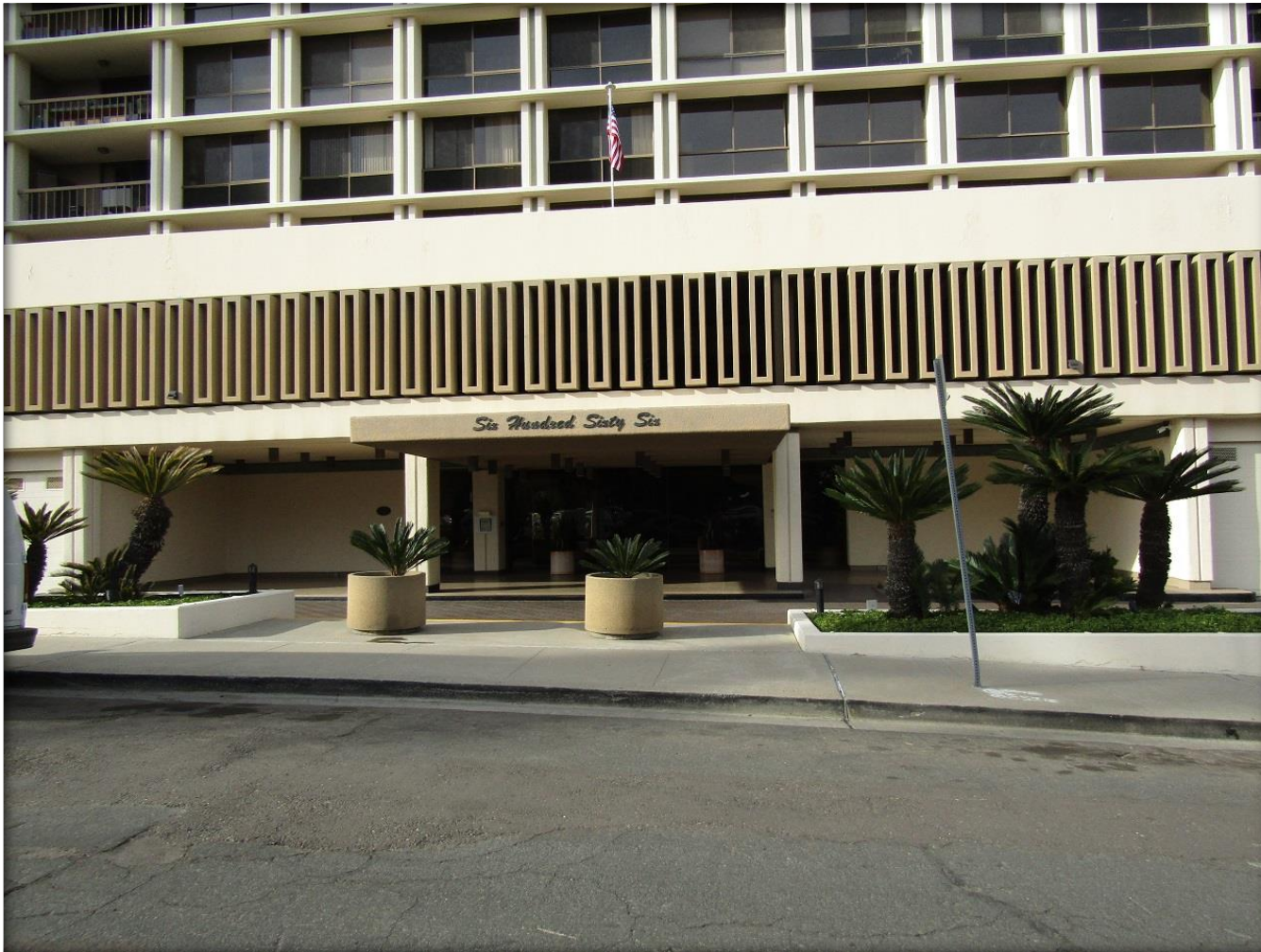
View north toward primary entry at south elevation