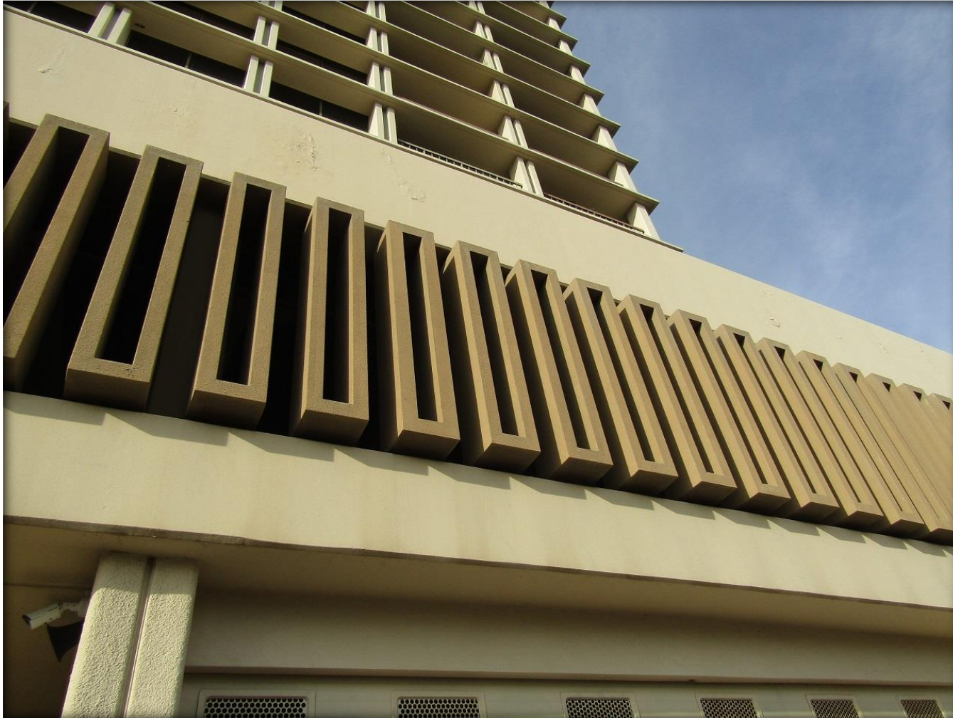
Detail view of concrete screen at garage.