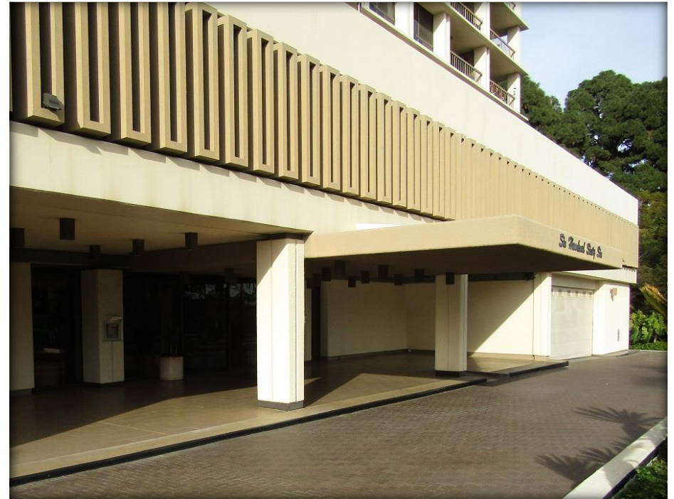
Detail views of subject property entry at south elevation