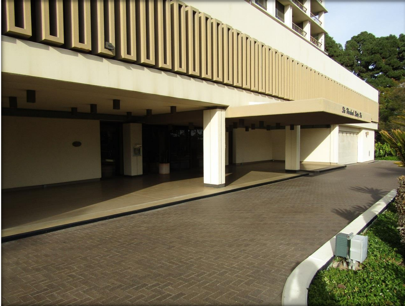
View northeast along south elevation and approach toward entry