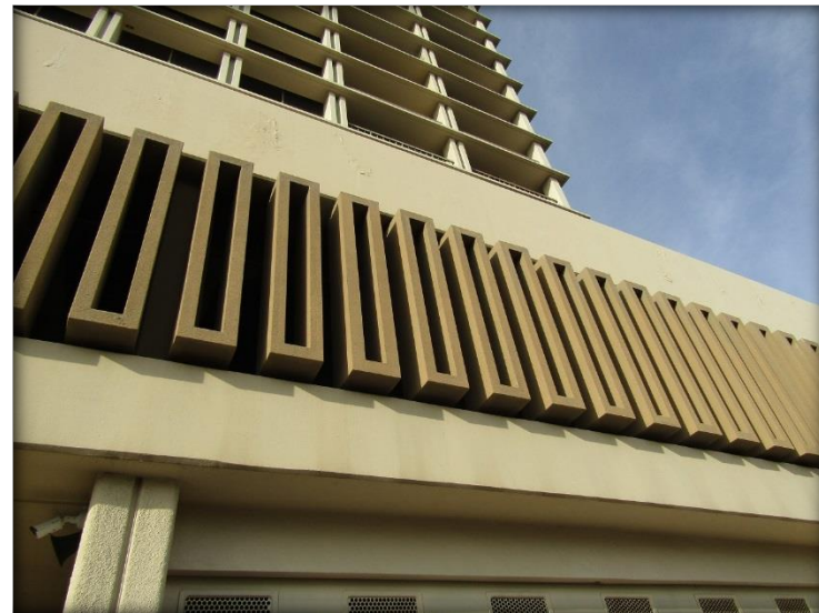
Detail views of subject property