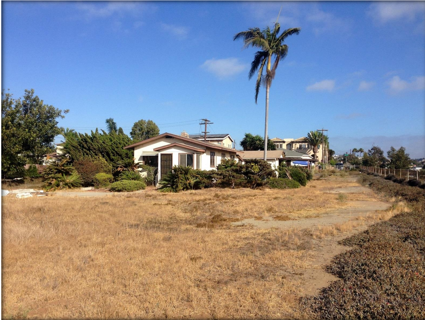
Barn, West Façade