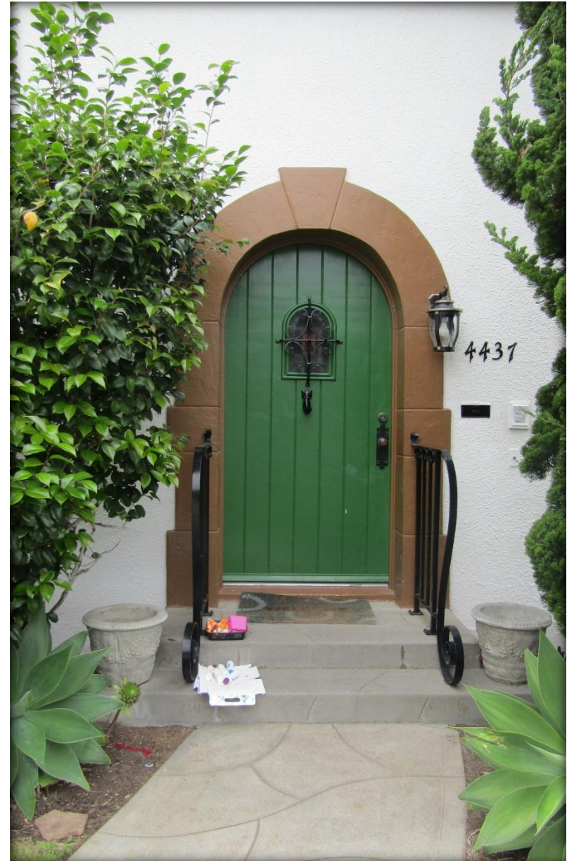
Front Entryway Detail