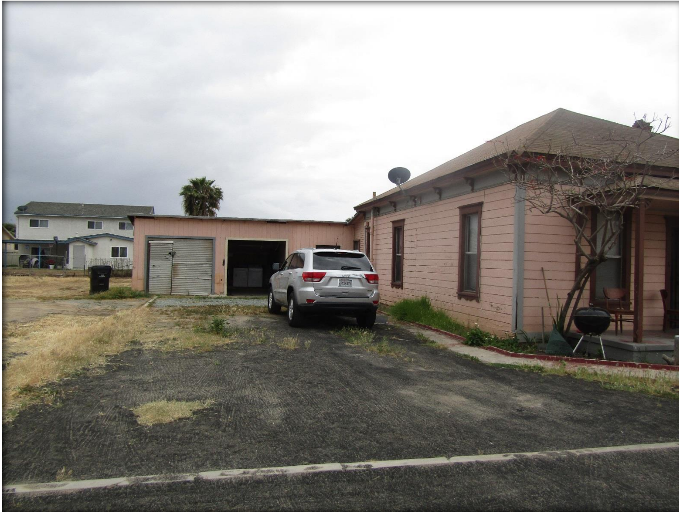
Garage Addition, East Façade