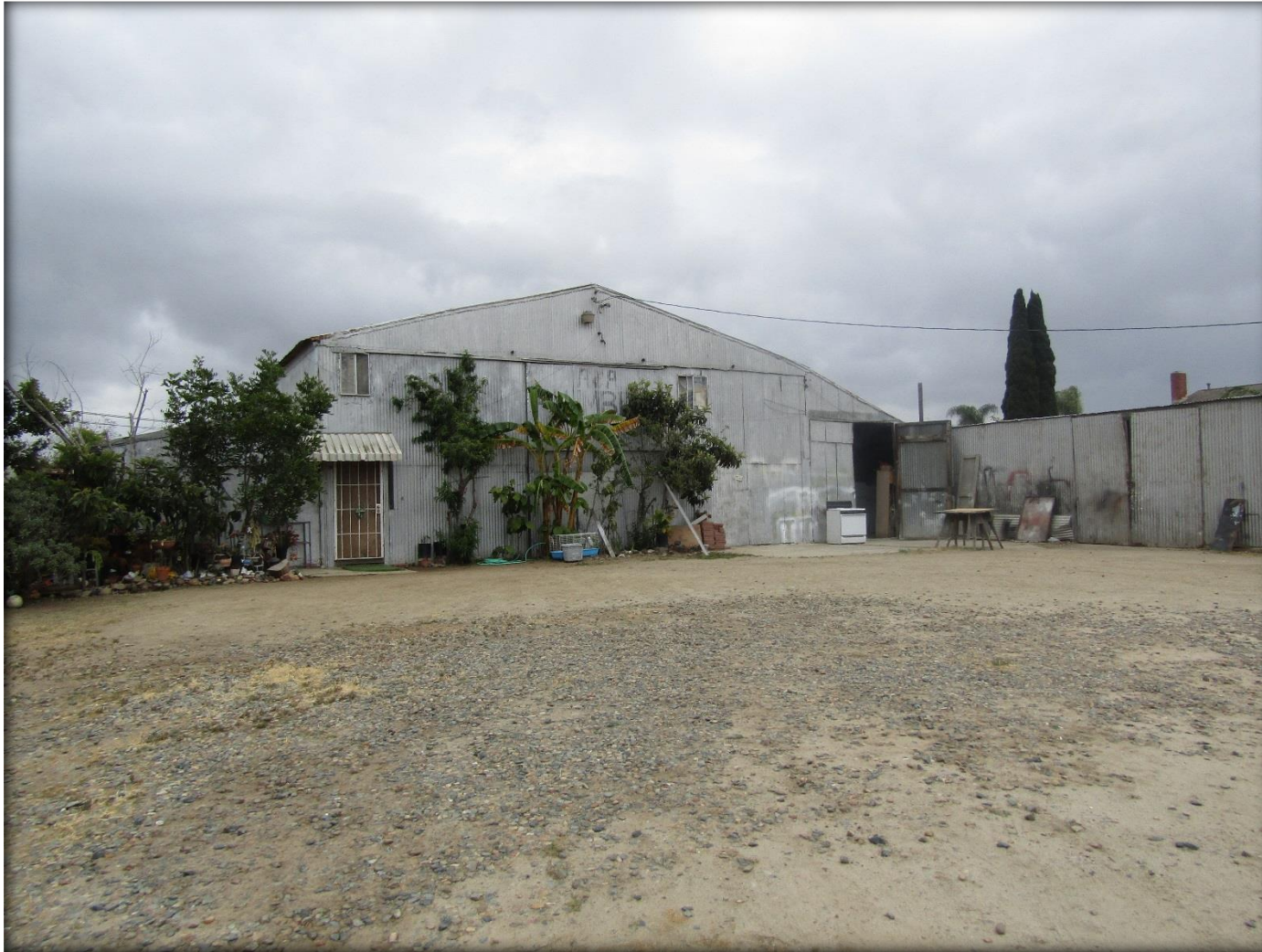
Barn, West Façade